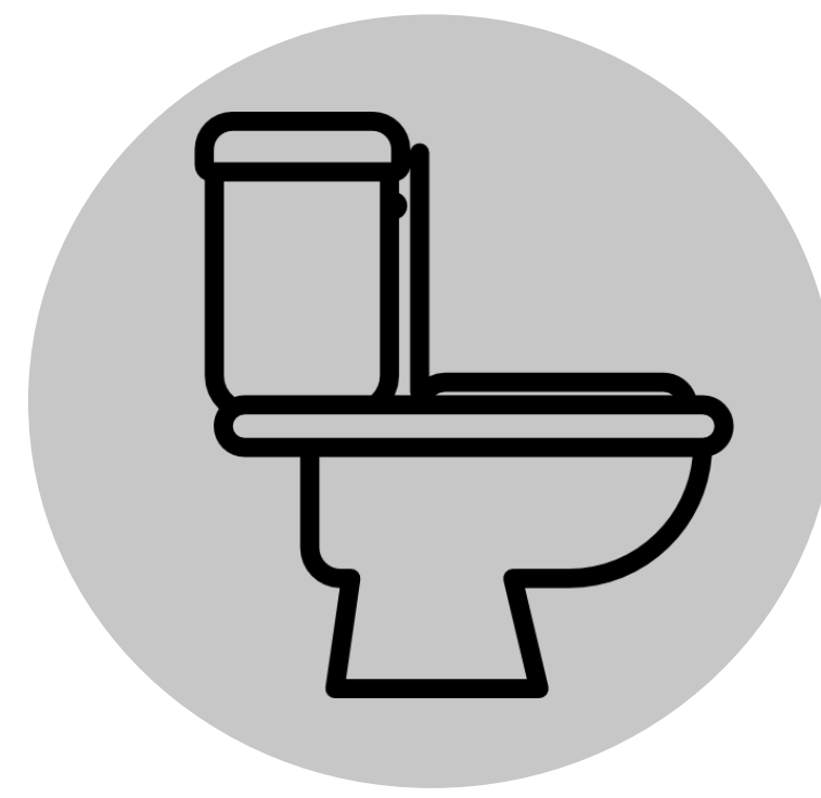
Feces and urine