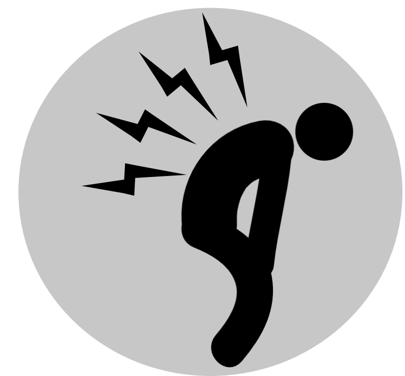
Joint and muscle pain