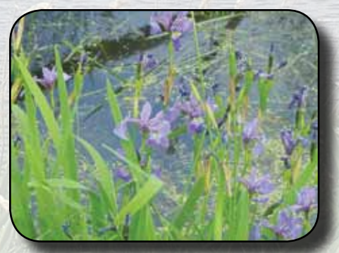
Blue Flag/Wild Iris 7

The Fitness Center will be moving at the end of April and will reopen April 29<sup>th</sup> at our new location in the Creative Apparel Building. This move will provide us with more space so that we can expand programming. Please come see us at our new location.