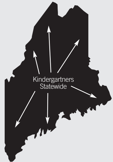
Prevalence of Health Outcomes and Risk Factors Statewide