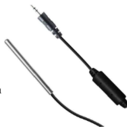
10ft VFC311 Calibrated Smart Probe for Data Logger