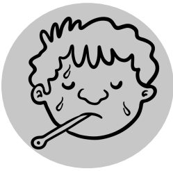
Fever and Chills