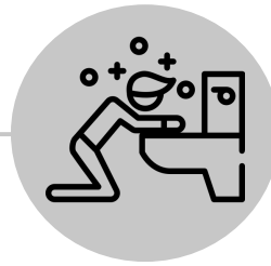
Nausea and Vomiting