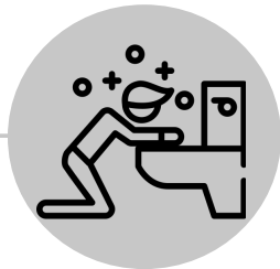
Nausea and Vomiting