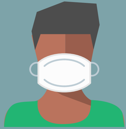
Person with COVID-19