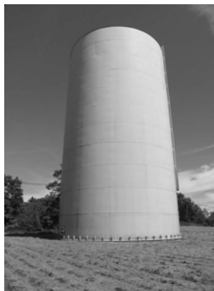
1.0 MG tank in Wells

Hybridizing the system has been a resounding success and should allow KK&W to meet its expected demand for the next twenty years.