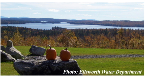
The Ellsworth Water Department utilized the Land Acquisition Loan program to purchase 1196 acres in 2010.

The Drinking Water Program believes that a water system's ownership or legal control of a watershed or wellhead protection area is the most effective means of protecting its source. The DWP's Land Acquisition Loan (LAL) program helps systems accomplish this by offering low-interest loans for the purchase or legal control of the land within drinking water source protection areas. Since 1997, the LAL has provided $5.7 million in loans to protect 4,339 acres of drinking water source protection lands across the State. However, in the past 10 years, only three systems have taken advantage of