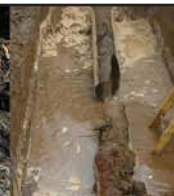
Water Main Break