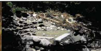
River Bed Damage