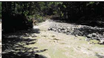
Access Road Flooded