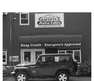
12 WRANGLER SPORT 2dr *EZ CAR CREDIT-YOU'RE APPROVED! WWW.GARRETTSAUTO.COM 1A, 2mi fr/Brewer Walmart, 989-6777

GMC 2014 TERRAIN SLE-2 4DR SUV AWD (2.4L) Black/Black, 100,600 Mi, Private Party, AWD, heated seats, On-Star, remote start & more. Very clean & rides great! $10,250 207-458-5053