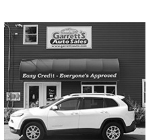
JEEP '14 CHEROKEE LATITUDE 4WD *EZ CAR CREDIT-YOU'RE APPROVED! WWW.GARRETTSAUTO.COM 1A, 2mi/fr Brewer Walmart, 989-6777