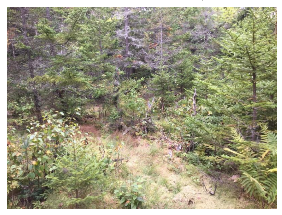
Photo 8: Wetland GG. September 2016.