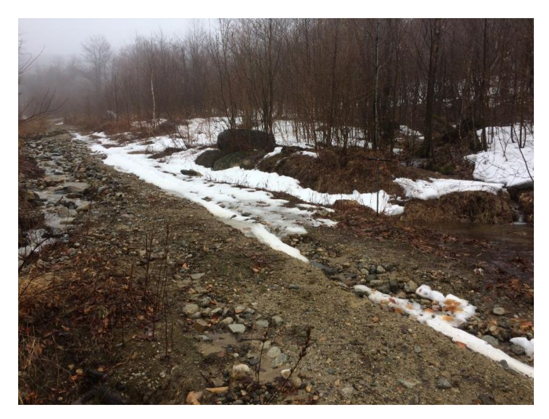
Photo 17: Stream S-D at the access road. Stantec Consulting Services Inc. March 2018.