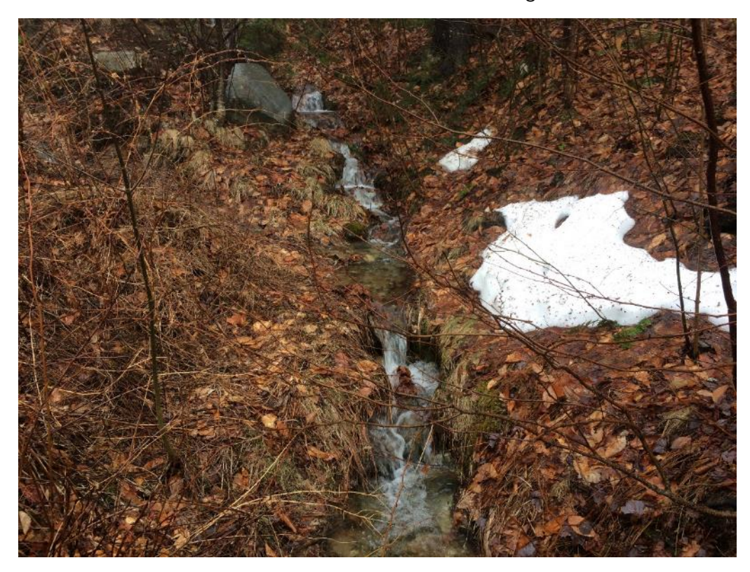
Photo 12: Stream S-02. Stantec Consulting Services Inc. March 2018.