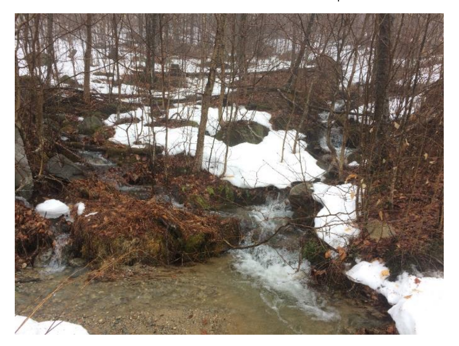
Photo 20: Stream S-E. March 2018.