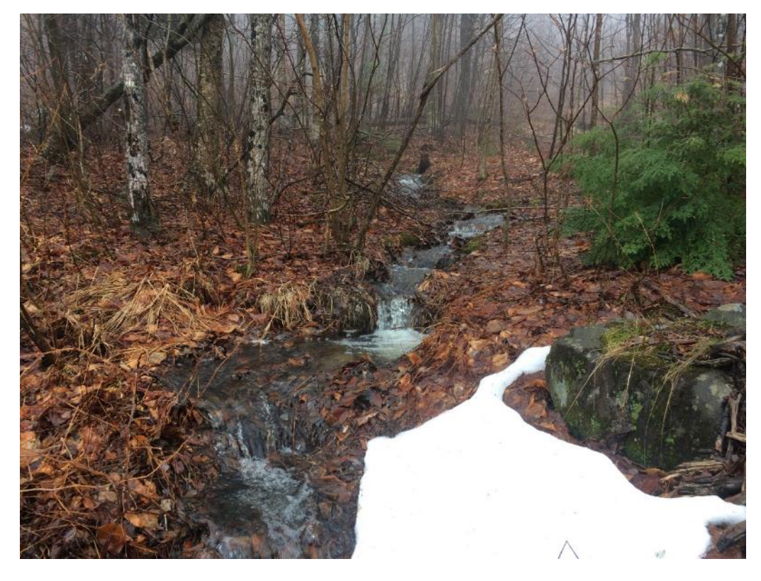
Photo 10 : Stream S-01. Stantec Consulting Services Inc. March 2018.