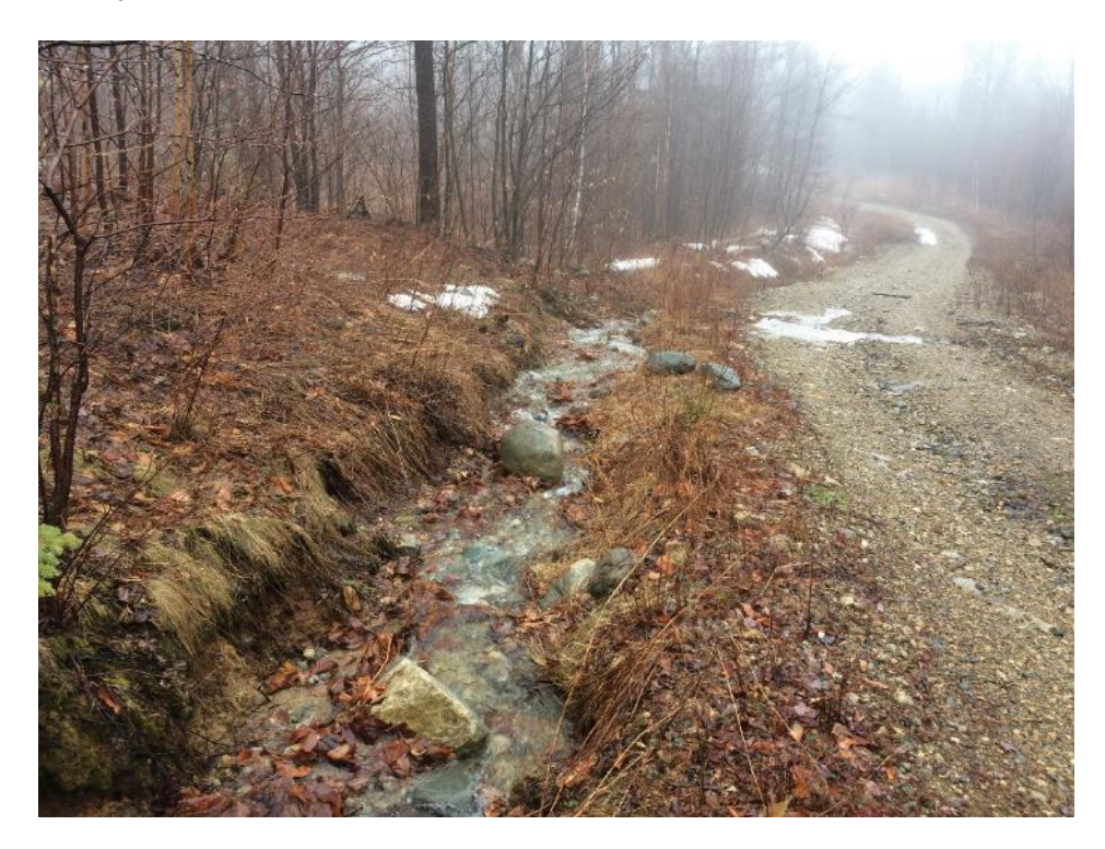
Photo 13: Stream S-02 at the access road. Stantec Consulting Services Inc. March 2018.