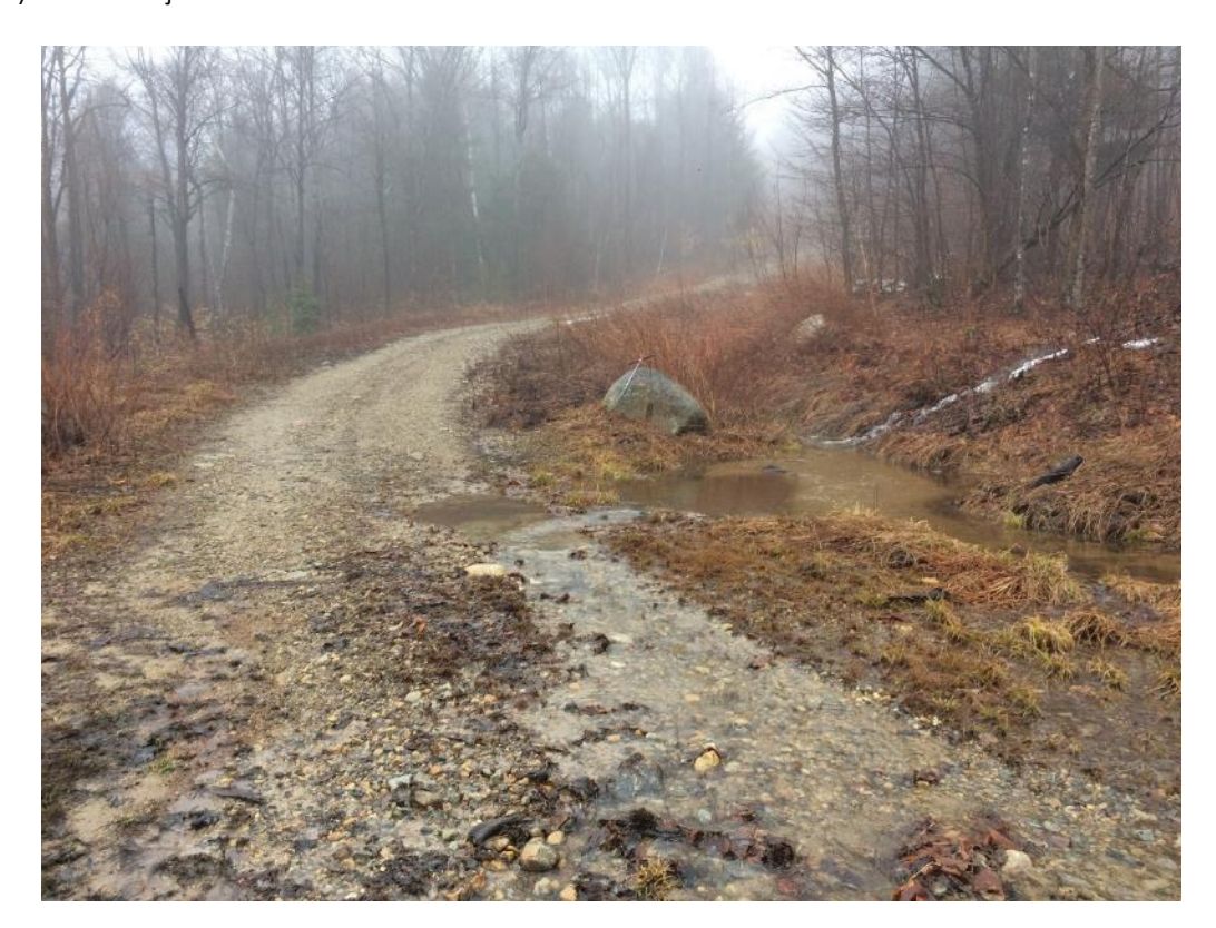
Photo 11: Stream S-01 at the access road. Stantec Consulting Services Inc. March 2018.