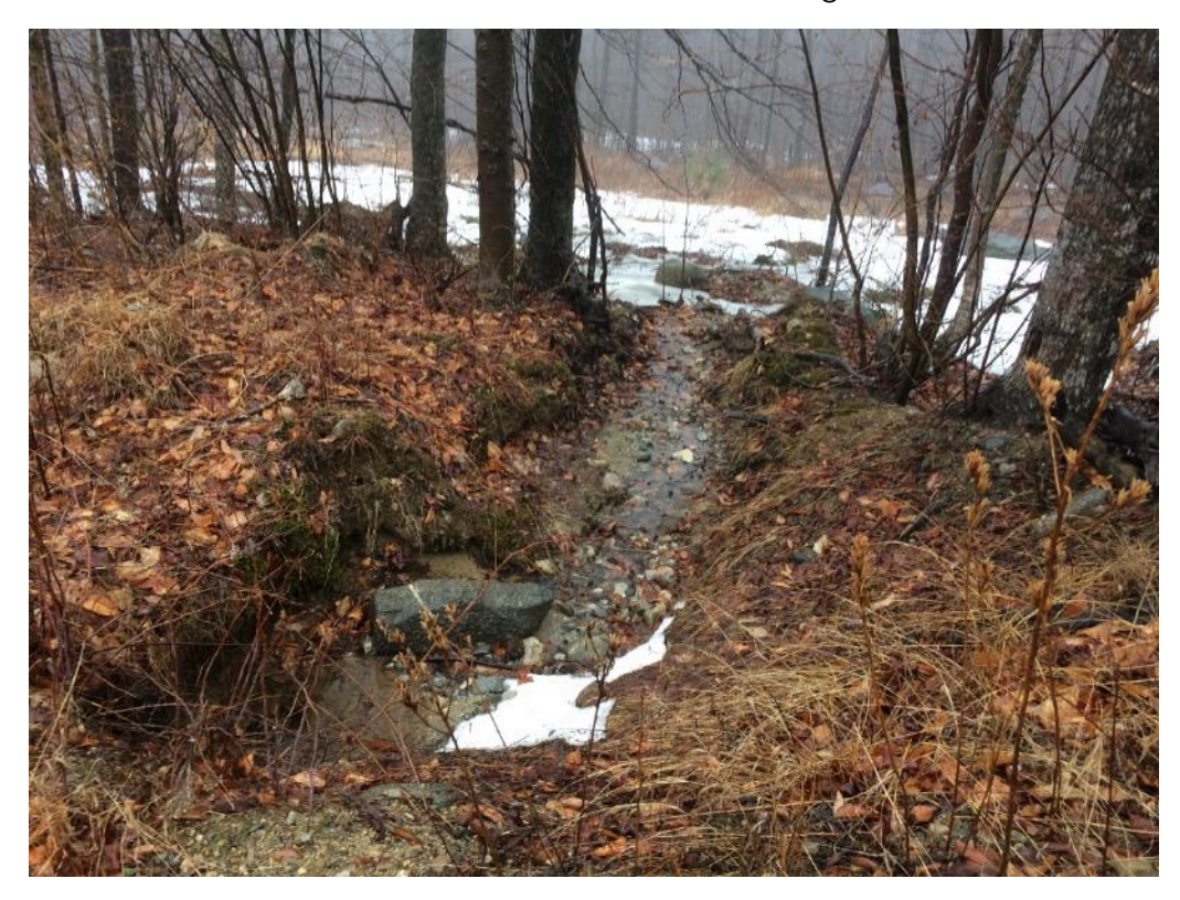
Photo 18 : Stream S-F. Stantec Consulting Services Inc. March 2018.