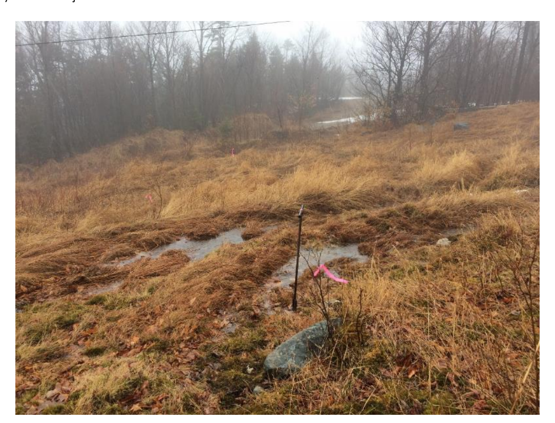
Photo 9 : Wetland 01RKA. Stantec Consulting Services Inc. March 2018.