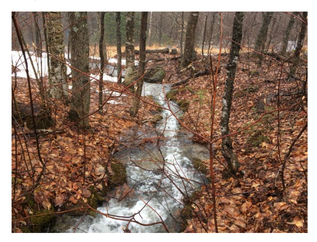
Photo 15 : Stream S-B. Stantec Consulting Services Inc. March 2018.