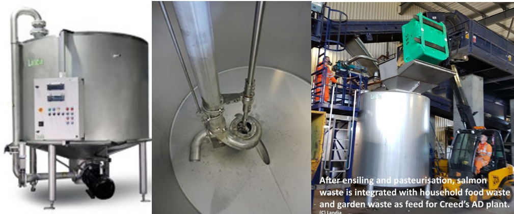
Examples of commercially available fish ensilage systems