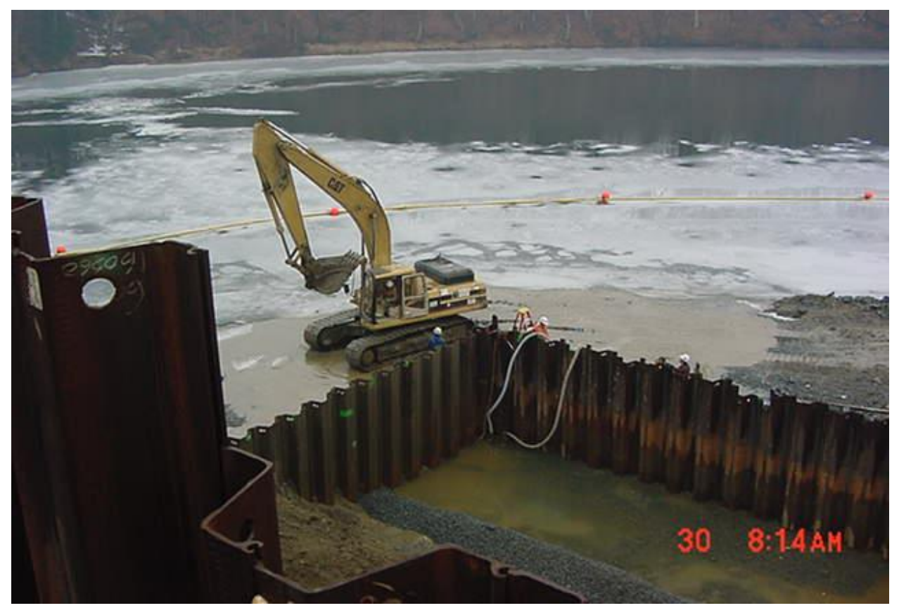
Photo 4: Example of a shoreline coffer cell and excavator on the mudflats.