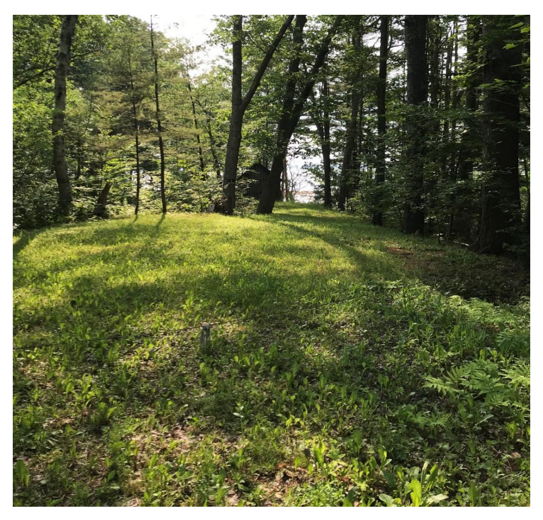
Photo 1: Upland route looking east over the "horseback" roadway zone at the Eckrote property