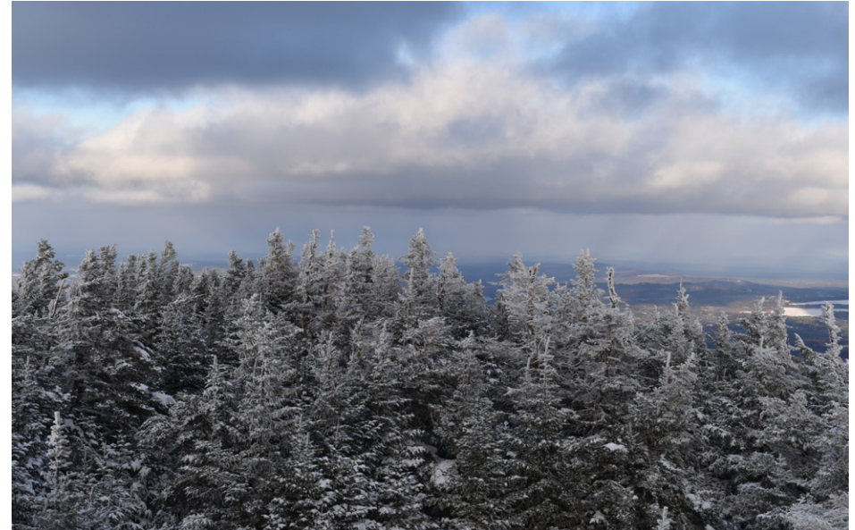
Photograph 2: View looking northeast from the summit observation tower on Coburn Mountain. The Project will not be visible looking in this direction due to foreground vegetation.