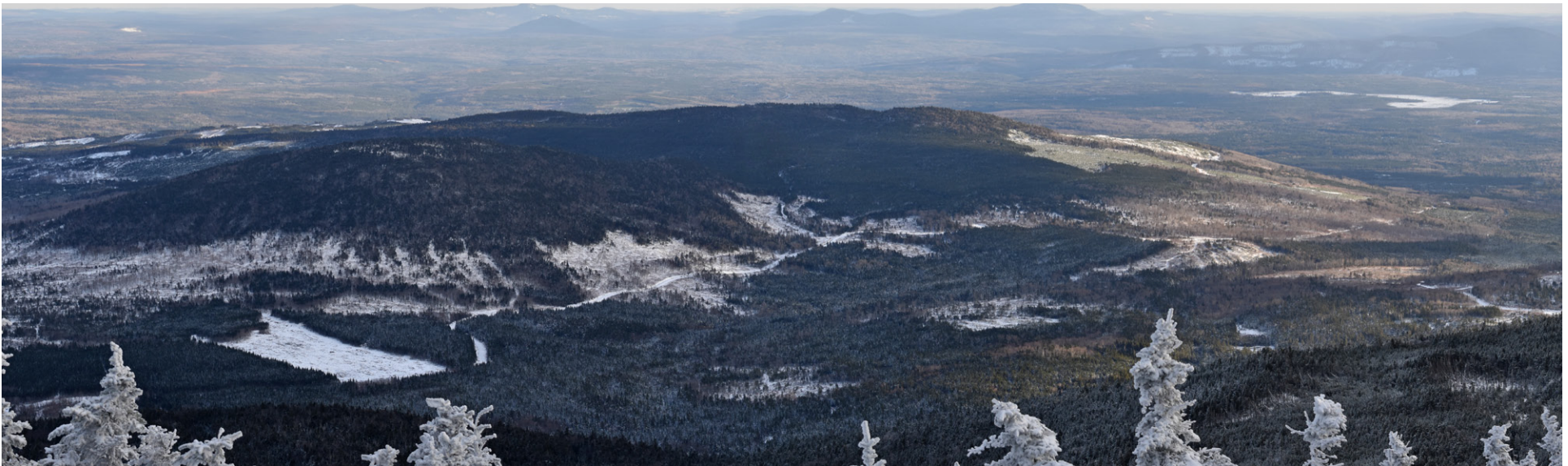
Photograph 3: Panoramic view looking southeast from the summit observation tower on Coburn Mountain. The closest portion of the proposed 150' wide corridor clearing will be visible in the mid-ground on the west side of Johnson Mountain approximately 1.2 miles from this viewpoint. See Photosimulation 44 in Appendix D for leaf-off / snow-cover.