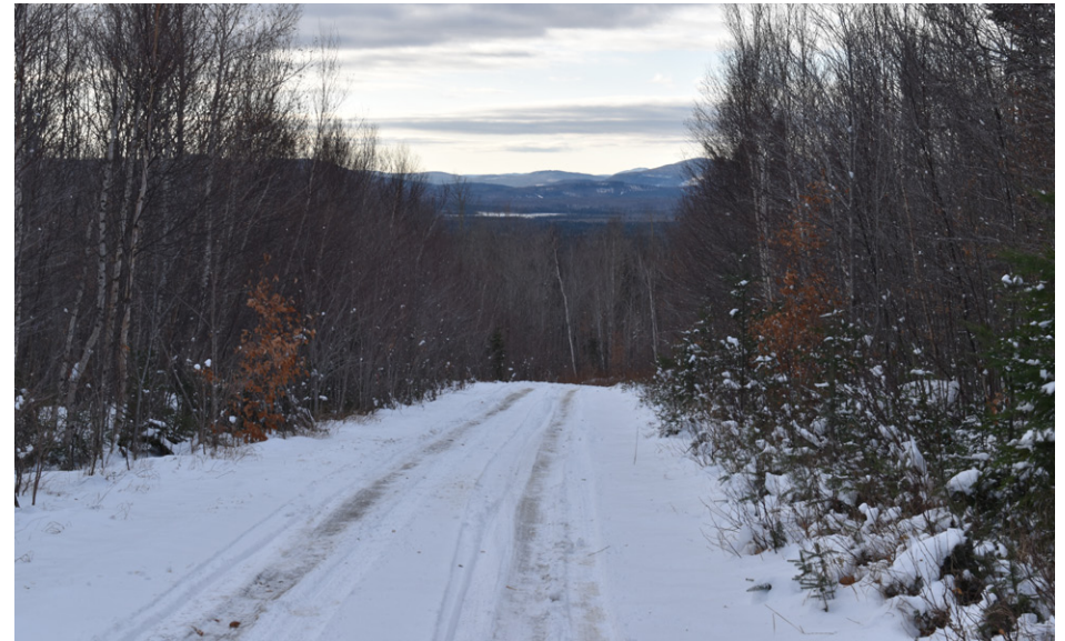
Photograph 12: View looking south along Judd Road on Weyerhaeuser land from a point within the proposed new HVDC corridor.