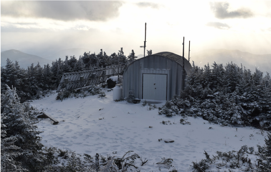
Photograph 1: View looking southwest from the summit observation tower on Coburn Mountain. The Project is not located within this southwest field of view and therefore will not be visible when looking in this direction.