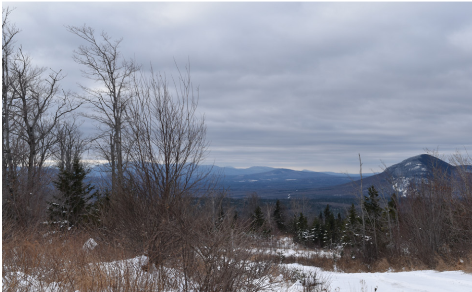
Photograph 11: View looking south along a local snowmobile and ATV trail on Judd Road on Weyerhaeuser land, from a point within the proposed new HVDC corridor.