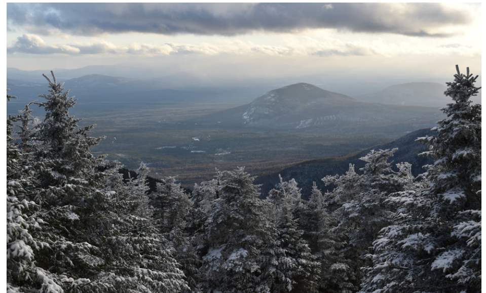
Photograph 6: View looking south along the summit snowmobile trail descending down Coburn Mountain. The Project will not be visible in this area due to foreground evergreen vegetation.