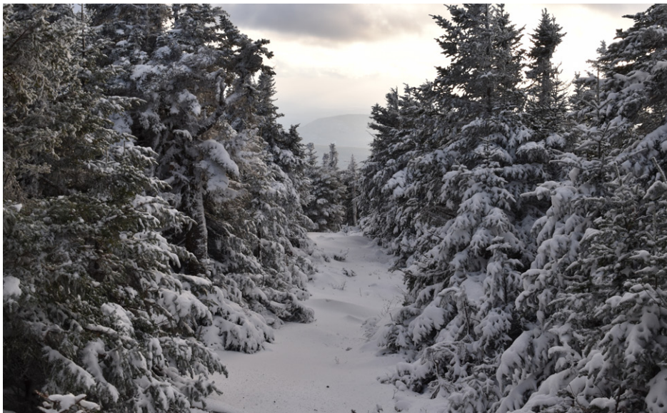
Photograph 5: View looking southwest at the start of the descent along the summit snowmobile trail on Coburn Mountain. The Project will not be visible in this area due to foreground evergreen vegetation.