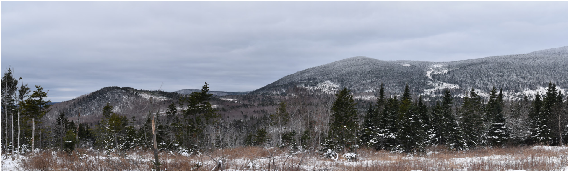
Photograph 10: Panoramic view looking west towards the Project from a local snowmobile trail on Judd Road on Weyerhaeuser land. The southern portion of Coburn Mountain is visible in the background. Tops of structures and conductors may be visible above the foreground harvested area and mid-ground vegetation.