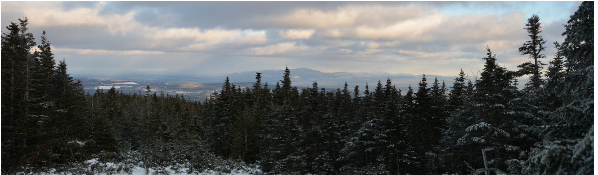
Photograph 7: Panoramic view looking east from a cleared area mid-way up Coburn Mountain. The Project will not be visible in this area due to foreground evergreen vegetation.