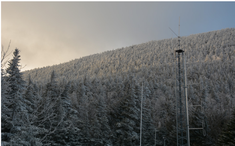
Photograph 8: View looking northwest toward communication structures in the cleared area mid-way up Coburn Mountain.