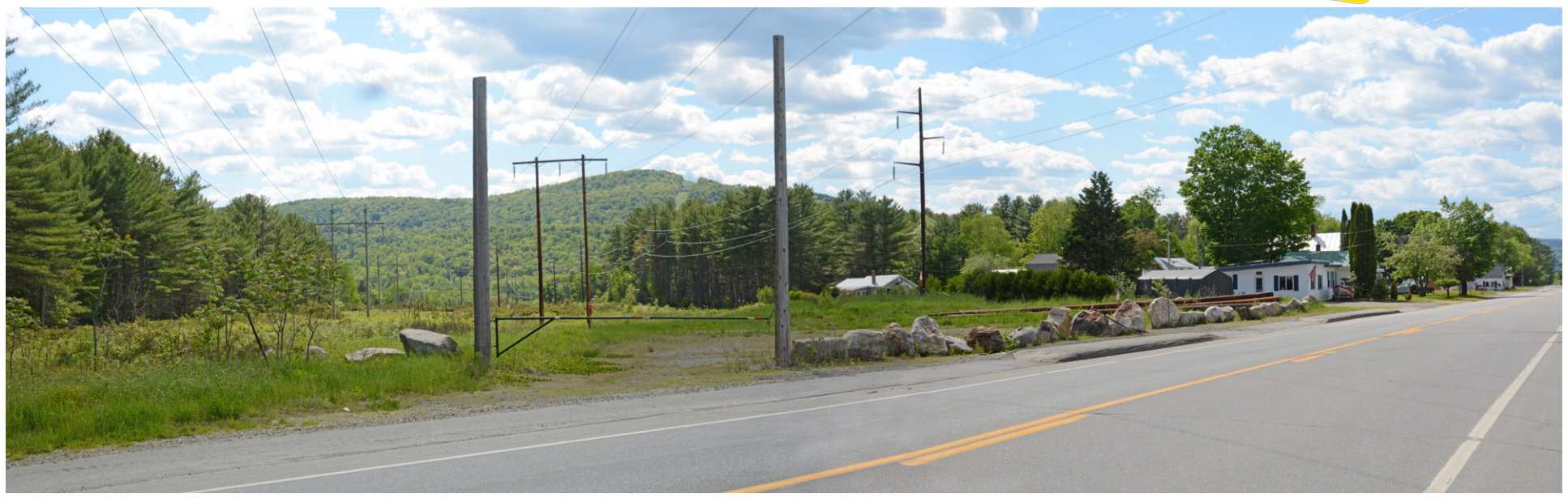
Photograph 1: View looking west from Route 201 in Moscow of the existing transmission line crossing that runs in a southeast direction from Wyman Hydroelectric Dam. The project will not be visible from this viewpoint.