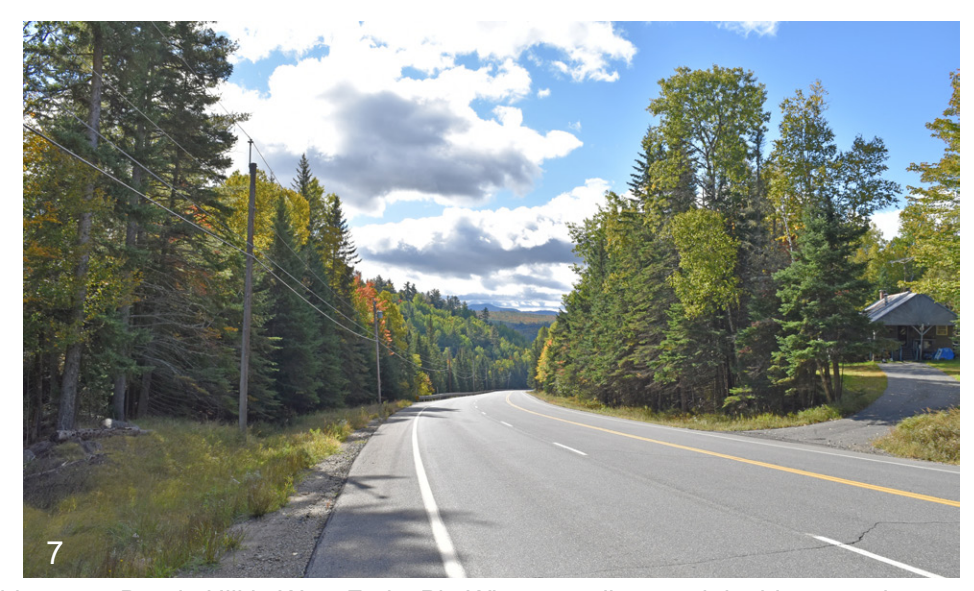
Photograph 6&7: View looking north (above), and south (right), from Route 201 mid way up Durgin Hill in West Forks Plt. When traveling south in this area, views looking south towards Moxie Mountain can be seen. The Project is located 3.6 miles east of this viewpoint and will not be visible in any direction due to vegetation and terrain.