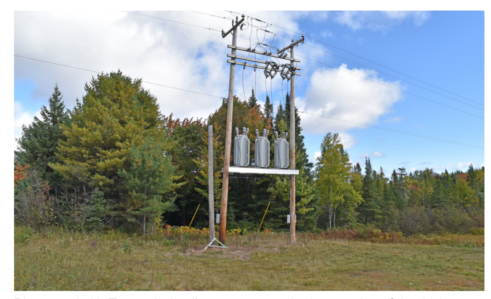
Photograph 13: Transmission line structure at the intersection of the Jackman Tie Line and Route 201 in West Forks Plt.