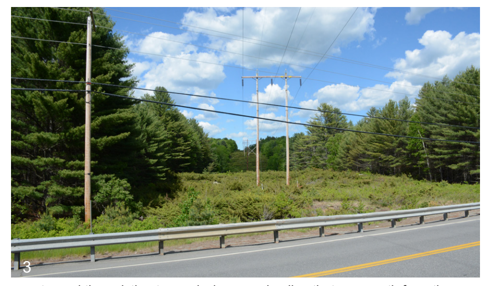
Photograph 2&3: View looking west (above), and east (right) from Route 201 in Moscow toward the existing transmission crossing line that runs north from the Wyman Hydroelectric Dam. The existing 225' wide corridor clearing will be widened by 75' on the western side to accommodate the proposed HVDC transmission line. See Photosimulation 19 in Appendix D.