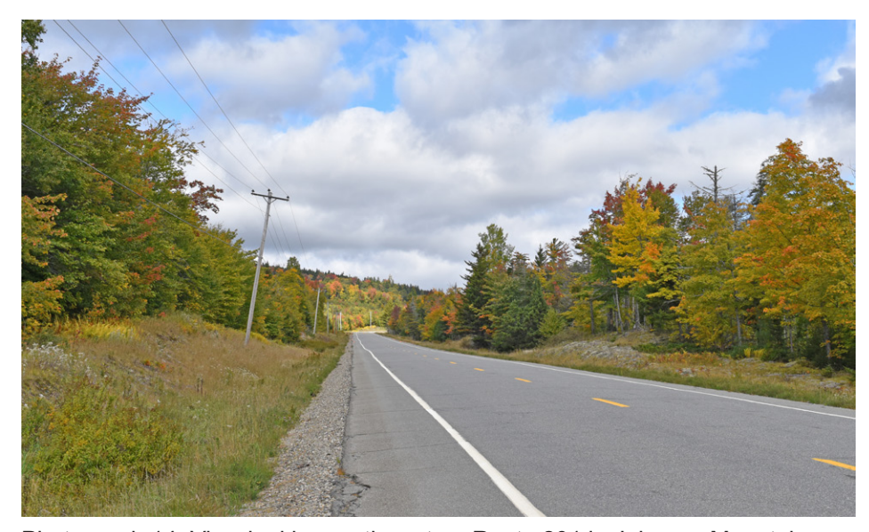
Photograph 14: View looking northwest on Route 201 in Johnson Mountain Twp approximately 800 feet south of the Project's crossing over Route 201. Conductors and one structure will be visible from this viewpoint.