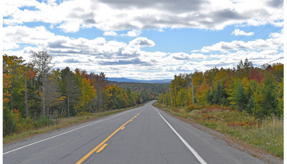
Photograph 16: View looking southeast on Route 201 approximately 1,200 feet north of the Project's crossing over Route 201. Conductors and one structure will be visible from this viewpoint. See Photosimulation 9 in Appendix D.

visible 125 feet to the east of the crossing and 800 feet to the west of the crossing.