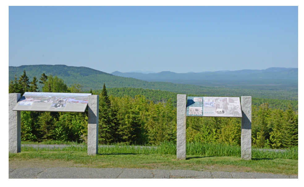
Photograph 24: Interpretive Panels at the Attean View Rest Stop with nearby Catheart Mountain in the background.