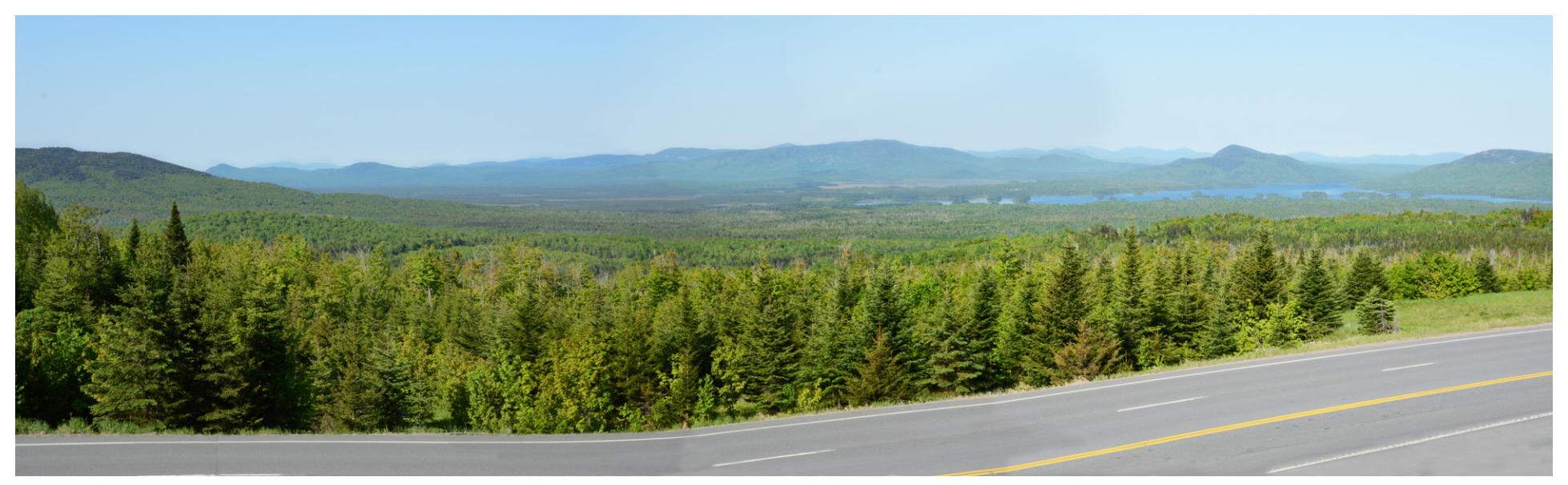
Photograph 22: View looking southeast to southwest toward the Project from the Attean View Rest Stop on Route 201 in Jackman. Individual structures will be difficult to see at this distance, but the corridor clearing may be slightly visible at a distances of 7.1 to 12.0 miles. See Photosimulation 6 in Appendix D.