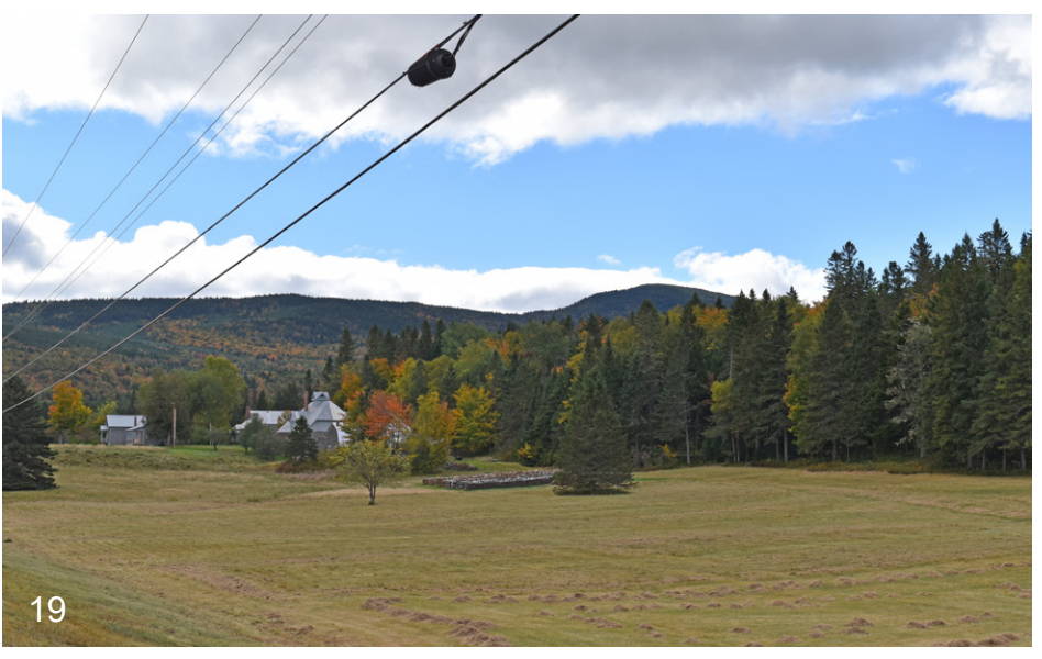
Photograph 18&19: View looking southeast from Route 201 in Parlin Pond Twp. When traveling southbound at 45 mph, a field on the west side of Route 201 opens up views towards the Project crossing over the northeast end of Coburn Mountain for approximately 15 seconds of travel along 1000 feet of road visibility.