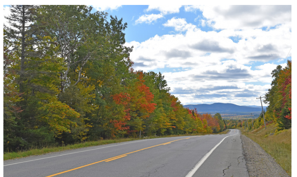
Photograph 17: View looking south on Route 201 approximately 0.75 miles from the Project. Dead River Mountain is visible in the background. The top of one structure and conductors would be minimally visible from this viewpoint.