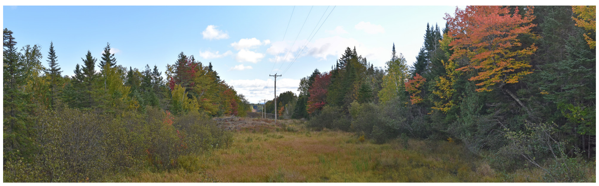
Photograph 12: View looking east towards the Jackman Tie Line from a point at its intersection with Route 201 in West Forks Plt. The Project crosses Route 201 0.7 miles north of this viewpoint and will not be visible looking in this direction.