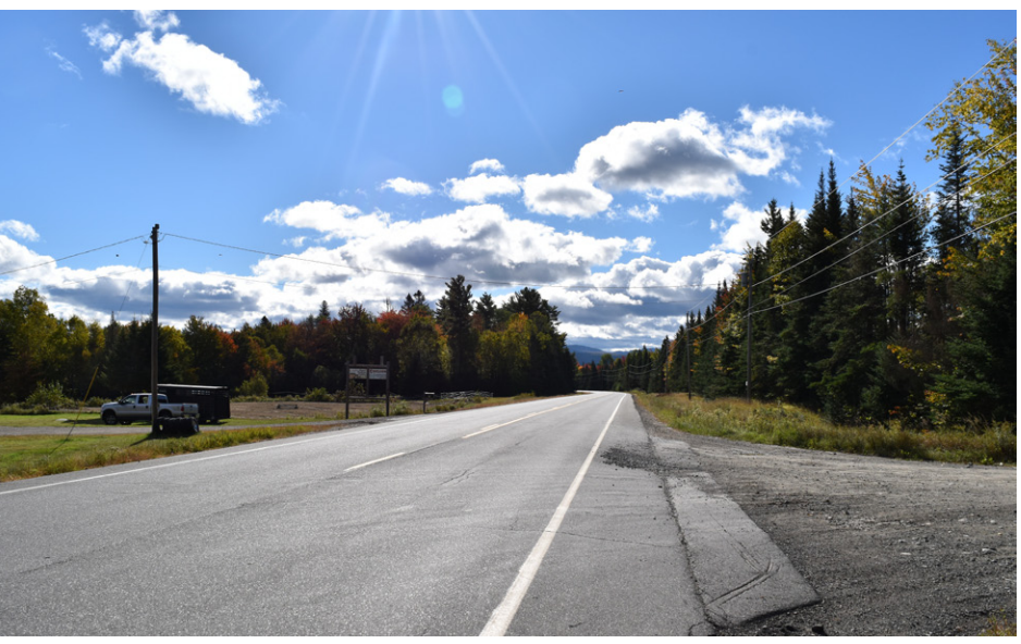
Photograph 8&9: View looking northeast (above), and southeast (right), from Route 201 near the top up Durgin Hill in West Forks Plt. When traveling southeast in this area, views looking southeast towards Pleasant Pond Mountain and Moxie Mountain can be seen. The Project is located 3 miles east of this viewpoint and will not be visible in any direction due to vegetation and terrain.