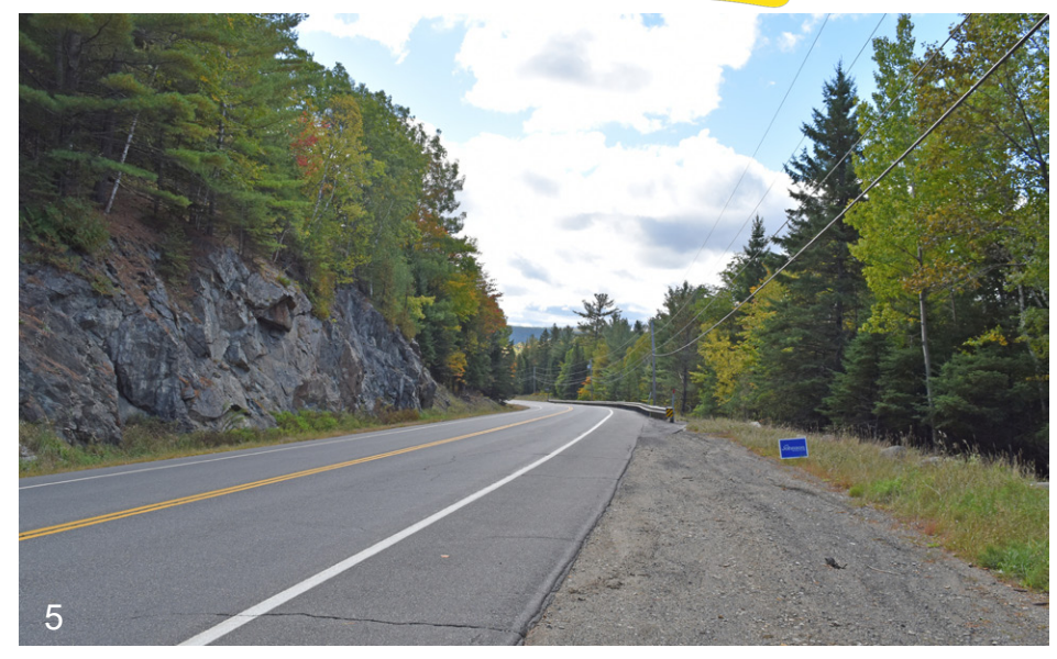
Photograph 4&5: View looking north (above), and south (right), from Route 201 near the base of Durgin Hill in West Fork Plt. The Project is located 3.5 miles east of this viewpoint and will not be visible in any direction due to vegetation and terrain.