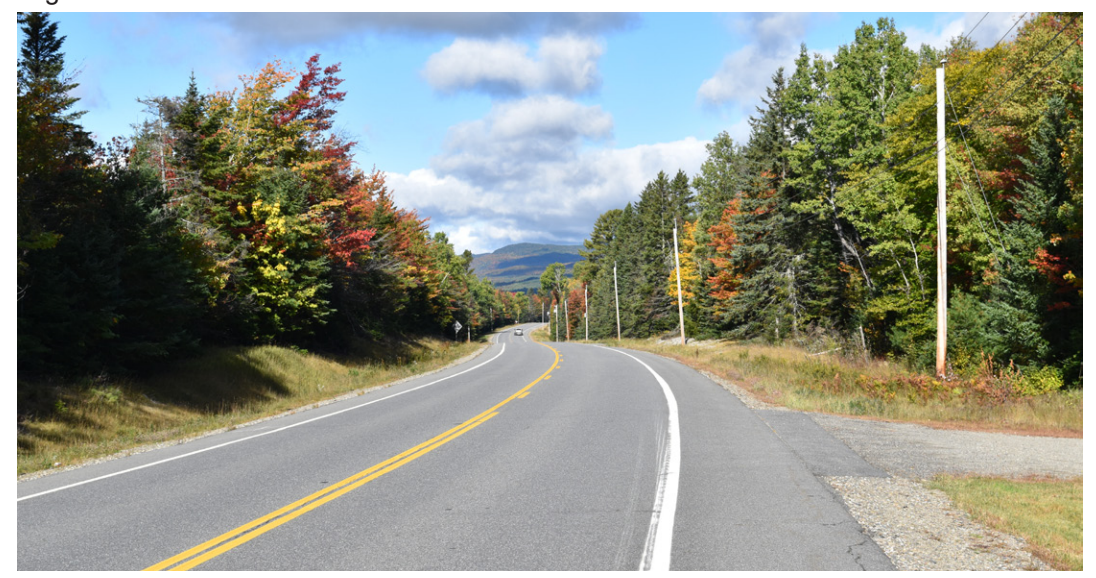
Photograph 11: View looking northwest from the crest of a hill on Route 201 near Grand View Lodging. Johnson Mountain is visible in the center of the image. A glimpse of the project from this viewpoint may be visible at the base of Johnson Mountain, 4.4 miles away.