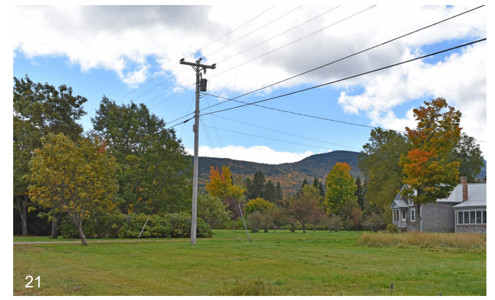
Photograph 20&21: Continued views looking southeast while traveling southbound on Route 201 towards the area where the project will cross over Coburn Mountain.