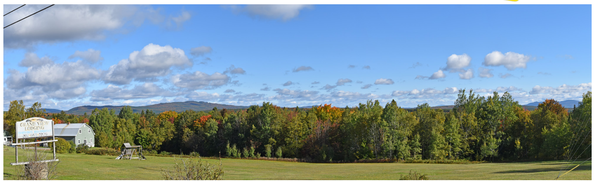
Photograph 10: View looking north to northeast from the crest of a hill on Route 201 near Grand View Lodging in West Forks Plt. Cold Stream Mountain is visible in the left hand side of the image. The Project is located 3 miles northeast of this viewpoint and will be blocked or highly buffered from views due to intervening vegetation and terrain.