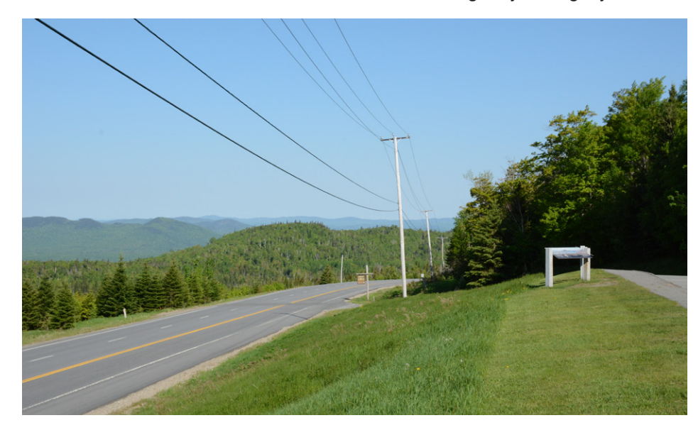
Photograph 23: View looking northwest showing the elevated rest stop above Route 201. The project will not be visible looking in this direction.