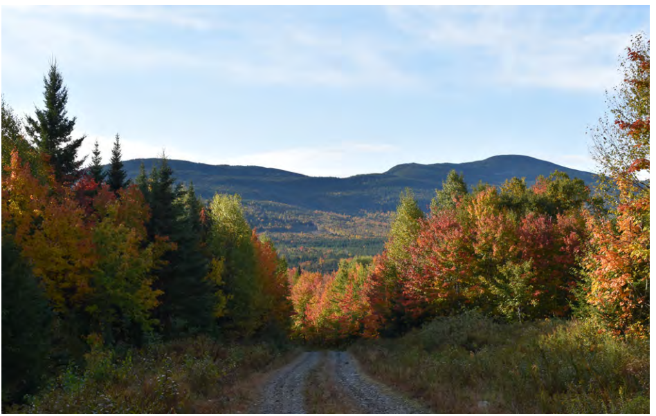
Photograph 16: View looking south from ITS 89 while descending toward Coburn Mountain. The project will be visible crossing over part of Coburn Mountain approximately 1.9 miles from this viewpoint.