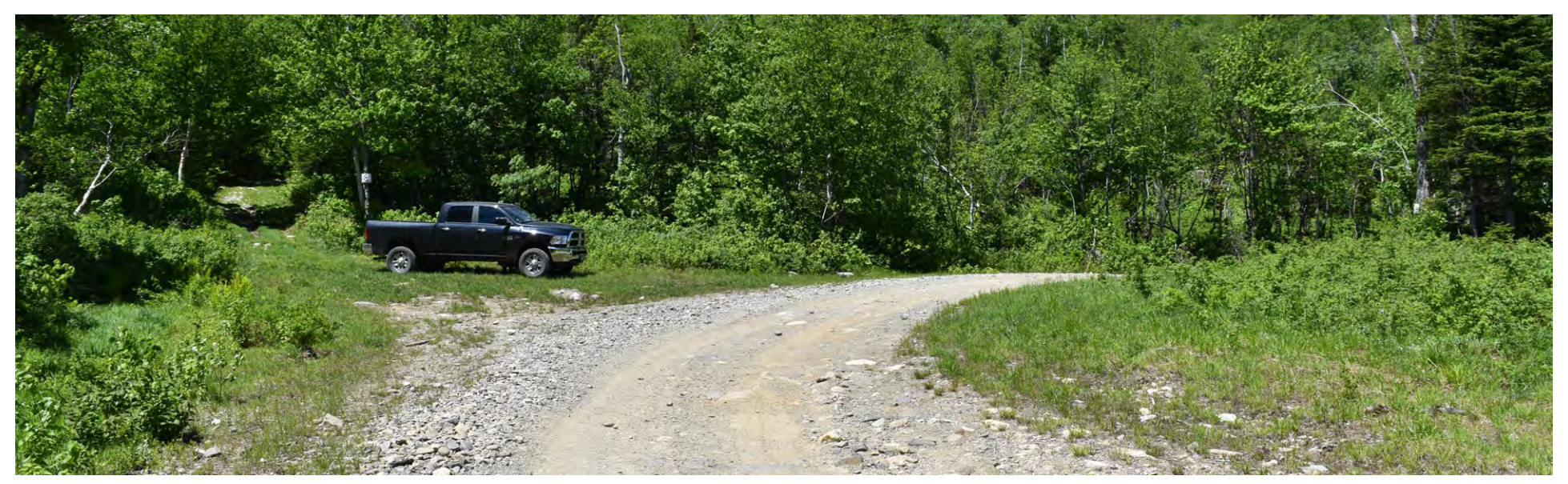
Photograph 10: Panoramic view looking northwest towards the Coburn Mountain trail head from a point on ITS 89. The Project will not be visible in this direction.