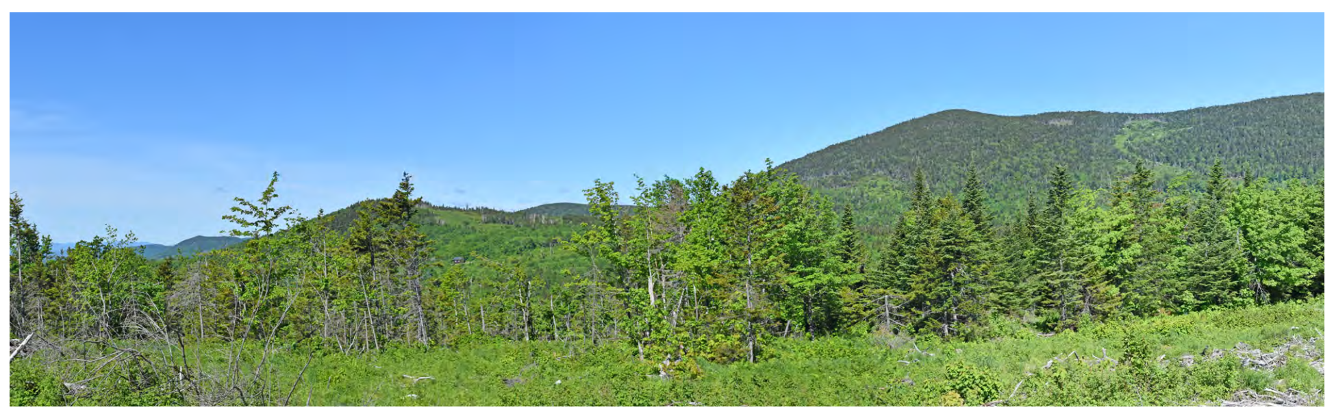
Photograph 12: Panoramic view looking west towards the Project from a local snowmobile trail on Judd Road. The southern portion of Coburn Mountain is visible in the background. Tops of structures and conductors may be visible above the foreground harvested area and mid-ground vegetation.