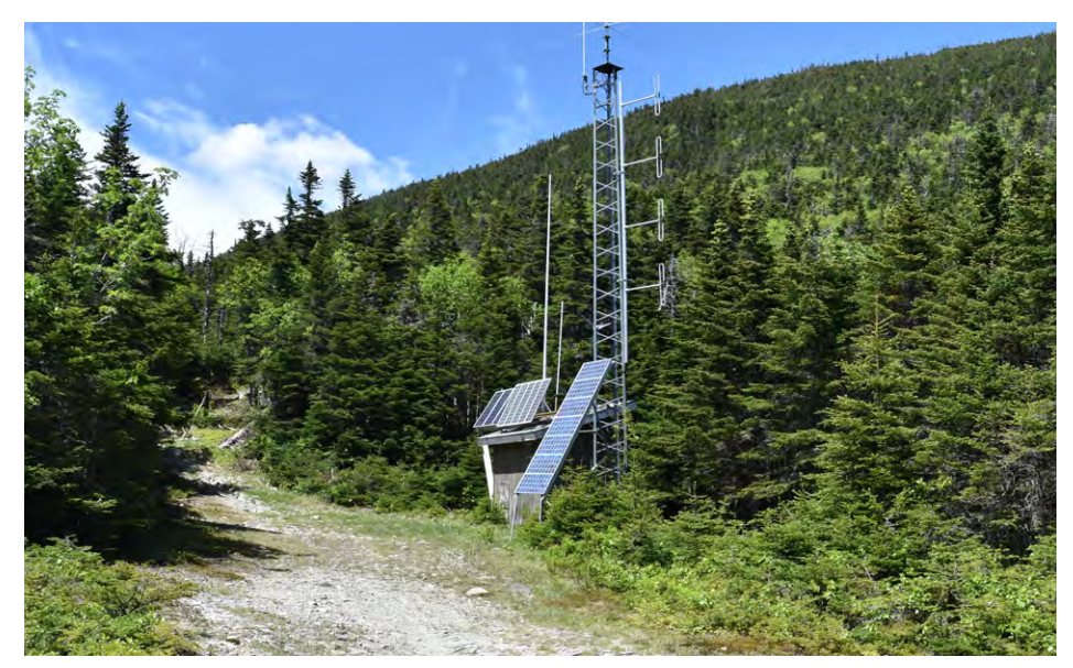
Photograph 8: View looking northwest of communication structures in the cleared area mid-way up Coburn Mountain.