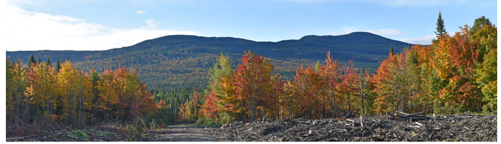
Photograph 17: Panoramic view looking south from a recent clearing on ITS 89 while descending toward Coburn Mountain. The project will be visible crossing over part of Coburn Mountain approximately 1.8 miles from this viewpoint.