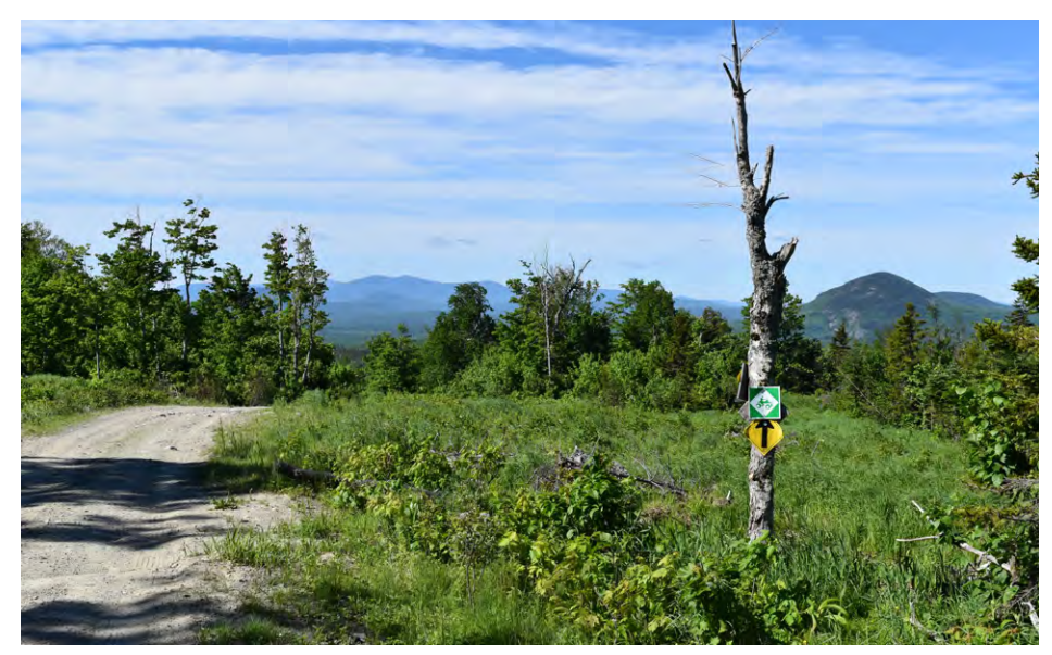
Photograph 13: View looking south along a local snowmobile and ATV trail on Judd Road, from a point within the proposed new HVDC corridor.