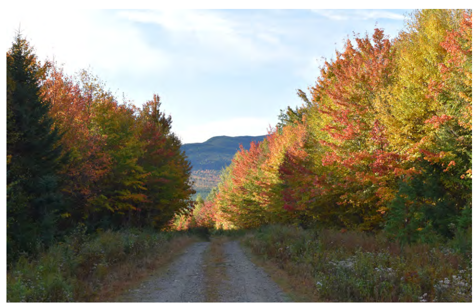
Photograph 15: View looking south from ITS 89 while descending toward Coburn Mountain. The project will be visible crossing over part of Coburn Mountain approximately 2 miles from this viewpoint.