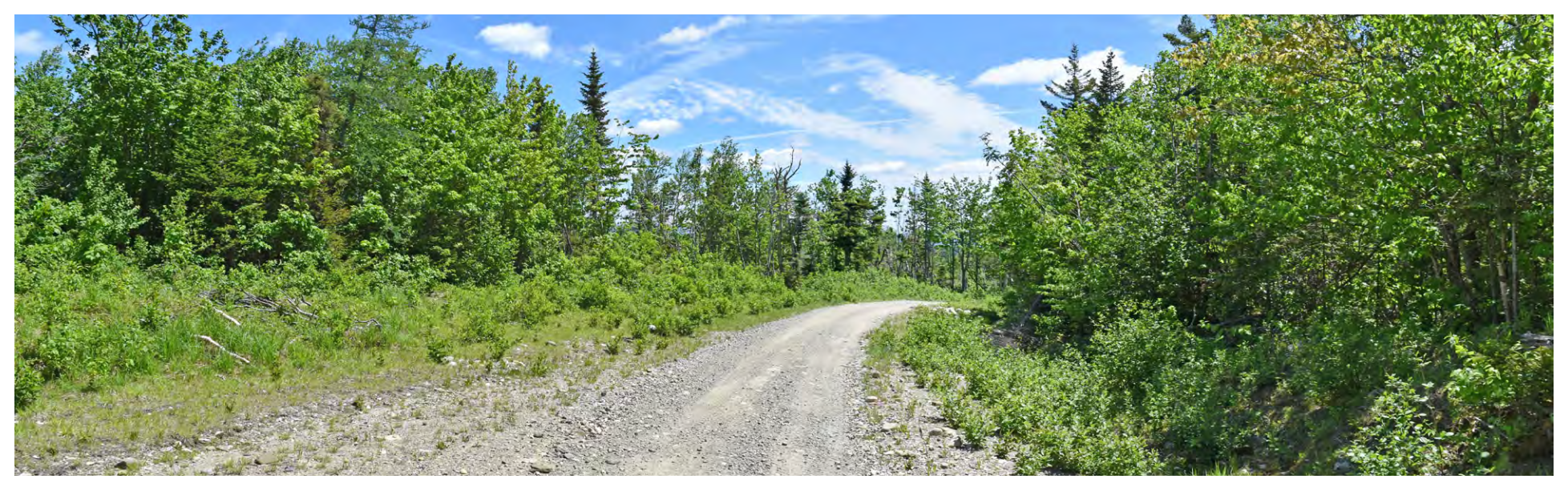
Photograph 11: Panoramic view looking east near the Coburn Mountain trail head from a point on ITS 89. The Project will be visible crossing ITS 89 approximately 300 feet from this viewpoint.