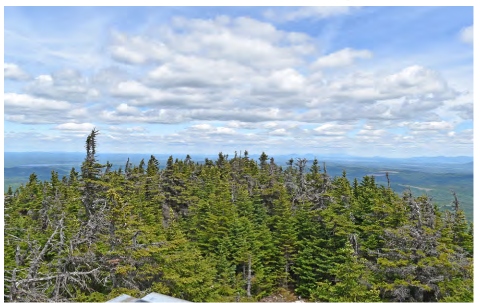
Photograph 2: View looking northeast from the summit observation tower on Coburn Mountain. The Project will not be visible looking in this direction due to foreground vegetation.