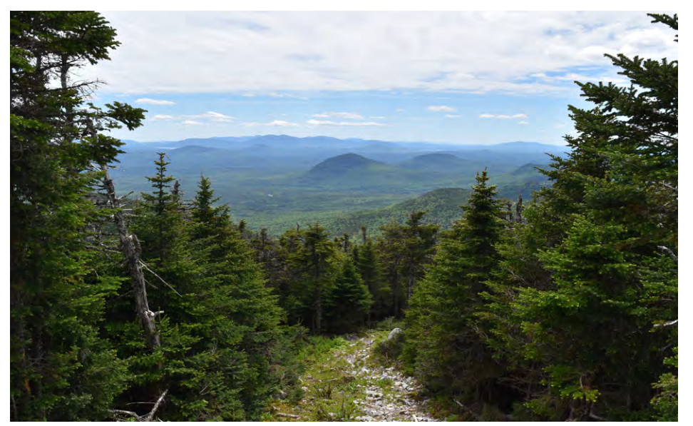
Photograph 6: View looking south along the summit snowmobile trail descending down Coburn Mountain. The Project will not be visible in this area due to foreground evergreen vegetation.