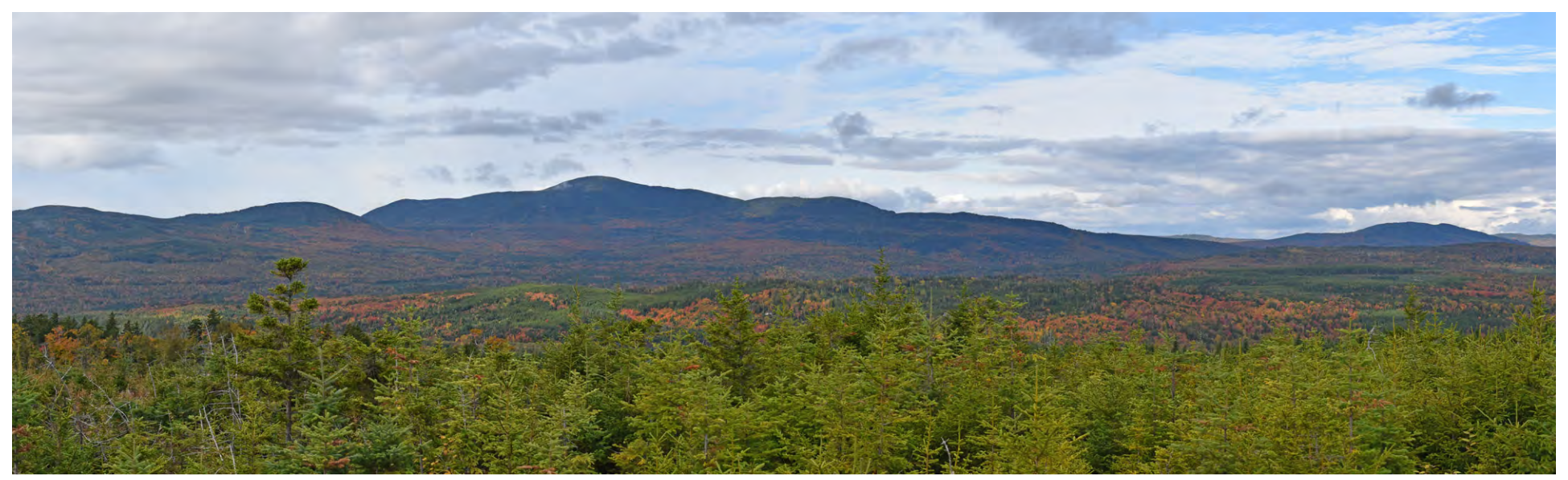
Photograph 18: Panoramic view looking west towards the Coburn Mountain from a large cleared area near ITS 87/Local Snowmobile trails. The clearing provides view towards Johnson Mountain (left side of image) and Coburn Mountain (middle of image). The Project will be visible 4.5 miles from this viewpoint.