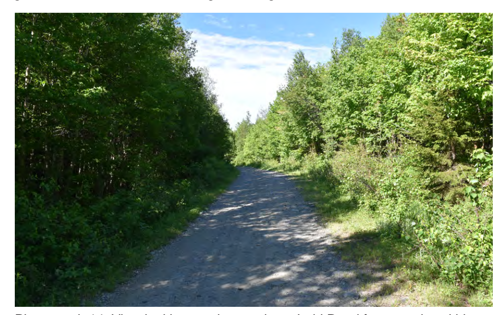
Photograph 14: View looking southwest along Judd Road from a point within the proposed new HVDC corridor.