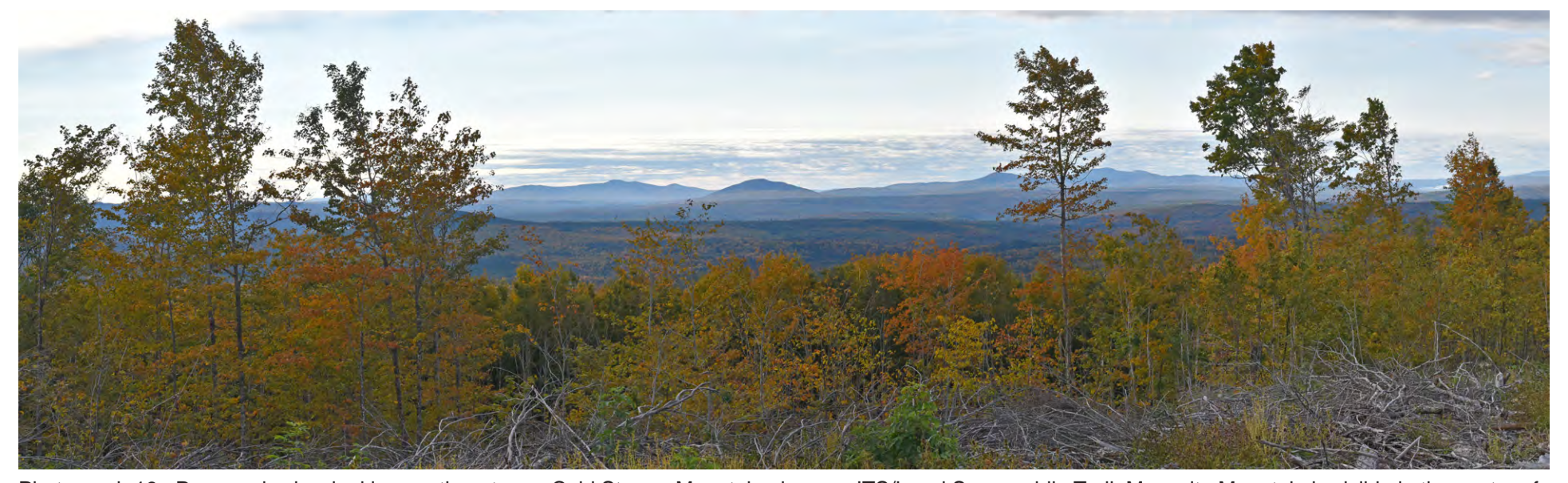
Photograph 19: Panoramic view looking southeast near Cold Stream Mountain along an ITS/Local Snowmobile Trail. Mosquito Mountain is visible in the center of the image. The Project will be visible in the mid-ground valley 1.5 miles away from this viewpoint.