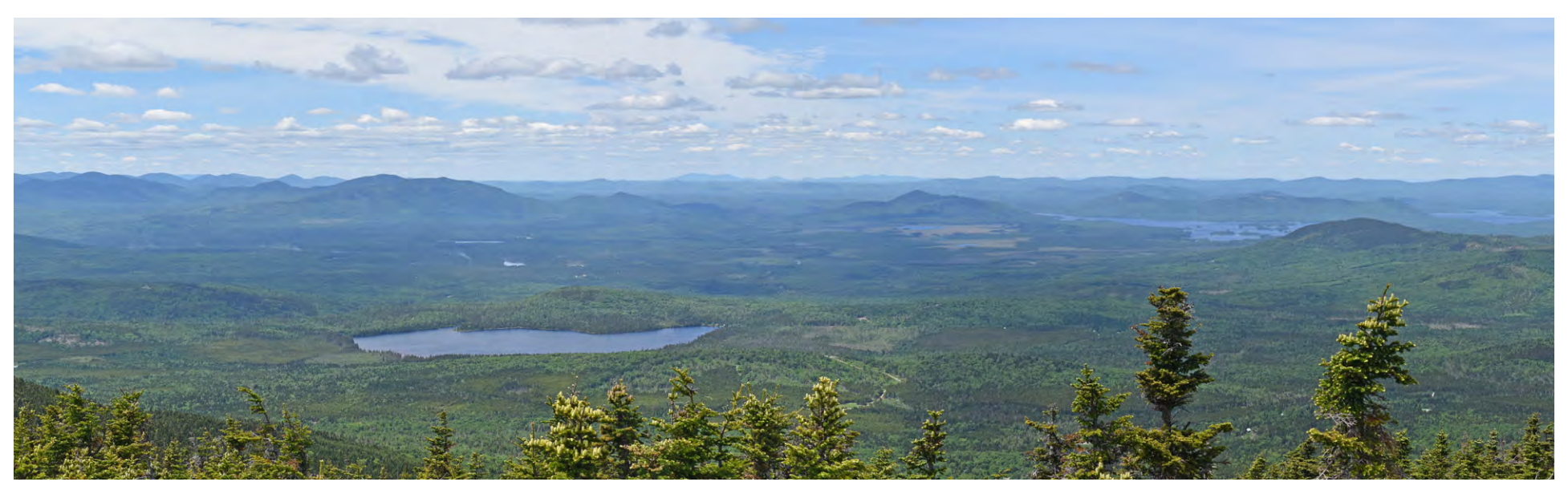
Photograph 4: Panoramic view looking southwest from the summit observation tower on Coburn Mountain. The closest portion of the proposed 150' wide corridor clearing will be visible approximately 3.5 miles from this viewpoint.