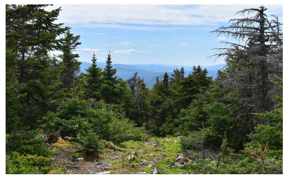
Photograph 5: View looking southwest at the start of the decent along the summit snowmobile trail on Coburn Mountain. The Project will not be visible in this area due to foreground evergreen vegetation.