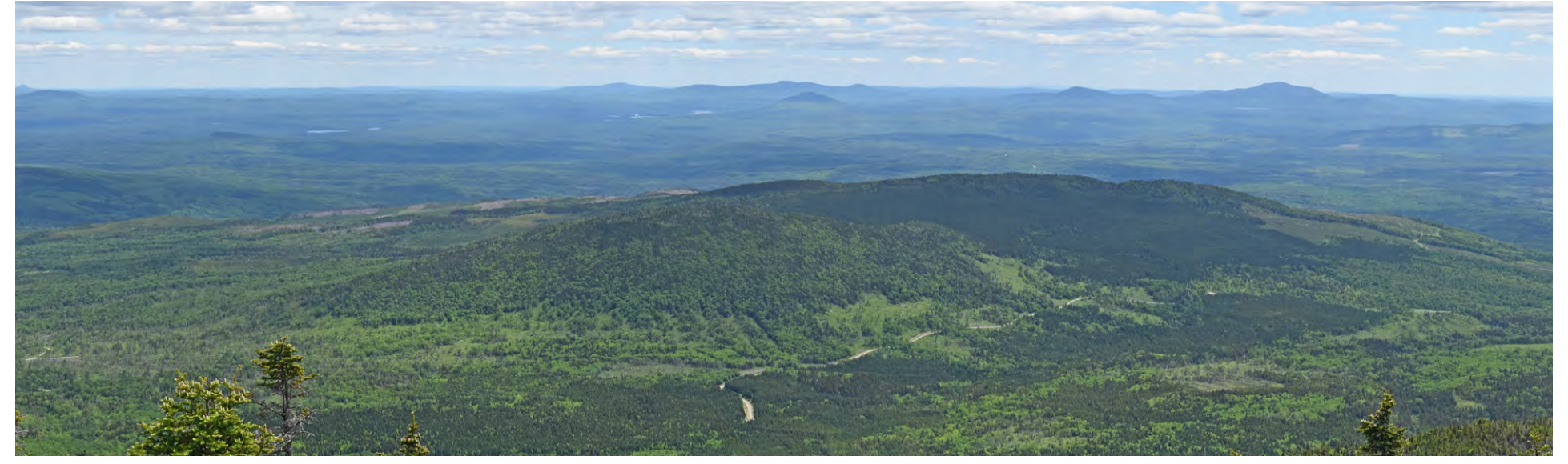
Photograph 3: Panoramic view looking southeast from the summit observation tower on Coburn Mountain. The closest portion of the proposed 150' wide corridor clearing will be visible in the mid-ground on the west side of Johnson Mountain approximately 1.2 miles from this viewpoint. See Photosimulation 8 in Appendix D.