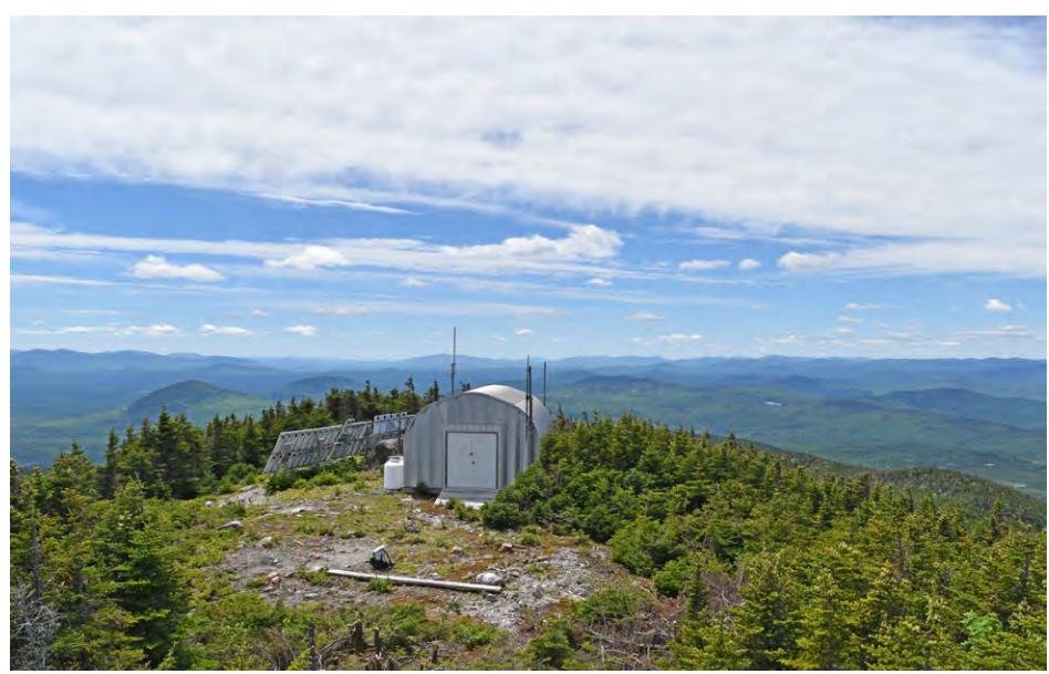
Photograph 1: View looking southwest from the summit observation tower on Coburn Mountain. The Project is not located within this southwest field of view and therefore will not be visible when looking in this direction.