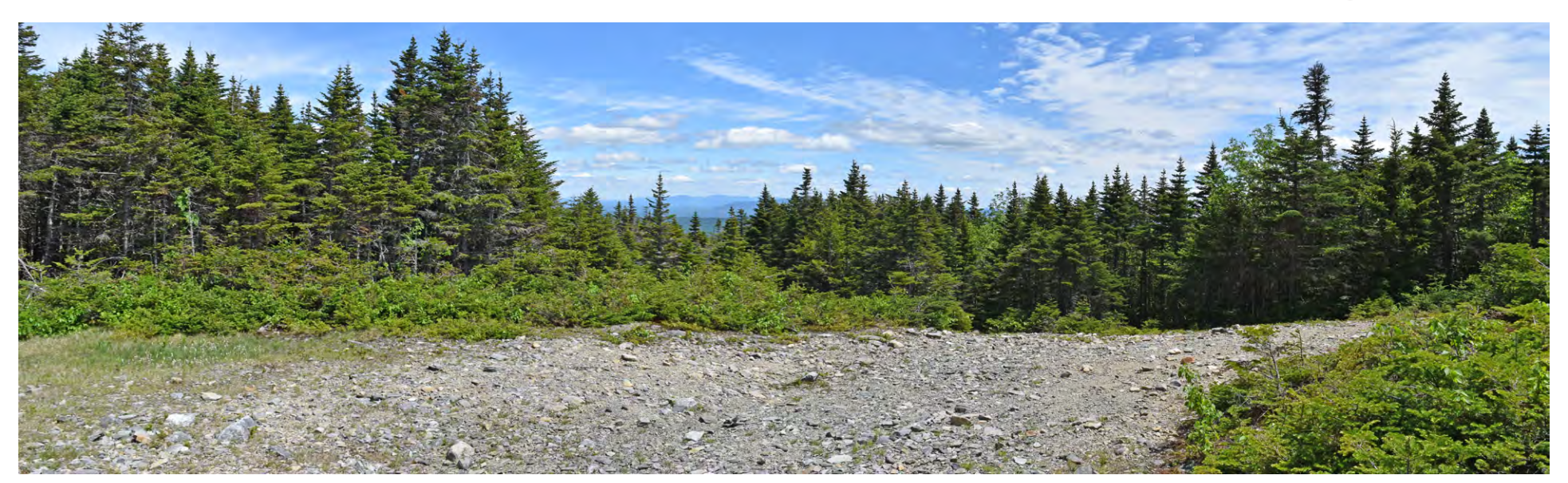
Photograph 7: Panoramic view looking east from a cleared area mid-way up Coburn Mountain. The Project will not be visible in this area due to foreground evergreen vegetation.