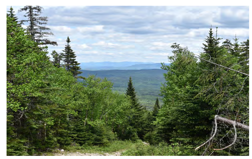
Photograph 9: View looking east along the lower snowmobile trail descending down Coburn Mountain. A glimpse of the Project may be visible through openings in vegetation while descending in this area.