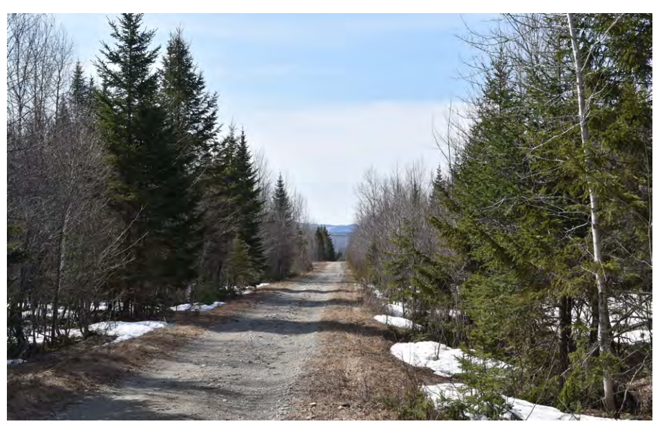
Photograph 24: View looking north on Tower Road / ITS 86 & 87 on Durgin Hill in West Forks Plt. The Project to the east, would not be visible from this viewpoint due to intervening vegetation.