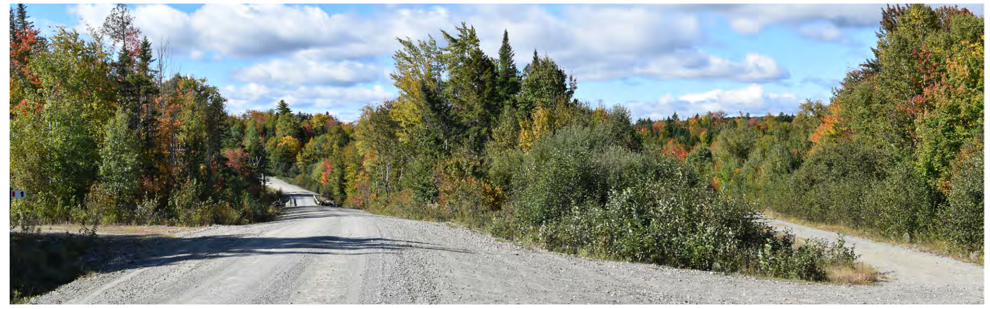
Photograph 16: Panoramic view looking west on Capital Road toward the bridge over Cold Stream. The ITS 87 bridge over Cold Stream is visible 325 feet from this viewpoint. The 150 foot wide proposed HVDC corridor will be visible paralleling the road on the right hand side of the image. Two to three structures will be visible and the closest will be approximately 80 feet from this viewpoint.