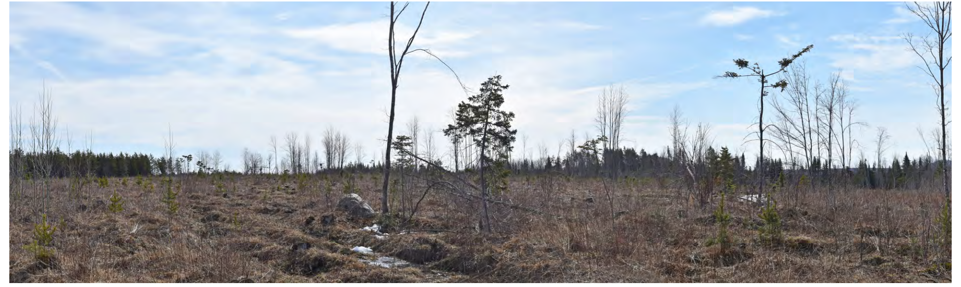
Photograph 26: Panoramic view looking northeast to west in the direction of the Project from a recent harvest area on Durgin Hill, within the Cold Stream Forest Parcel in West Forks Plt. The nearest Project structure would be 1.5 miles from this viewpoint, but would not be visible due to intervening topography and vegetation.