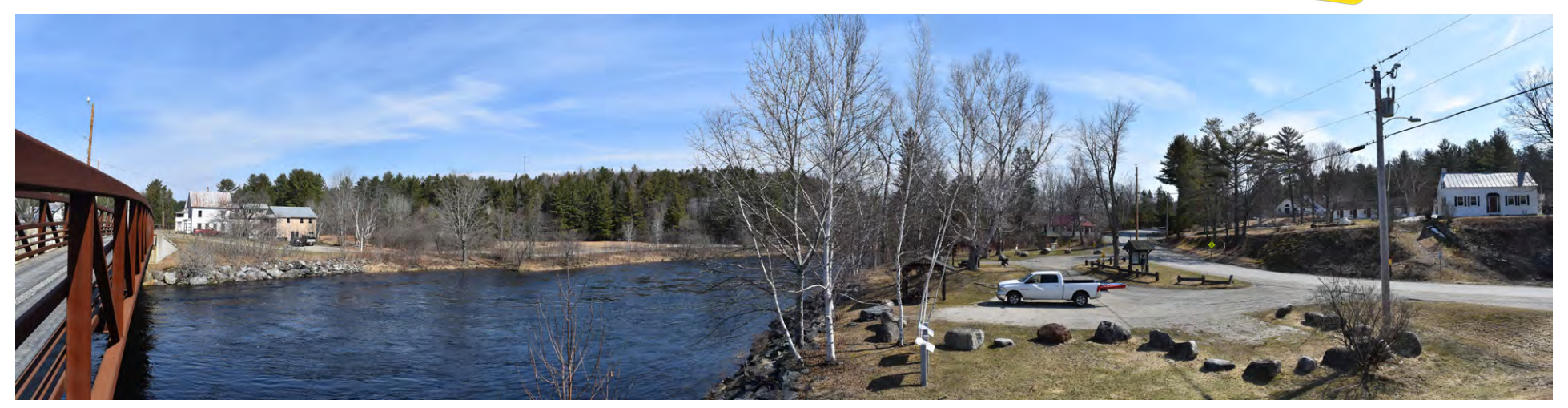
Photograph 22: Panoramic view looking northwest to northeast across the Kennebec River from the snowmobile bridge adjacent to Route 201 in The Forks. The Project would not be visible from this location due to intervening topography and vegetation.