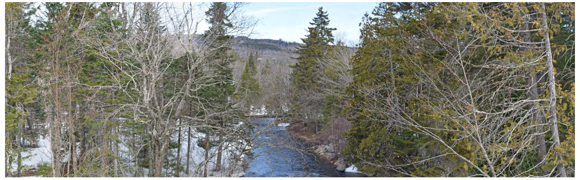
Photograph 18: Panoramic view looking northwest from the bridge over Cold Stream on Capital Road. The ITS 87 bridge over Cold Stream is visible 325 feet from this viewpoint. The 150 foot wide proposed HVDC corridor will be visible crossing perpendicular to Cold Stream. Conductors will be visible crossing the stream from this viewpoint. Non-capable riparian vegetation will be preserved along the stream banks.