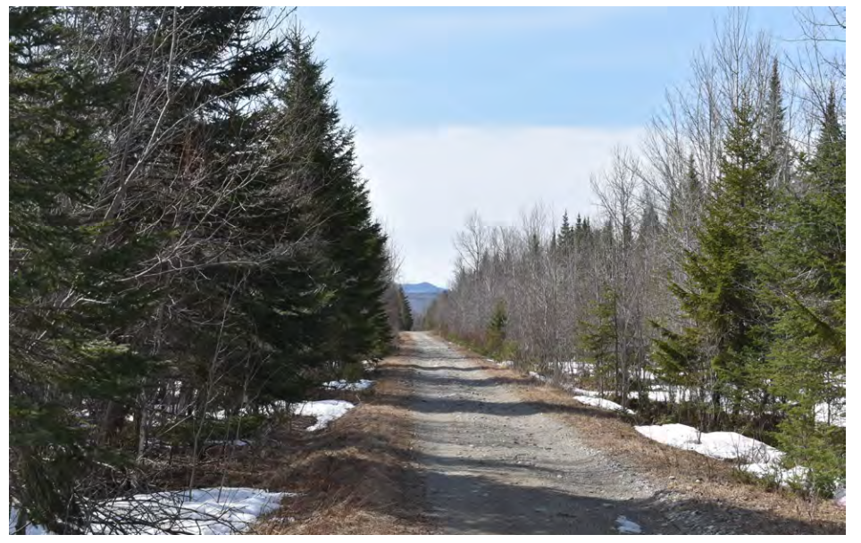
Photograph 25: View looking south on Tower Road / ITS 86 & 87 on Durgin Hill in West Forks Plt. The Project to the east, would not be visible from this viewpoint due to intervening vegetation.