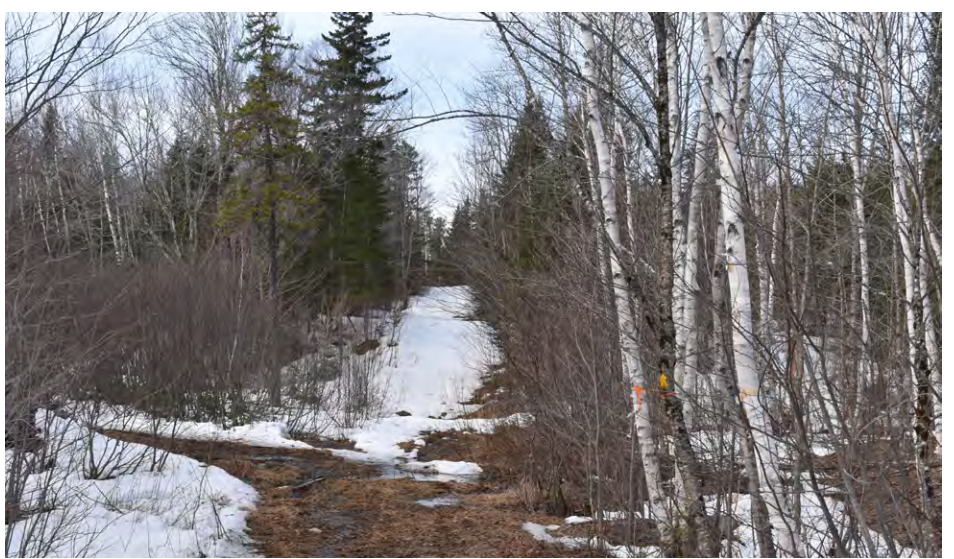
Photograph 21: View looking southwest towards ITS 87 from the bridge over Cold Stream. The trail will enter the 150 foot wide corridor approximately 525 feet from this viewpoint.