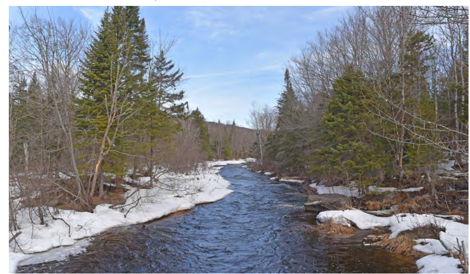
Photograph 20: View looking northwest towards Cold Stream from the ITS 87 bridge. The Project will not be visible in this direction.