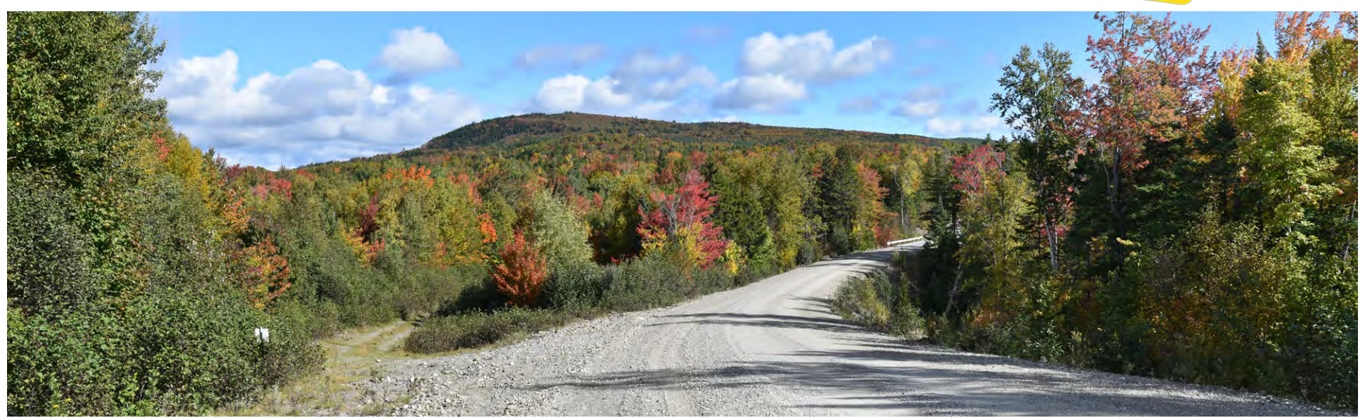
Photograph 15: Panoramic view looking northeast on Capital Road toward the bridge over Cold Stream. The 150 foot wide proposed HVDC corridor will be visible paralleling the road on the left hand side of the image. Two to three structures will be visible and the closest will be approximately 250 feet from this viewpoint.