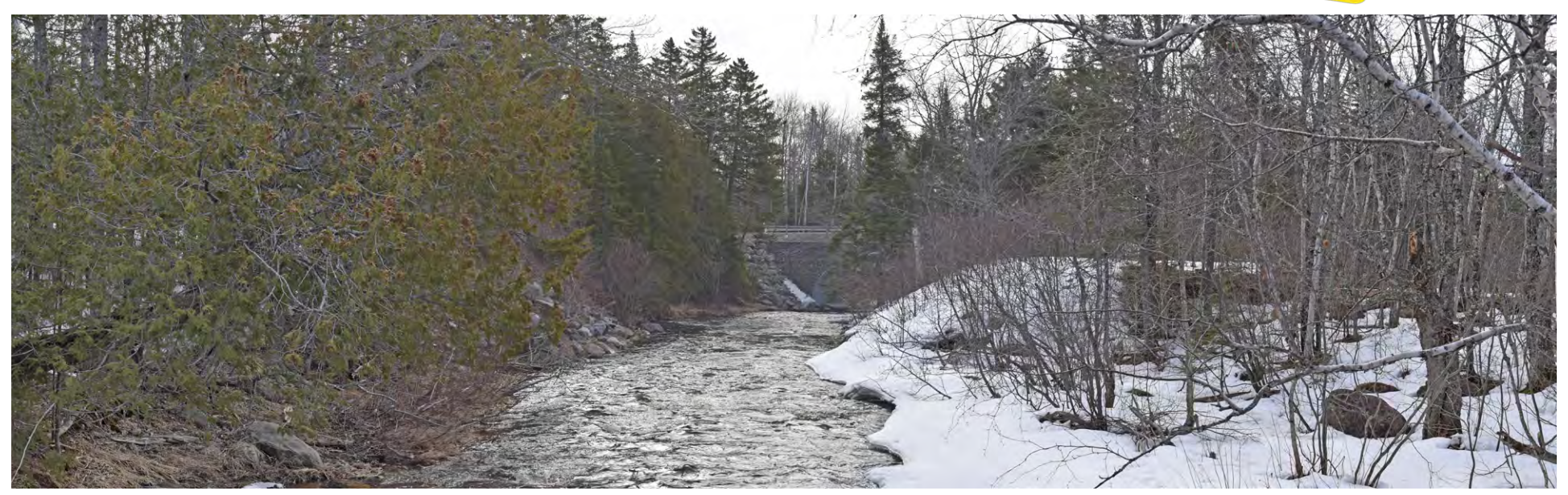
Photograph 19: Panoramic view looking east from the ITS 87 bridge over Cold Stream. The Capital Road bridge over Cold Stream is visible in the distance. The 150 foot wide proposed HVDC corridor will be visible crossing perpendicular to Cold Stream approximately 145 feet to the east. Conductors will be visible crossing the stream from this viewpoint.