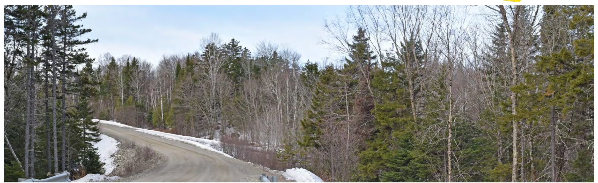
Photograph 17: Panoramic view looking southwest from the bridge over Cold Stream on Capital Road. The 150 foot wide proposed HVDC corridor will be visible paralleling the road on the right hand side of the image. Two structures will be visible and the closest will be approximately 550 feet from this viewpoint.