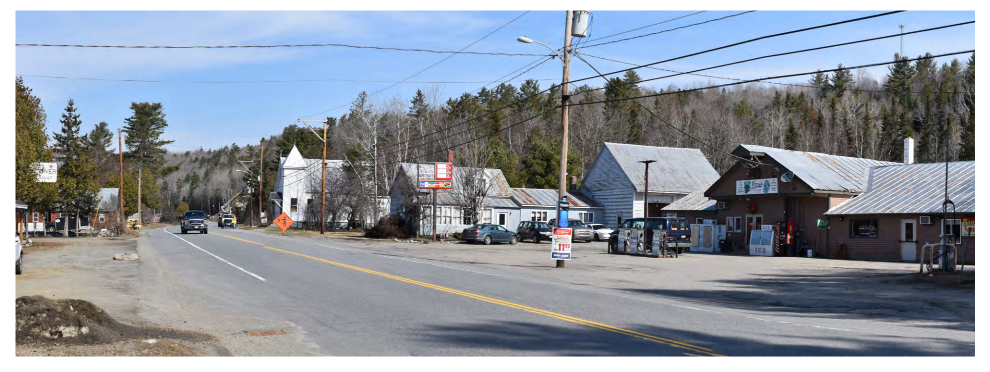
Photograph 23: Panoramic view looking north from Route 201 toward The Forks in West Forks Plt. The Project would not be visible from this location due to intervening topography and vegetation.