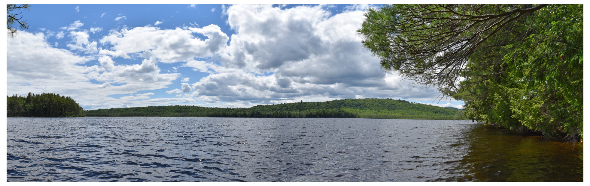
P7-16: Panoramic view looking northwest from North Pond, Chesterville. The Project is 2.5 miles +/- west and will not be visible from this pond.