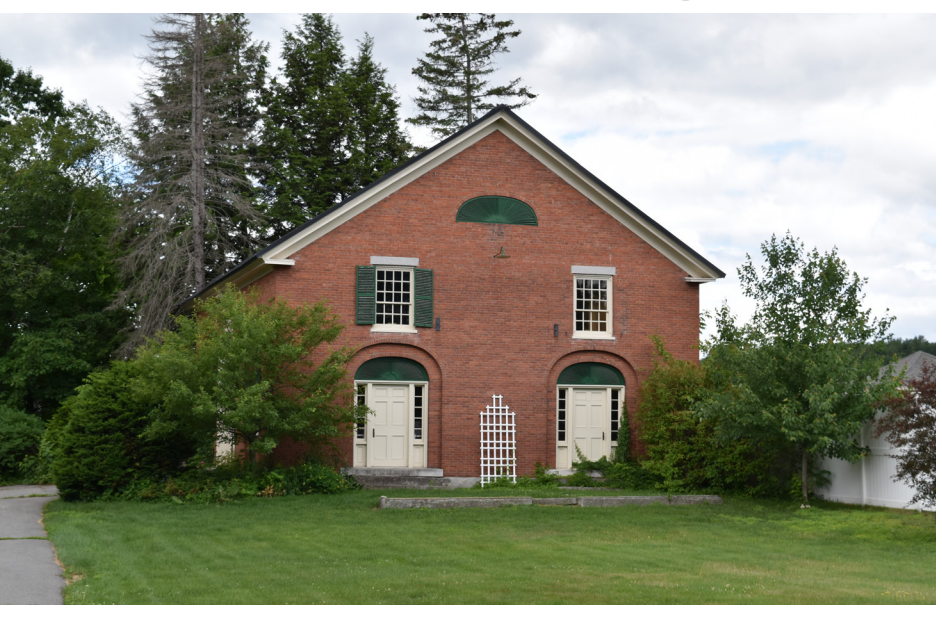
P7-9: National Register of Historic Places: Free Will Baptist Meetinghouse. The Project will not be visible from this structure.