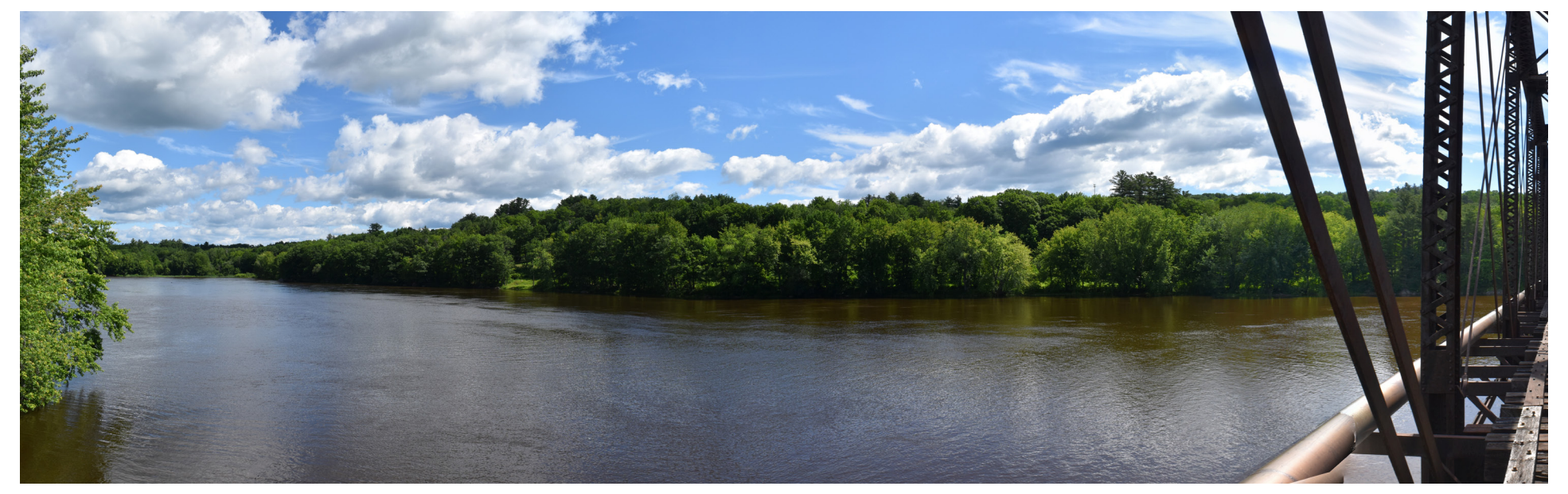
P7-18: Panoramic view looking east from railroad bridge at Spruce Mountain conservation land, Jay. The Project is 1.4 miles +/- east and will not be visible from this location.