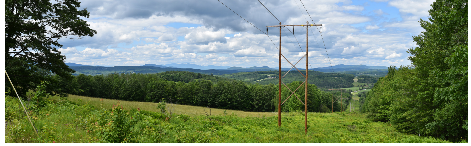
P7-14: Panoramic view looking northeast down the existing 115 kV transmission corridor from the Soules Hill Road Crossing in Jay. The existing 150' wide transmission line corridor will be widened by 75' on the west side to accommodate the proposed HVDC transmission line.