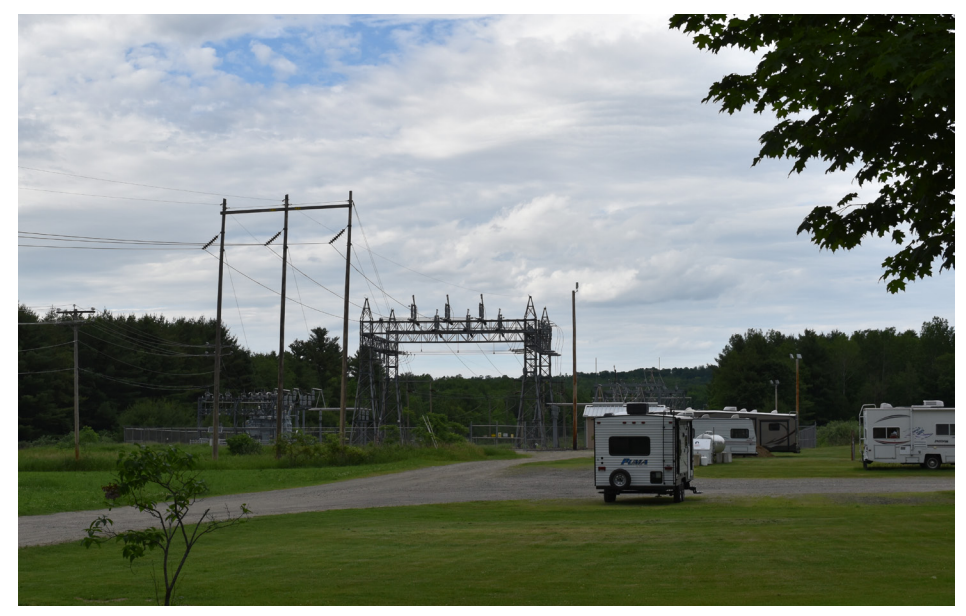
P7-12: View looking north at Sturtevant Substation near the Route 2 crossing in Farmington. See Photosimulation in Appendix D for view in opposite direction.