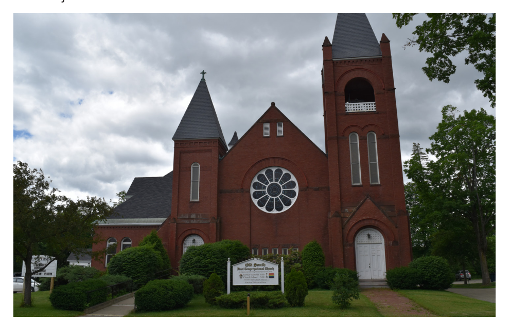
P7-10: National Register of Historic Places: First Congregational Church. The Project will not be visible from this structure.