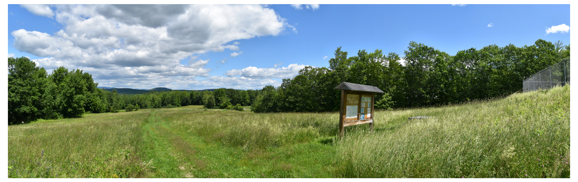
P7-21: Panoramic view looking north from the entry to the Jay Recreation Area. The Project is 0.75 mile +/- east and will not be visible from this area.