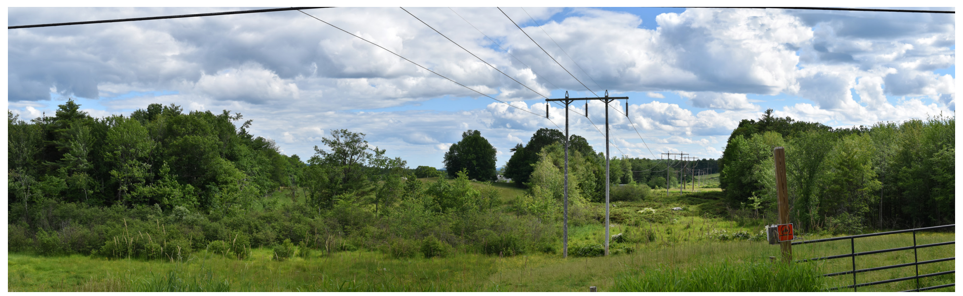
P7-17: Panoramic view looking north toward the existing 115 kV transmission corridor from the East Jay Road Crossing in Jay. The existing 150' wide transmission line corridor will be widened by 75' on the west side to accommodate the proposed HVDC transmission line.