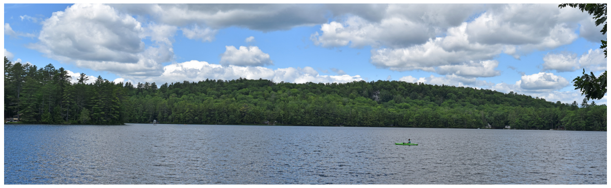
P7-15: Panoramic view looking northwest from Sand Pond, Chesterville. The Project is 2.0 miles +/- to the northwest and will not be visible from this pond.