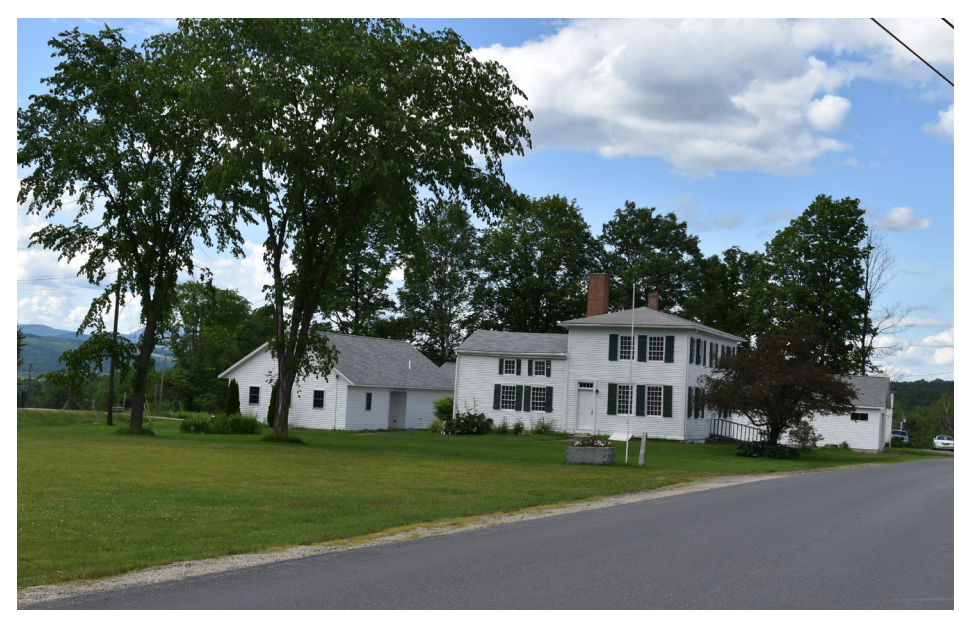
P7-19: National Register of Historic Places: Holmes-Crafts Homestead, Jay. The Project will not be visible from this structure.