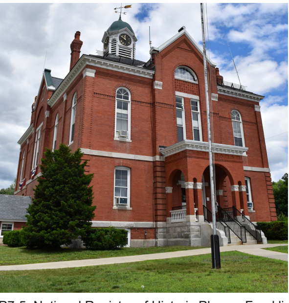
P7-5: National Register of Historic Places: Franklin County Courthouse. The Project will not be visible from this structure.