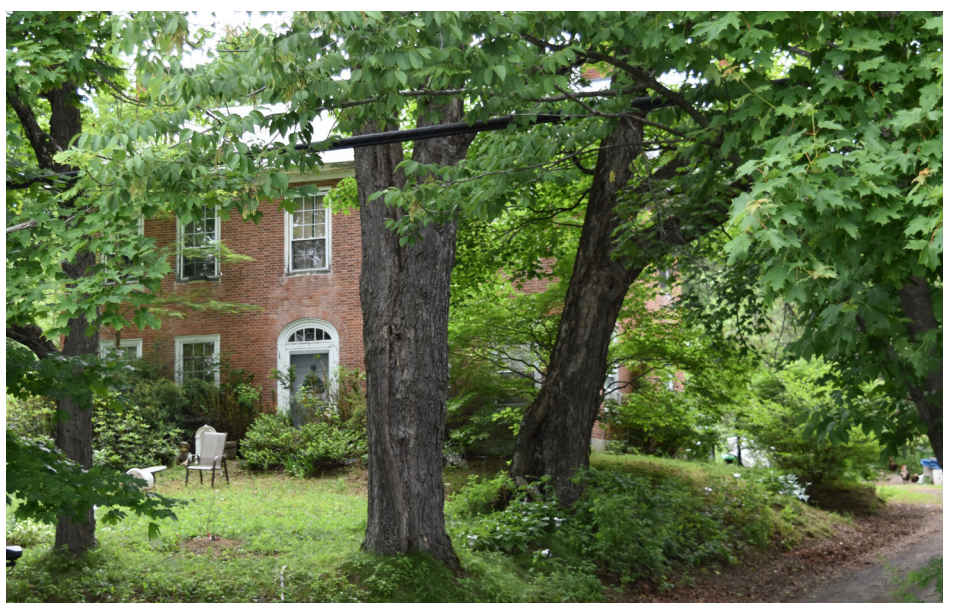
P7-13: National Register of Historic Places: Tufts House. The Project will not be visible from this structure.