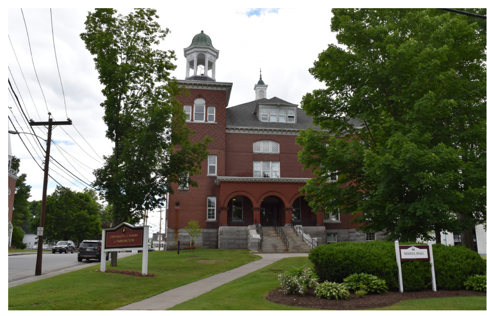
P7-8: National Register of Historic Places: Merrill Hall, Farmington. The Project will not be visible from this structure.