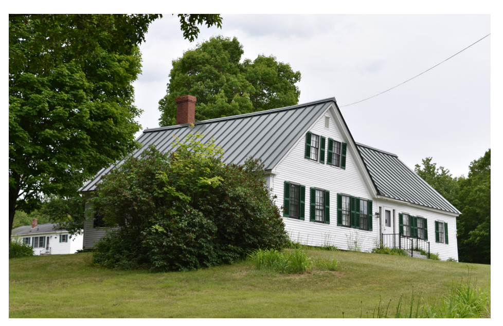
P7-2/3: National Register of Historic Places: Nordica Homestead Museum, Farmington. The Project will not be visible from this structure.