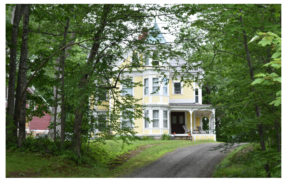
P7-11: National Register of Historic Places: Chester Greenwood House. The Project will not be visible from this structure.