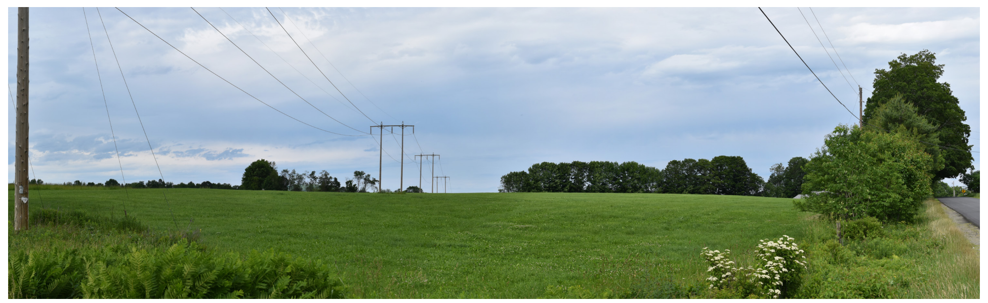
P7-1: Panoramic view looking northeast down existing 115 kV transmission corridor at the Perham Hill Road crossing, New Sharon. The proposed HVDC transmission line will be located on the west side of the existing transmission line.