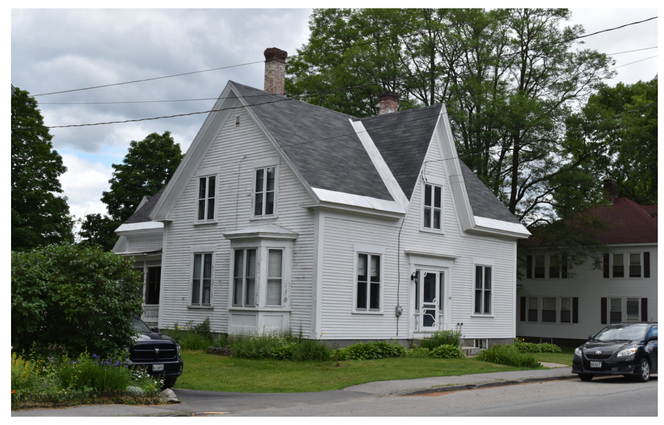
P7-6: Structure within the Farmington Historic District which is on the National Register of Historic Places. The Project will not be visible from this structure.