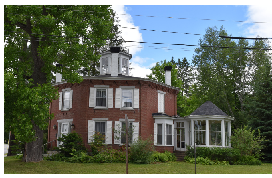
P7-4: National Register of Historic Places: Ramsdell House, Farmington. The Project will not be visible from this structure.