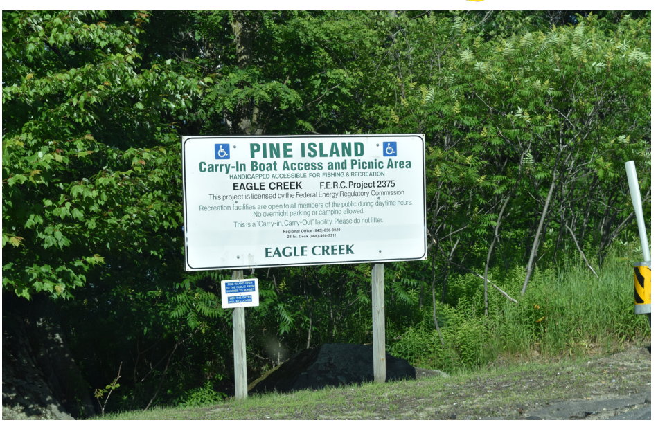
P7-20: Pine Island boat access and picnic area. The Project will not be visible from this area.