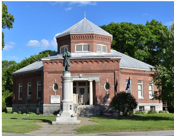
P6-3: National Register of Historic Places: Madison Public Library. The Project will not be visible from this structure.