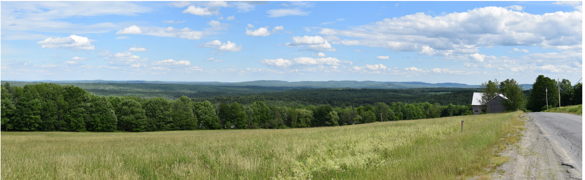
P6-15: Panoramic view looking southeast from Mosher Hill Road adjacent to the University of Maine Farmington Observatory. The project is 2.1 miles +/- to the southeast. Portions of corridor clearing may be visible but not distinct as seen from this location.