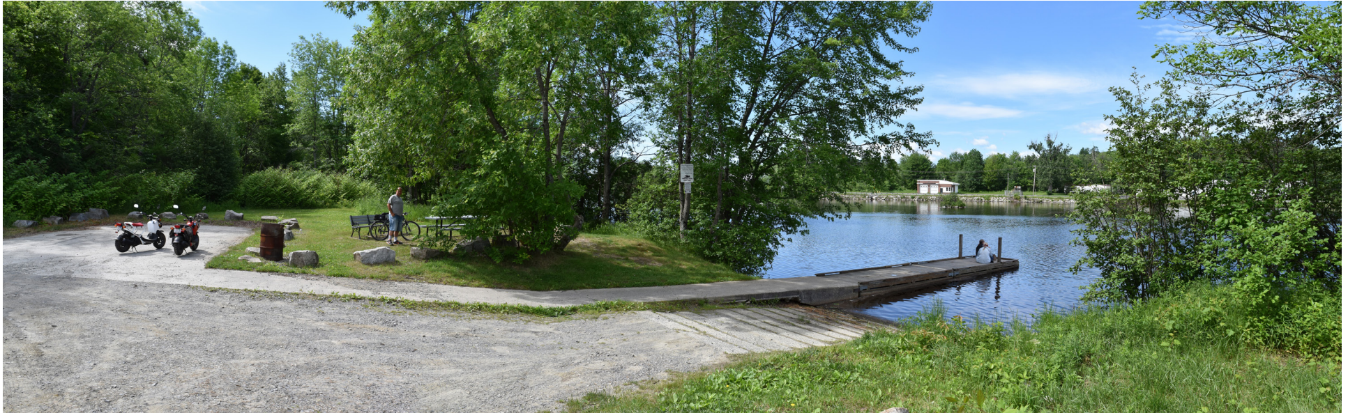
P6-5: Panoramic view from the Madison public boat landing looking southwest. The Project will not be visible from this location.