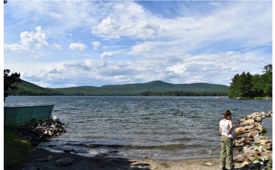
P6-14: View looking north from the boat launch on Clearwater Pond.