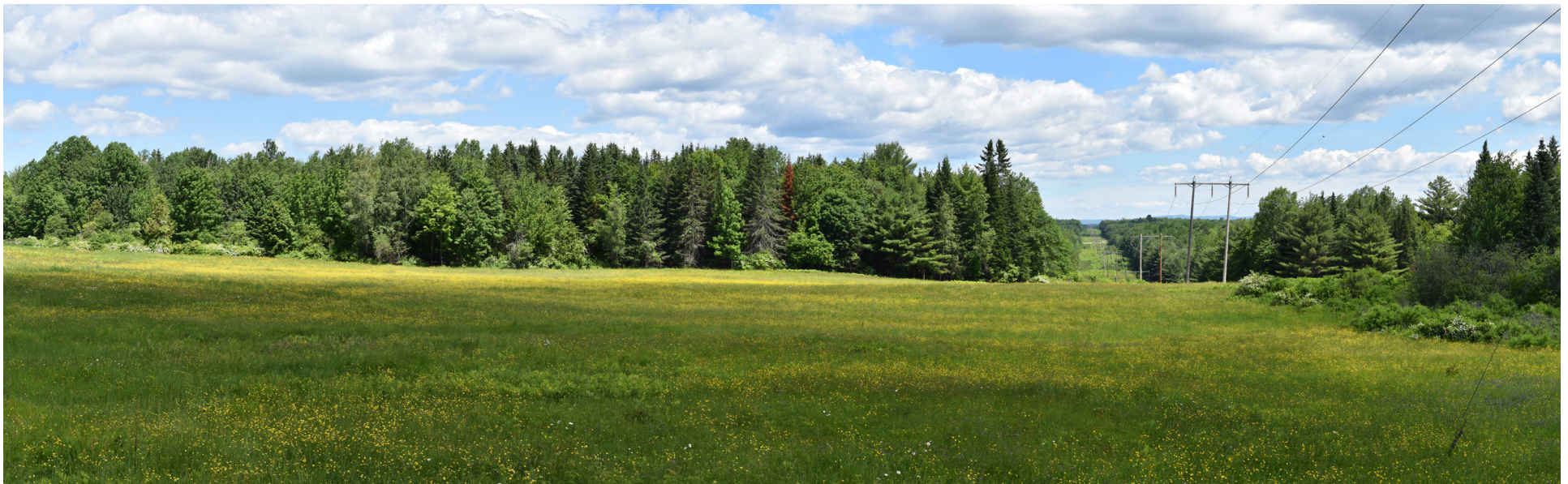
P6-6: Panoramic view looking north up the existing 115 kV transmission corridor at the Bookerville Road crossing. The existing 115 kV transmission line corridor will be widened on the west side by 75' to accommodate the proposed HVDC transmission line.