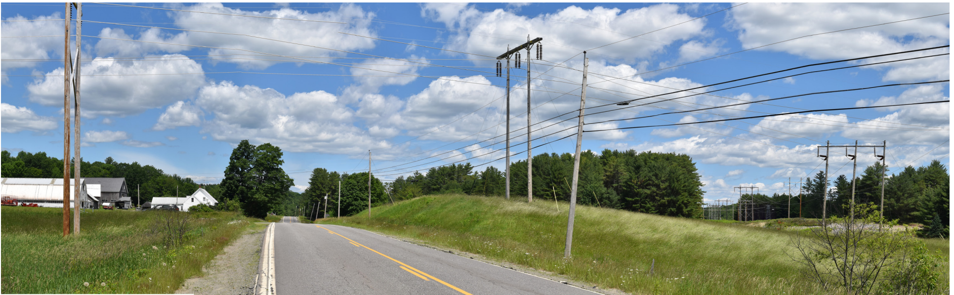
P6-9: Panoramic view looking north from Route 43 towards the existing 115 kV transmission line crossing in Starks. The existing 115 kV transmission line corridor will be widened on the west side by 75' to accommodate the proposed HVDC transmission line.