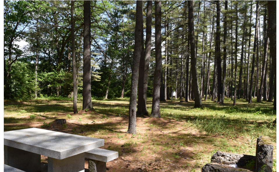
P6-8: National Register of Historic Places: Old Point and Sebastian Rasle Monument, Madison. The Project will not be visible from this structure.