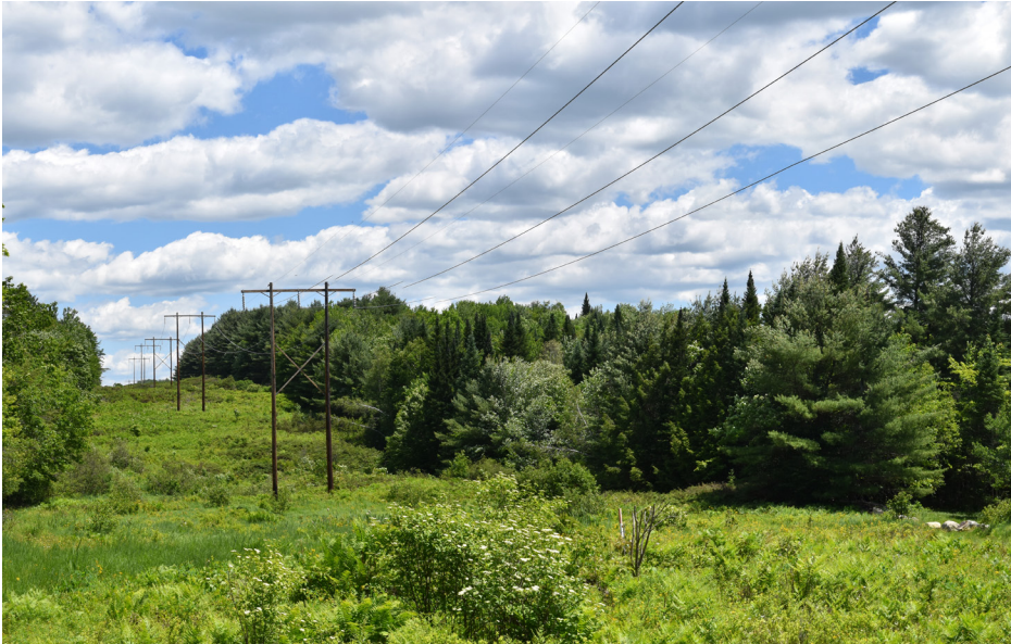
P6-10: Looking northeast up the existing transmission corridor at the Mayhew Road crossing, Stark. The ex.115 kV transmission line corridor will be widened on the west side by 75' to accommodate the proposed HVDC transmission line.