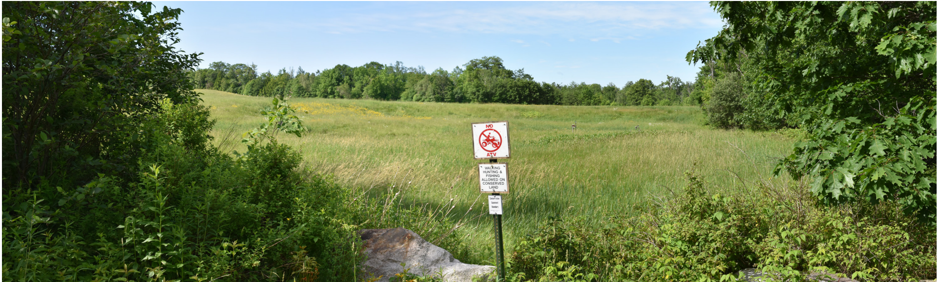
P6-1: Panoramic view looking southwest at entry to Madison Conservation Easement, BPL. This land abuts the Kennebec River. The Project will not be visible from this location.