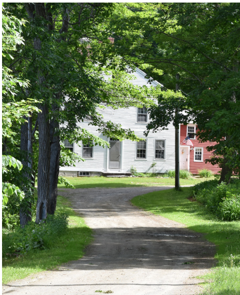
P6-2: National Register of Historic Places: Weston Homestead. The Project will not be visible from this structure.