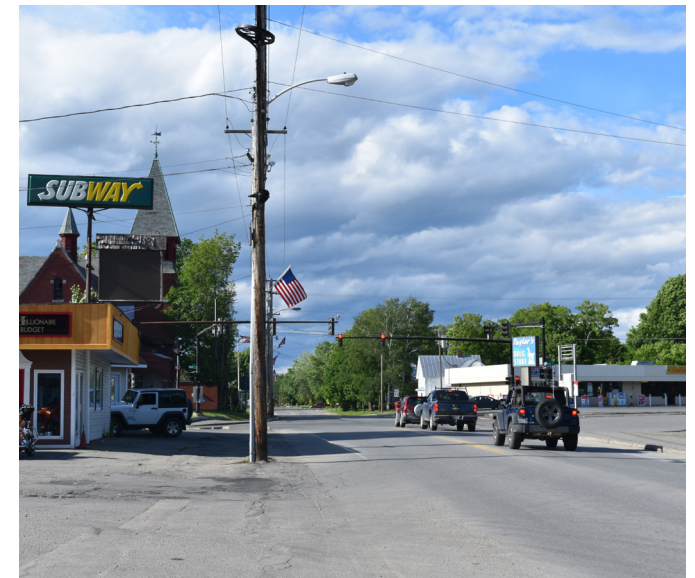
P6-4: Main Street Madison. The Project will not be visible from the village.