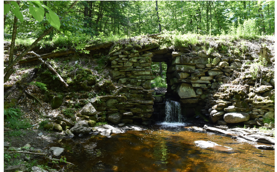
P6-11: National Register of Historic Places: Thompson's Bridge, Industry. The Project will not be visible from this structure.