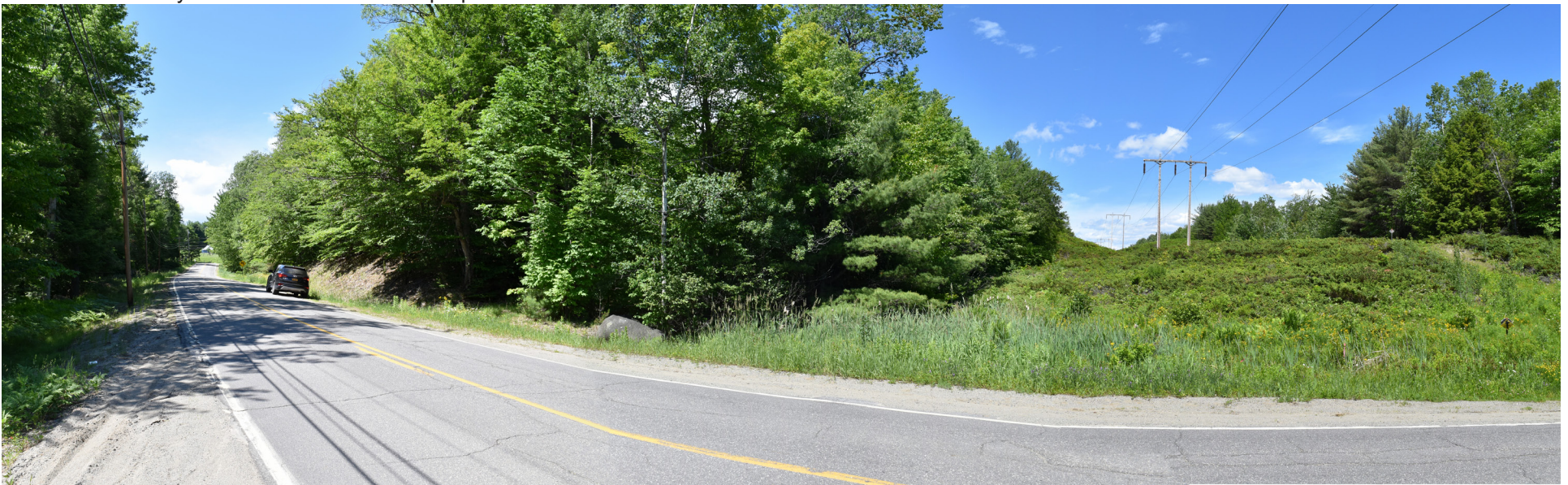
P6-12: Panoramic view looking northeast from Route 43 in Industry towards the existing 115 kV transmission corridor. The existing 115 kV transmission line corridor will be widened on the west side by 75' to accommodate the proposed HVDC transmission line.