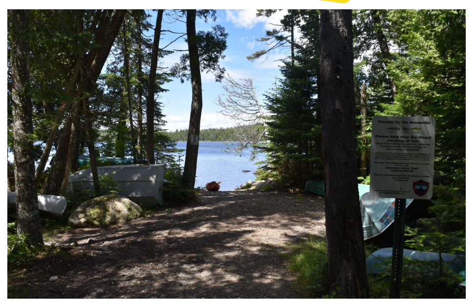
P2-21: Canoe launch site at Grace Pond, Upper Enchanted Twp.