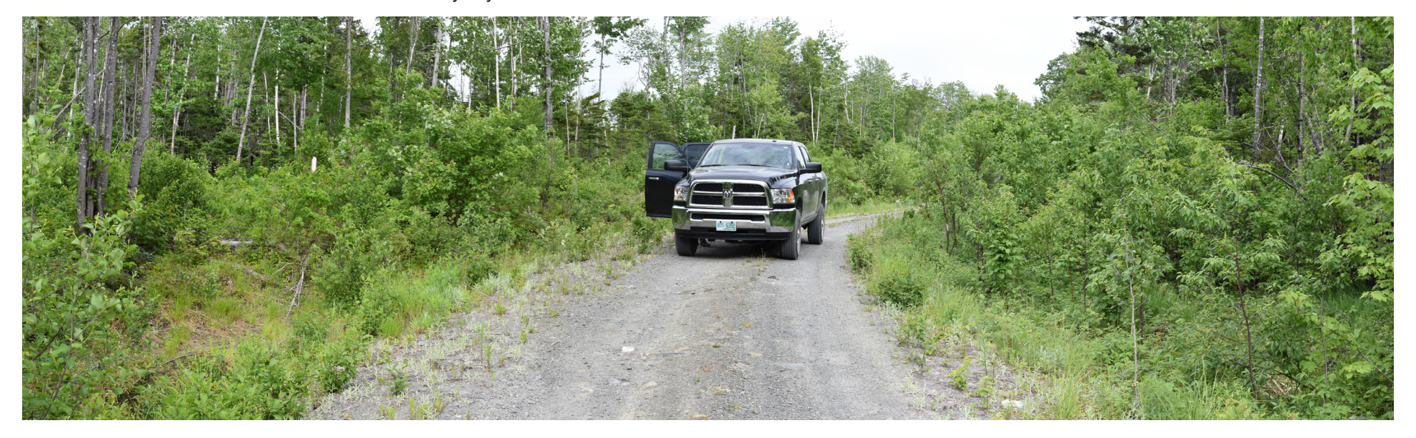
P2-38: Looking south on Mountain Brook Road near the proposed HVDC transmission line crossing in Johnson Mountain Twp.