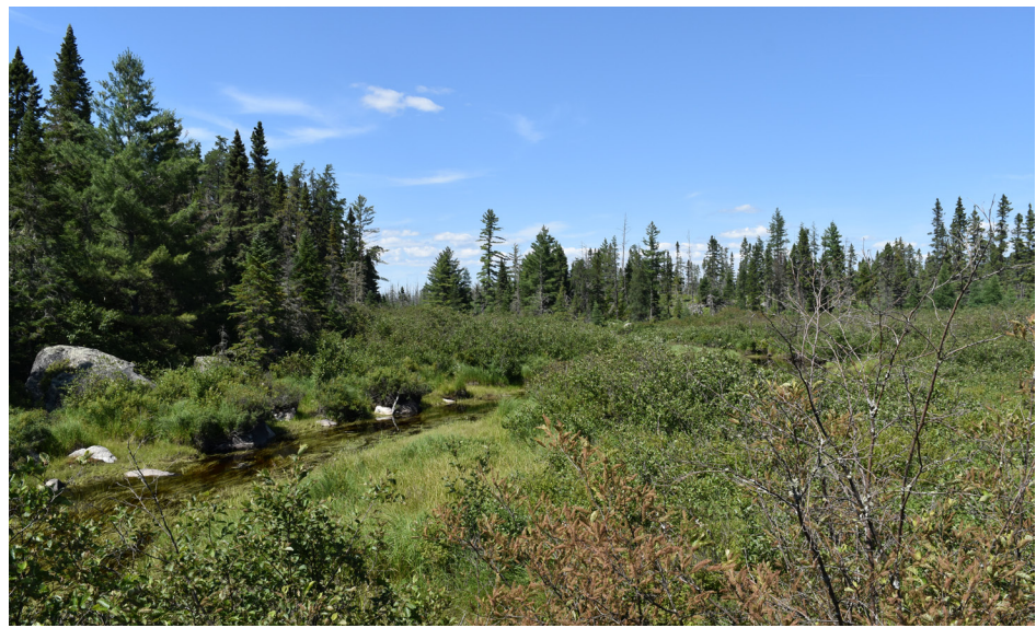
P2-17: Bitter Brook boat access site looking north toward Moose River, Bradstreet Twp. The Project, located 1,600' south of this viewpoint, will not be visible. The Project will be screened by shrubby vegetation immediately adjacent to the brook.