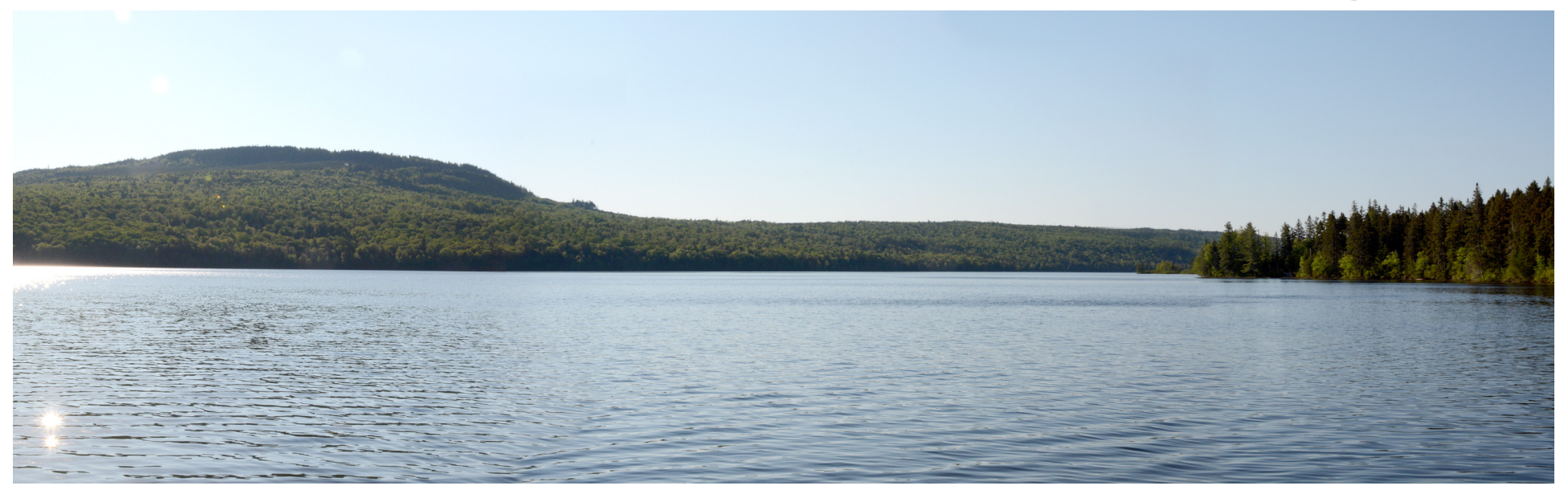
P2-28: Panoramic view from the western side of Parlin Pond looking from east to south, Parlin Pond Twp. The proposed HVDC transmission line will not be visible from the west side of the pond. See Photosimulation in Appendix D for a view from the northwest end of Parlin Pond where the Project will be visible.