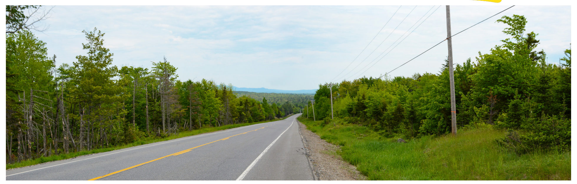
P2-37: Panoramic view looking south from Route 201 near Judd Road intersection. Johnson Mountain Twp. See Photosimulation in Appendix D. Route 201 in this location is the Old Canada Road National Scenic Byway.