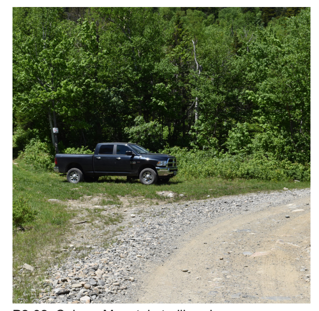
P2-32: Coburn Mountain trailhead.