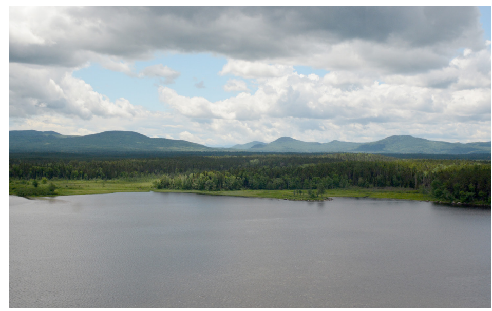
P2-10: Aerial view from the southern end of Attean Pond looking south. The Project (3.7 miles at the closest point) will not be visible from the pond due to shoreline vegetation and distance. Attean Pond is a designated scenic resource with an 'Outstanding' rating in the <u>Maine Wildlands Lake Assessment</u>.