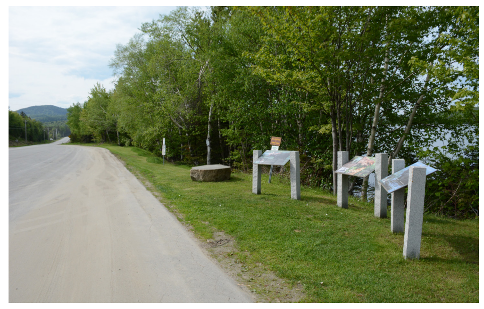
P2-29: Parlin Pond scenic pull-off on Route 201. The Project will not be visible from this viewpoint.