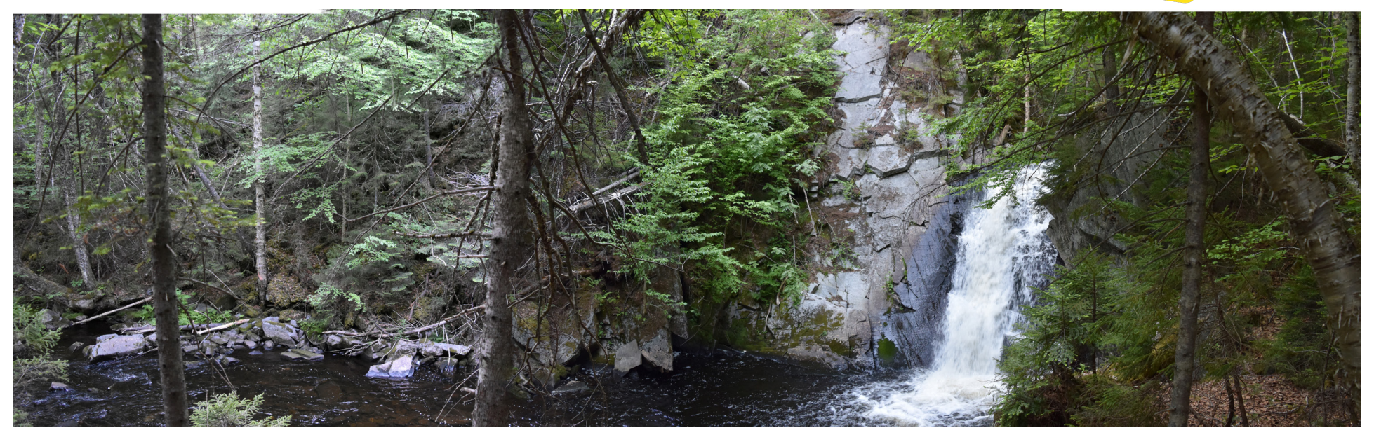
P2-39: Cold Spring Falls located within the Cold Stream Forest owned by Maine Bureau of Parks and Lands in Johnson Mountain Twp. The Project will not be visible from this viewpoint.