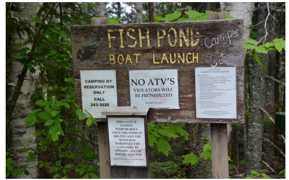
P2-8: Fish Pond Boat Launch.