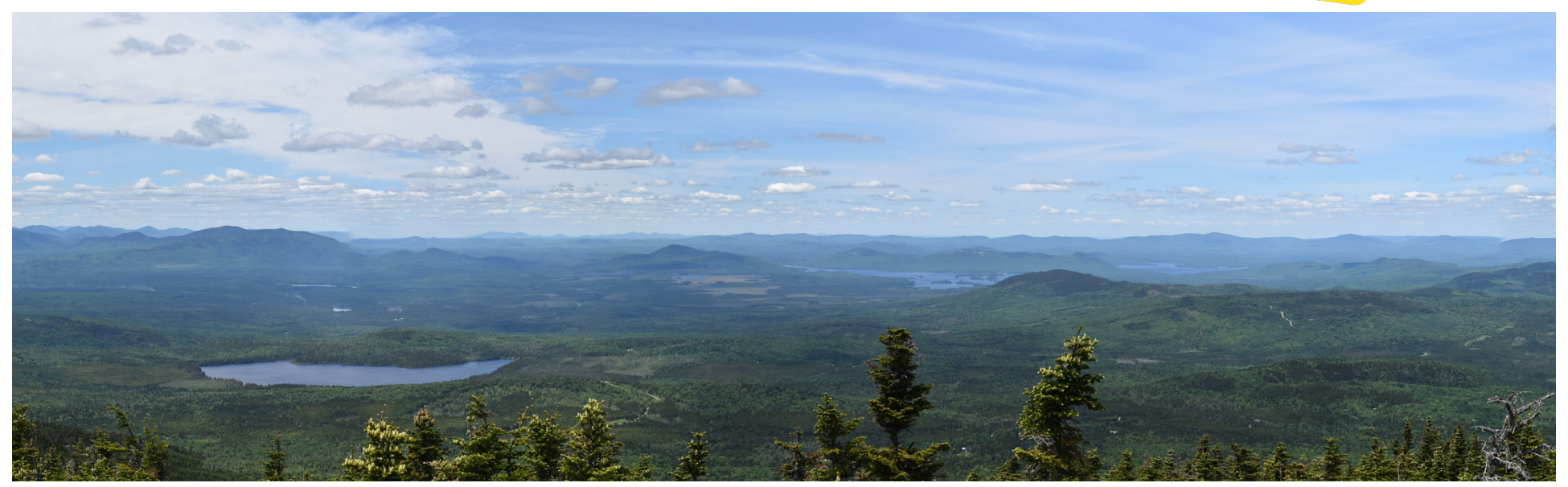
P2-31: Panoramic view from the fire tower on Coburn Mountain looking northwest in Upper Enchanted Twp. The proposed HVDC line will be visible looking to the north, east, and south from the summit of Coburn Mountain. See Photosimulation in Appendix D. Grace Pond is visible on left in image.