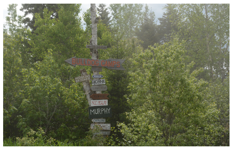
P2-20: On access road to Grace Pond, Upper Enchanted Twp. There are approximately 10 camps on Grace Pond.