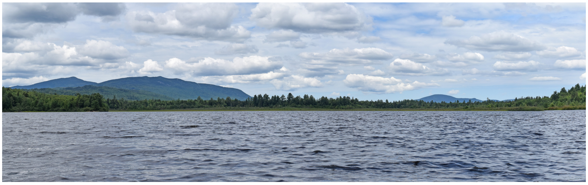
P2-7: Panoramic view from Fish Pond looking northwest, Hobbstown Twp. Fish Pond is a designated scenic resource with a 'Significant' rating in the Maine wildlands Lake Assessment. Tips of two structures and conductors will be visible at a distances of 3.1 to 3.8 miles from this viewpoint. See Photosimulation in Appendix D.