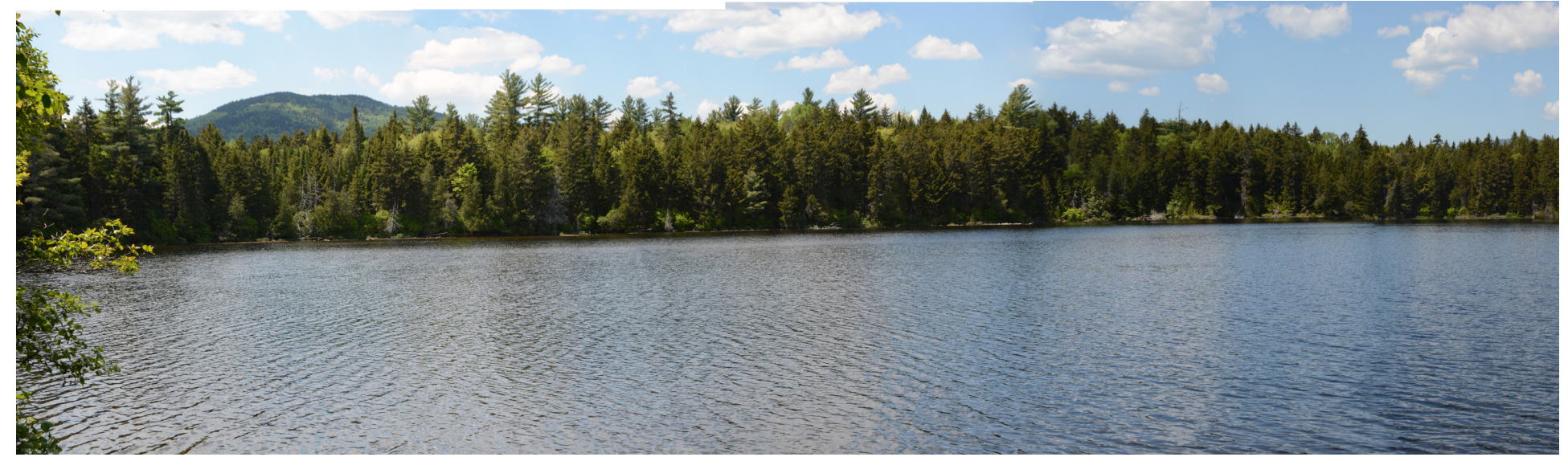
P2-6: Panoramic view from Chubb Pond looking north, HobbstownTwp. The Project, located 1.3 miles to the north, will not be visible from this pond due to intervening topography and vegetation.