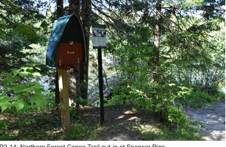
P2-14: Northern Forest Canoe Trail put-in at Spencer Rips.