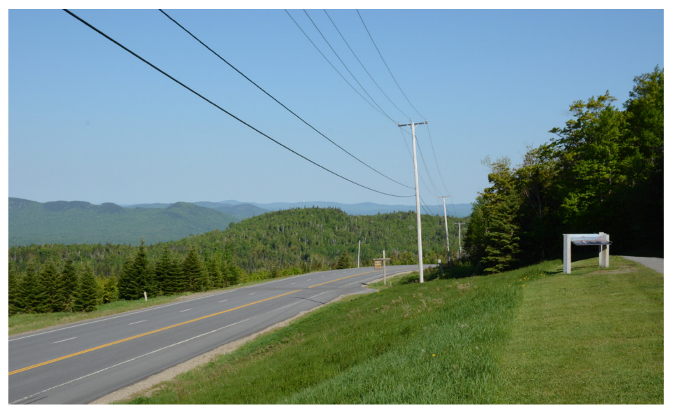
P2-25: View looking northwest from Attean View Rest Area on Route 201 in Jackman. Route 201 in this area is the Old Canada Rd. National Scenic Byway.