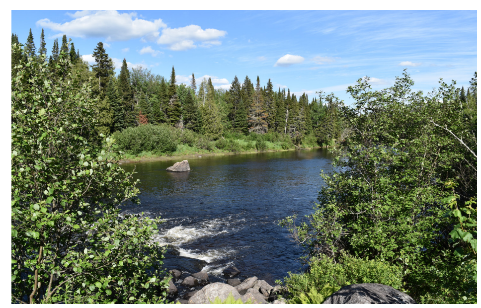
P2-15: Spencer Rips on the Moose River looking east. The project will not be visible from this location.