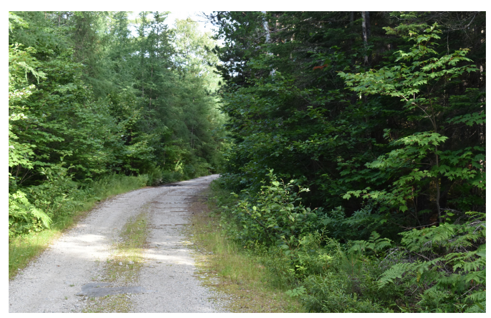
P2-4: Site of proposed HVDC transmission line crossing of Spencer Rips Road, T5 R7 BKP WKR. The closest structure will be 650' +/- to the east of road.