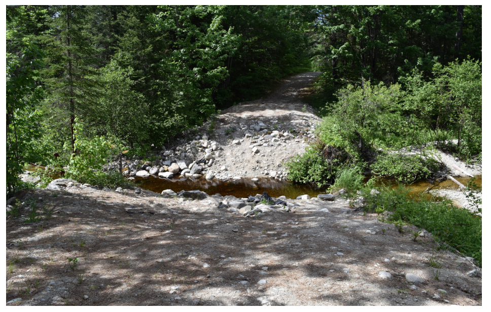
P2-5: The Spencer Rips Road is currently not accessible to vehicles from Spencer Road because the bridge was removed. Repairs proposed Sept. 2017.