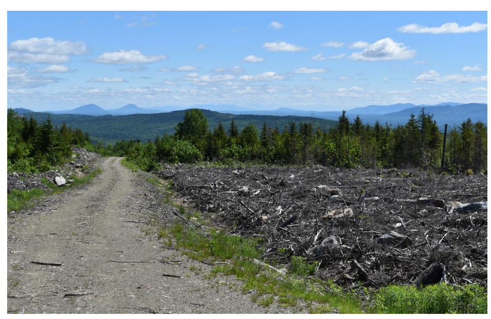
P2-34: Recent commercial timber harvesting at base of Johnson Mountain.