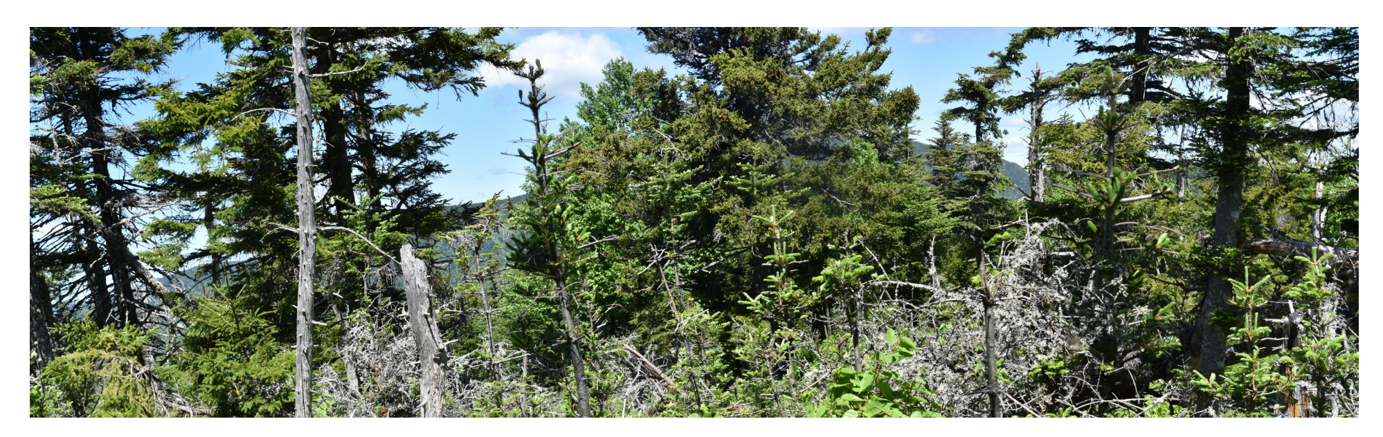
P2-36: Panoramic view from summit of Johnson Mountain (looking west) in Johnson Mountain Twp. No hiking, snowmobiling, or ATV trails were found .