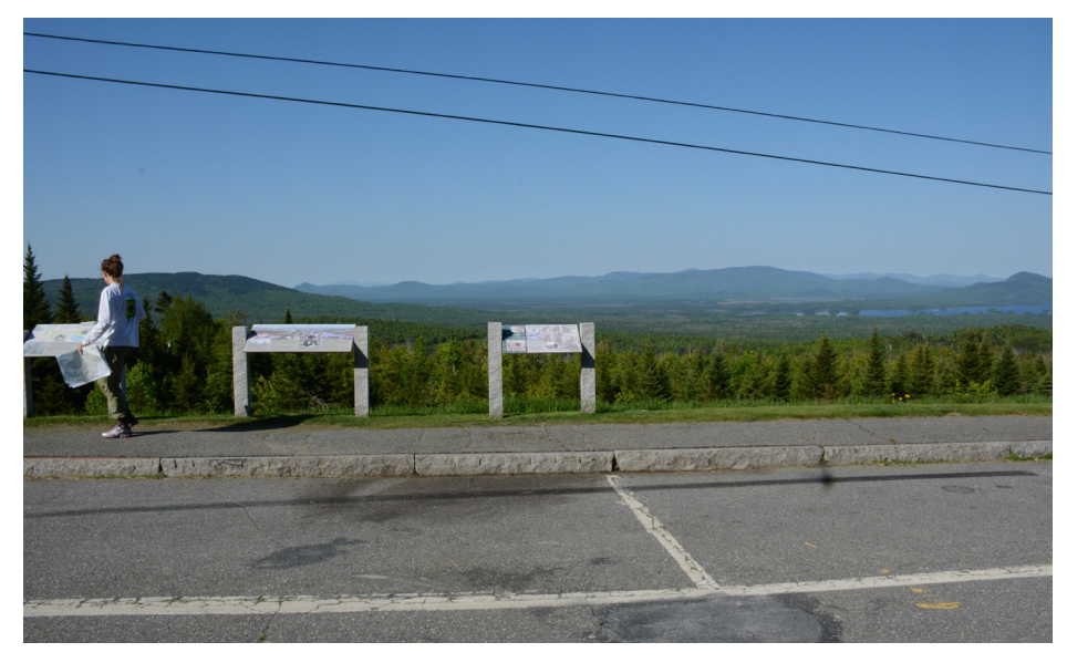
P2-24: Interpretive panels at Attean View Rest Area in Jackman