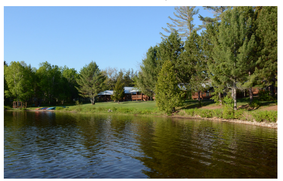
P2-30: Parlin Pond Camps on northwest side of Parlin Pond.