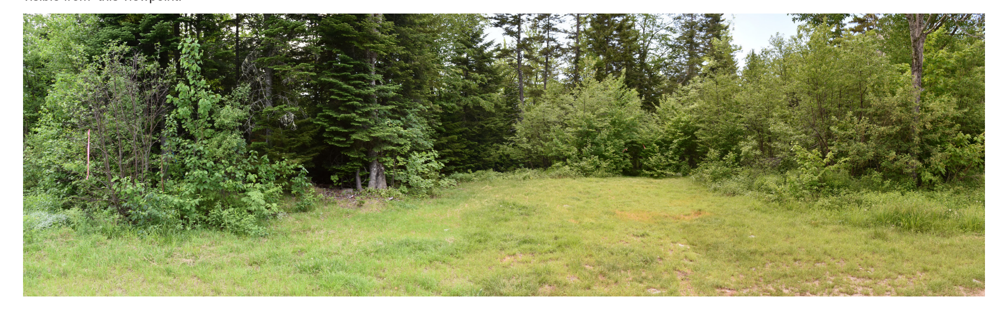
P2-40: Entry to Cold Spring Trail near the intersection of Mountain Brook Road in Johnson Mountain Twp.