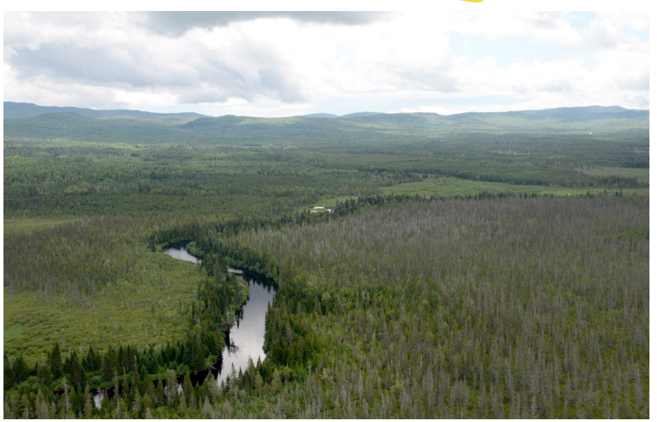
P2-18: Aerial view looking south over Moose River, Bradstreet Twp. The vegetation along the banks of the river will screen the Project from view.