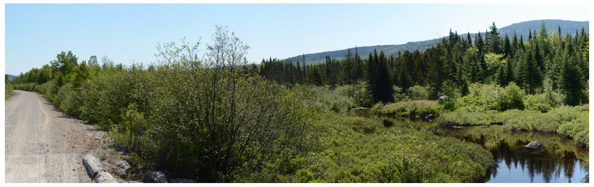
P2-26: Panoramic view on Spencer Bale Road from bridge over Piet Brook bridge looking east, Parlin Pond Twp. The proposed HVDC transmission line crossing of Piet Brook will be approximately 1000 ft. to the east of this bridge crossing.