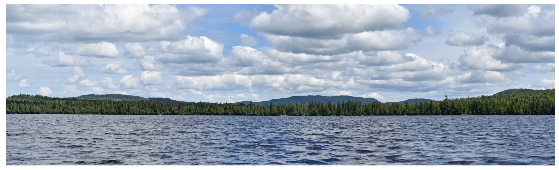
P2-22: Panoramic view from Grace Pond looking north, Upper Enchanted Twp. The Project will not be visible from Grace Pond due to intervening vegetation.