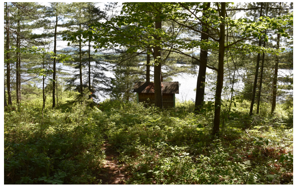
P2-2: A shack in the woods on the northern end of Whipple Pond in T5 R7 BKP WKR.