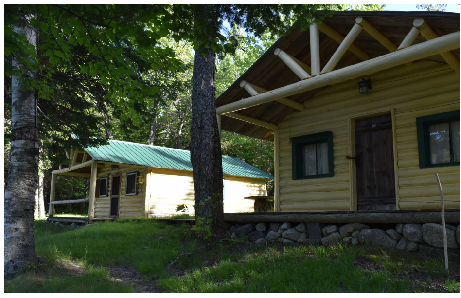
P2-13: Cabins at Spencer Rips on the Moose River.