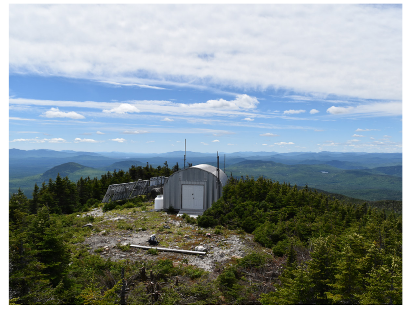
P2-33B: Building on Coburn Mountain.