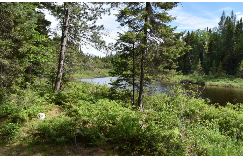
P2-3: Public campsite on Spencer Rips Road in T5 R7 BKP WKR.