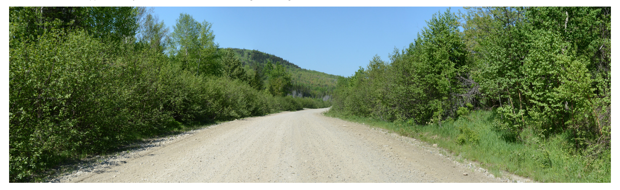
P2-27: Panoramic view at Hardscrabble Road looking west towards the proposed crossing of the HVDC transmission line, Parlin Pond Twp.