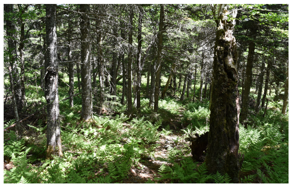
P2-35: Wooded area near summit of Johnson Mountain.