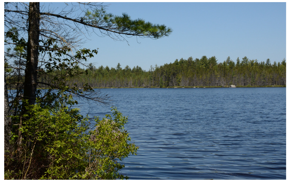
P2-9: View from boat put-in on Moore Pond looking north, Bradstreet Twp. The Project will not be visible from this location due to intervening vegetation.