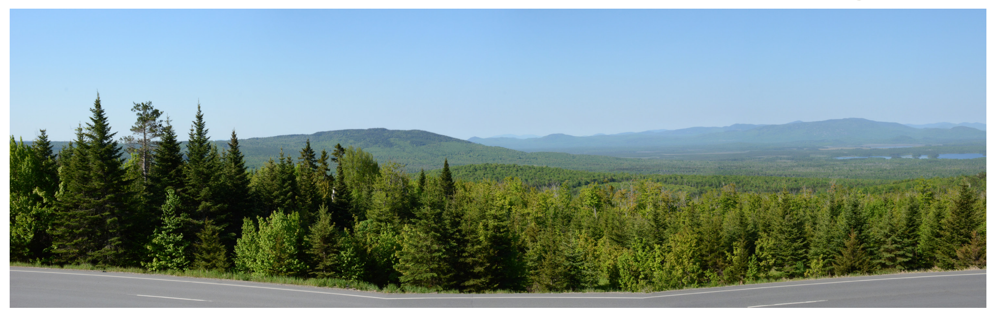
P2-23: Panoramic view looking southwest from the Attean View Rest Area on Route 201 in Jackman. Portions of the proposed HVDC transmission line corridor may be visible between 7 - 11 miles away. See Photosimulation in Appendix D.