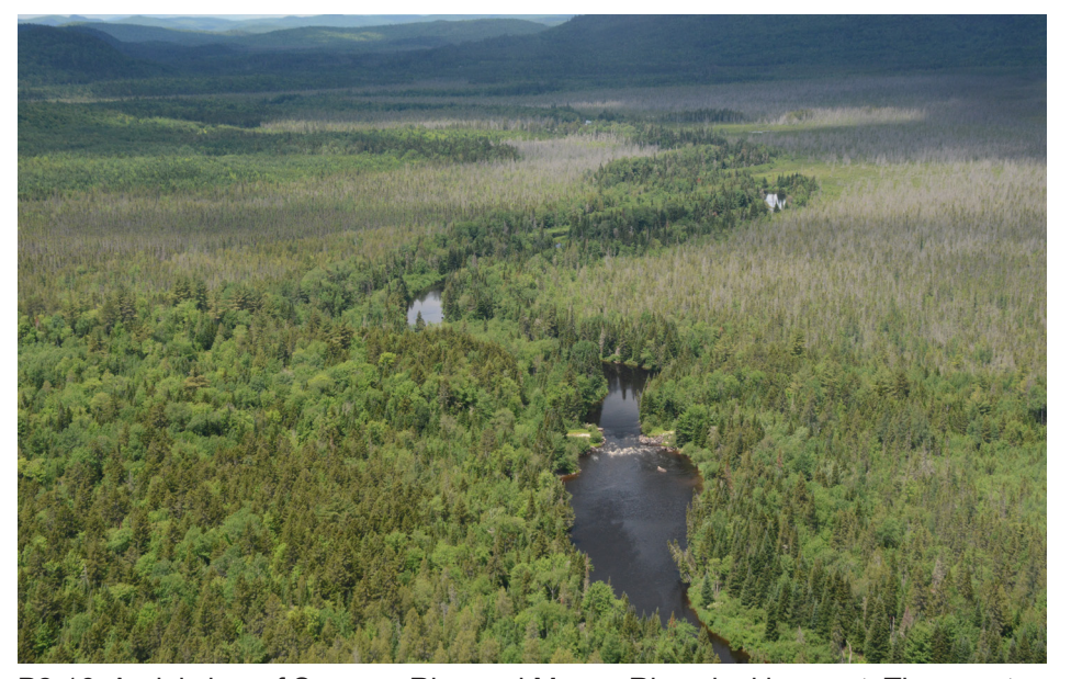
P2-16: Aerial view of Spencer Rips and Moose River, looking east. The vegetation along the banks of the river will screen the Project from view.