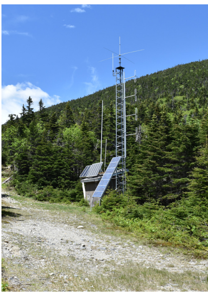
P2-33: Halfway point up Coburn Mountain on trail.