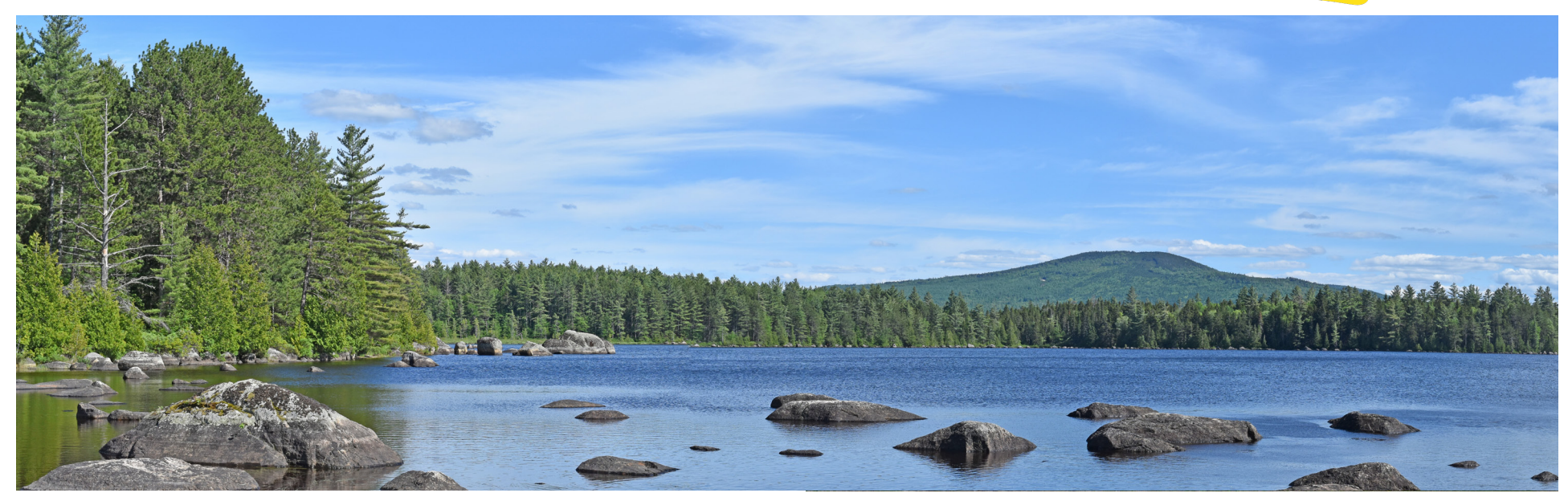
P2-1: Panoramic view from Whipple Pond looking south, in T5 R7 BKP WKR. Whipple Pond is a designated scenic resource with a 'Significant' rating in the <u>Maine Wildlands Lake Assessment</u>. The Project will not be visible from Whipple Pond due to intervening topography and shoreline vegetation.