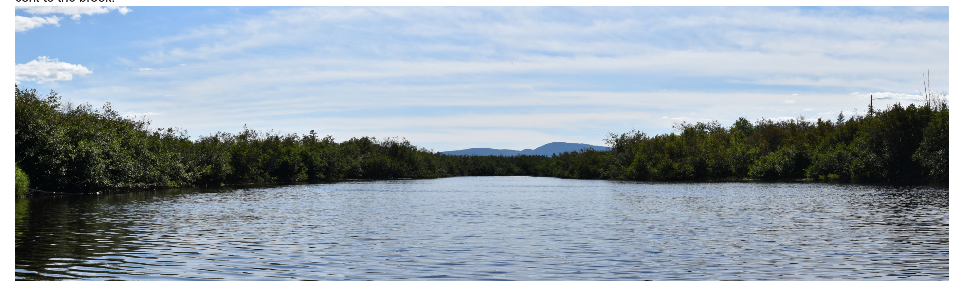
P2-19: Panoramic view from the Moose River looking south. The vegetation along the banks of the river will screen the Project from view. No. 5 Mountain can be seen in the background.