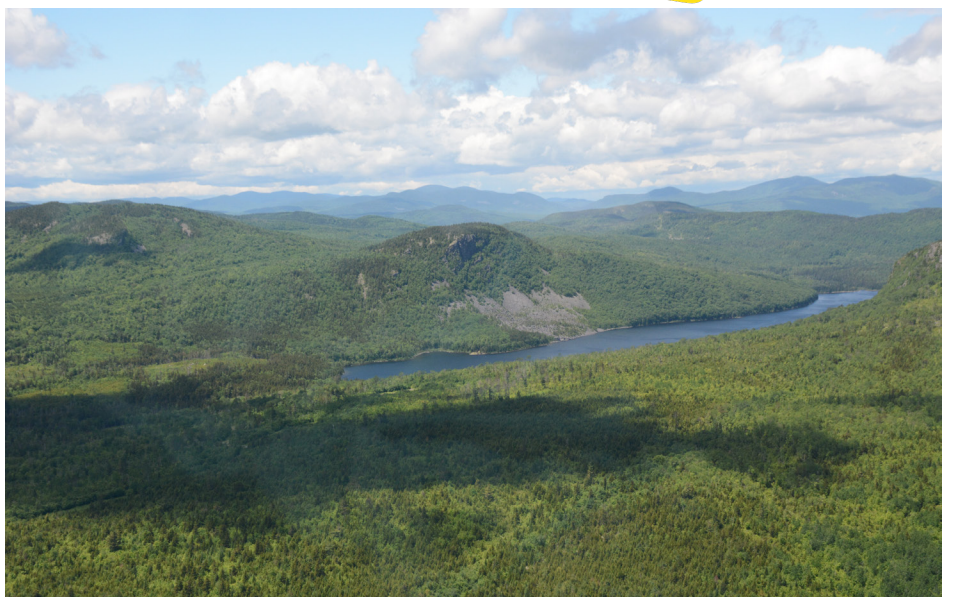
P2-11: Aerial view of Enchanted Pond which is a designated scenic resource with an 'Outstanding' rating in the <u>Maine Wildlands Lake Assessment</u>. The Project (3.4 miles at the closest point) will not be visible from this pond due to intervening topography.