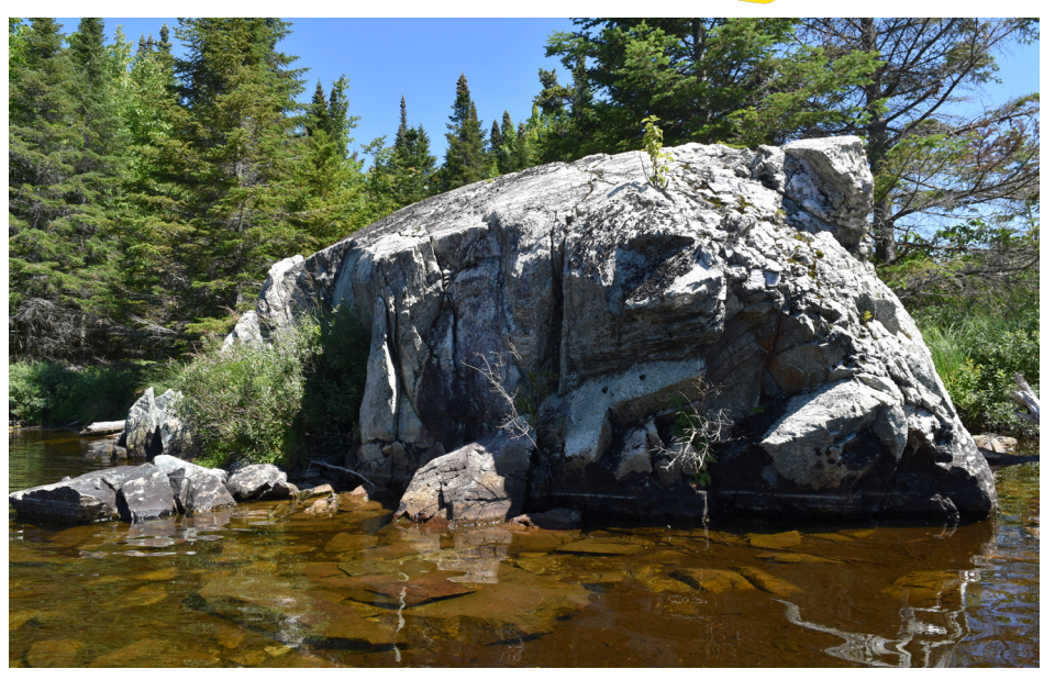
P1-5: Boulders near boat put-in at Wing Pond.