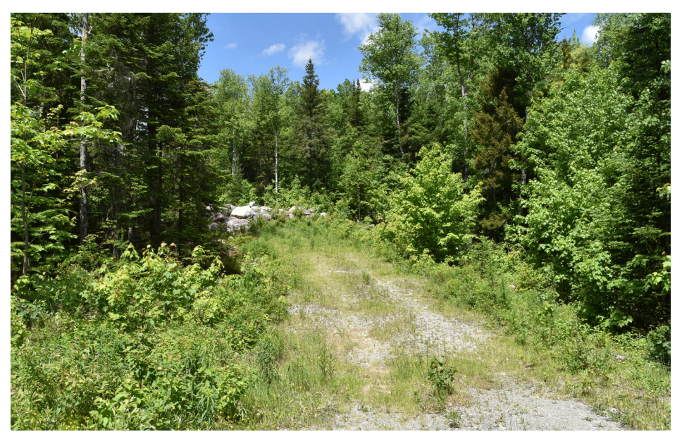
P1-16: Parking area for Tobey Ponds, T5 R7 BKP WKR.