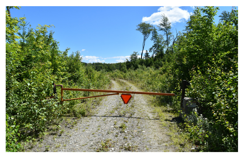
P1-2: Gated road access to Beattie Pond (0.75 mi.+/- from pond). The road ends 400' +/- from the southern edge of the pond.