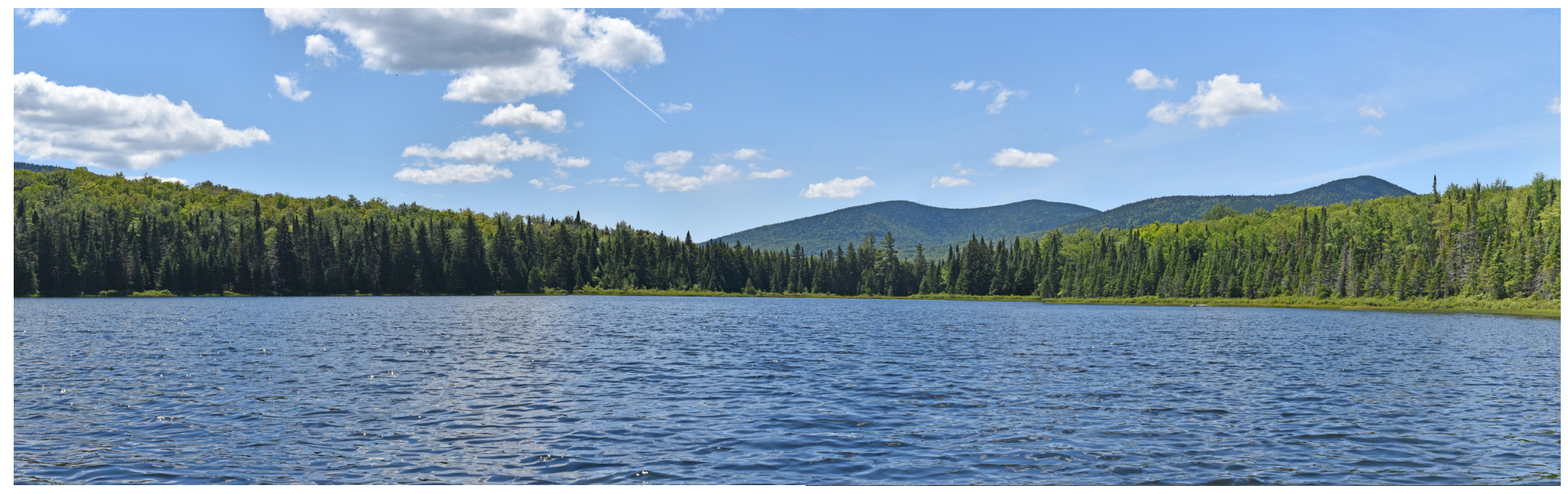
P1-1: Panoramic view from the north end of Beattie Pond in Beattie Twp looking south. Beattie Pond is classified as a Management Class IV Lake, Remote Pond. One structure will be visible above the tree line at a distance of 1,300' +/-. See Photosimulation in Appendix D.