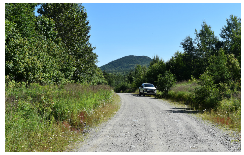
P1-9: View looking north at the proposed HVDC line crossing site on Goldbrook Road. King Mountain can be seen 1.7 miles +/- in the distance.