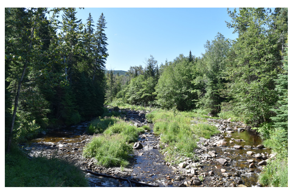
P1-7: View from bridge on Goldbrook Road looking north near the intersection of the West and South Branches of the Moose River, SkinnerTwp.