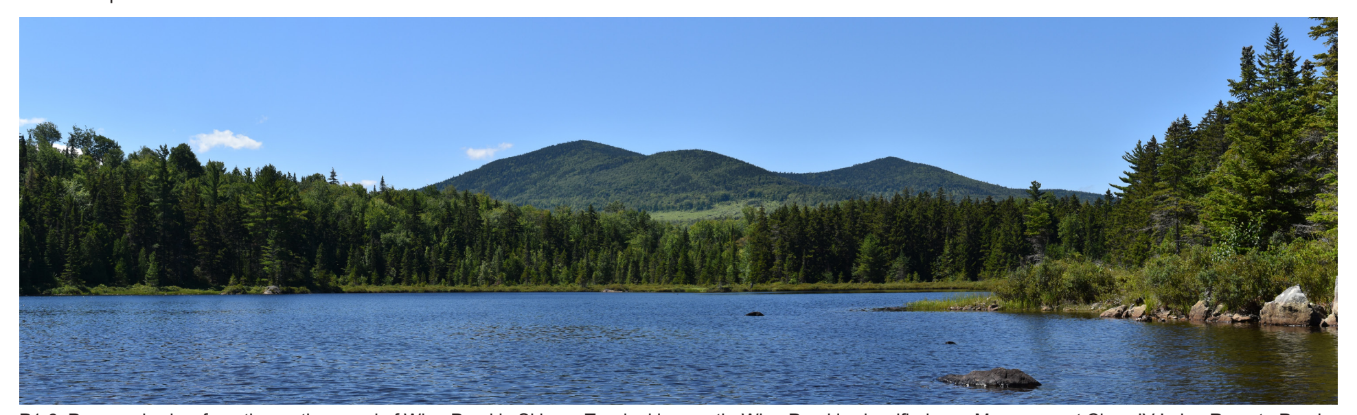
P1-6: Panoramic view from the northern end of Wing Pond in Skinner Twp looking south. Wing Pond is classified as a Management Class IV Lake, Remote Pond. Portions of two structures and conductors will be visible above the tree line at a distance of 1.75 mi +/-. See Photosimulation in Appendix D.