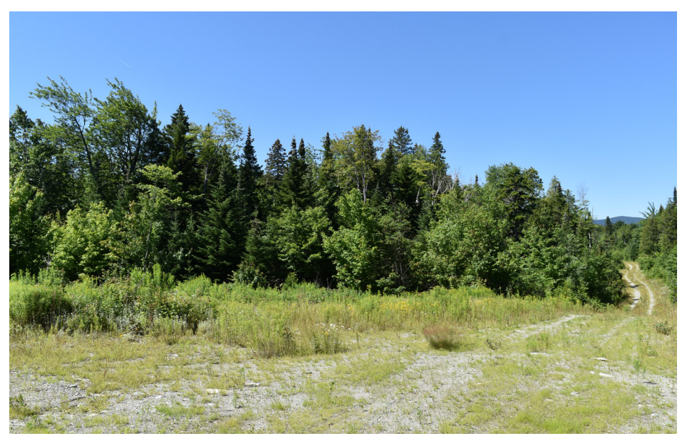
P1-4: Harvesting road/parking area, located .25 mi +/- from Wing Pond, Skinner Twp.