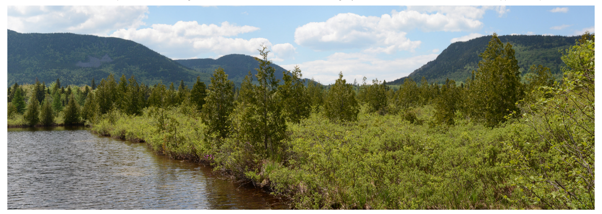
P1-12: Panoramic view from boat launch on northern end of Rock Pond looking west. The majority of the Project will be screened by intervening vegetation from the boat launch, Appleton Twp. Map 1 / Page 4