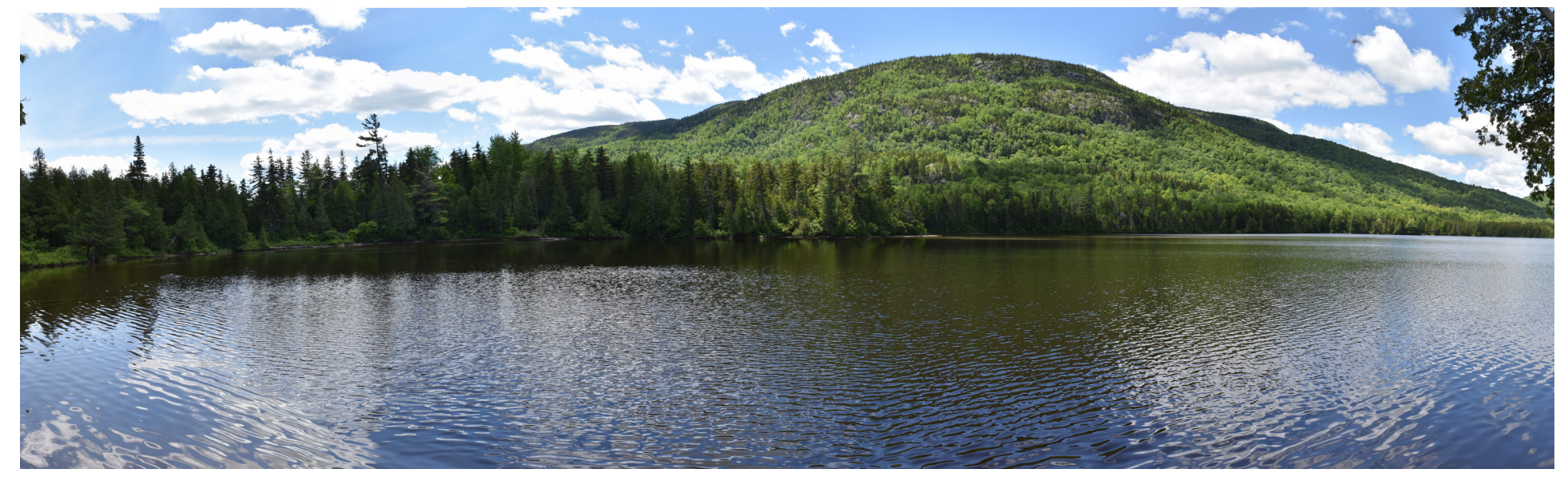
P1-18: Panoramic view from Tobey Pond #1 looking west in T5 R7 BKP WKR. The Tobey Ponds are classified as a Management Class IV Lake, Remote Ponds. Tobey Pond #1 is also a designated scenic resource with a 'Outstanding' rating in the Maine Wildlands Lake Assessment. The Project will not be visible from any of the Tobey Ponds.