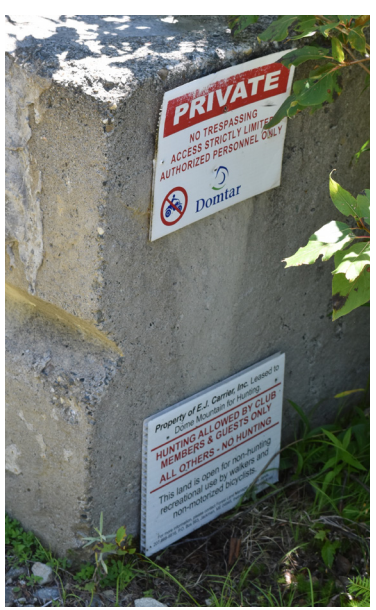
P1-3: Signage at access road gate to Beattie Pond.