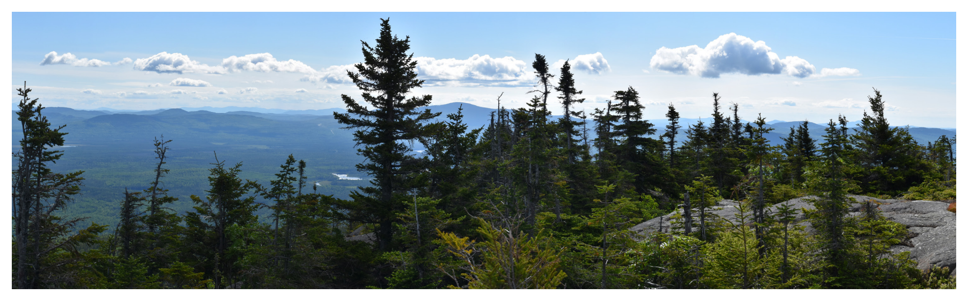
P1-22: Panoramic view from the summit of No. 5 Mountain in T5 R7 BKP WKR. See Photosimulation in Appendix D for view from the fire tower.