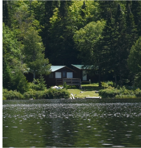
P1-3a: Private camp on southeastern end of Beattie Pond.