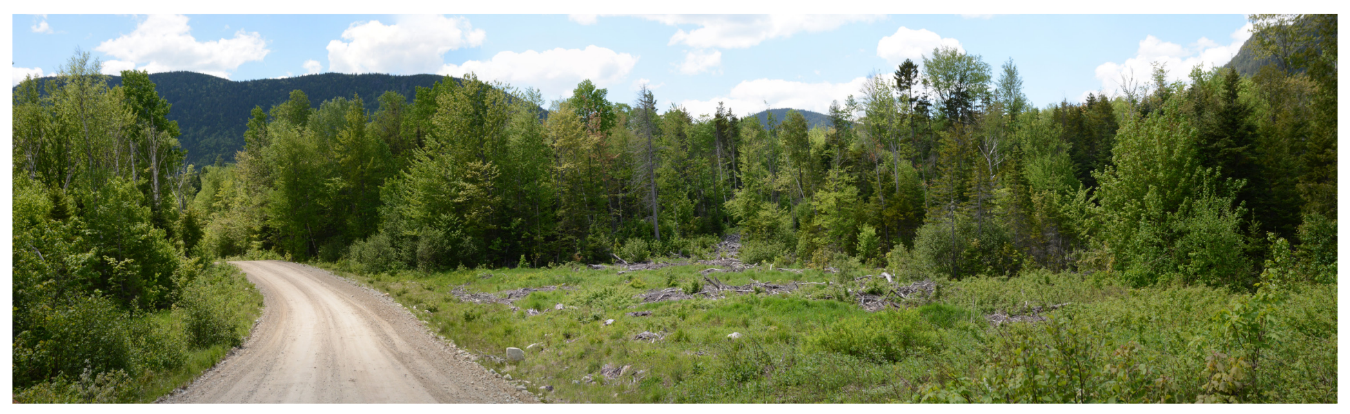
P1-11: Panoramic view from Spencer Road looking southwest. Evidence of timber harvesting lay down area visible on side of the road, Appleton Twp.