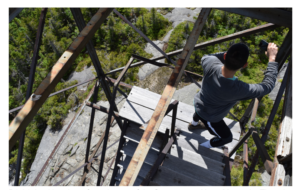
P1-24: Looking down from the top of the fire tower on No. 5 Mountain. There is no platform at the top of the fire tower, views are from the stairs.