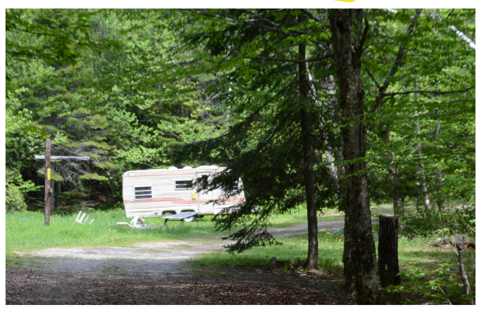
P1-14: Campsites located on the north end of Rock Pond.