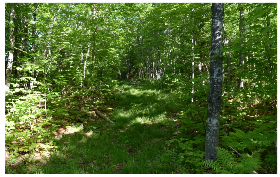
P1-21: Wardens Trail on the way up to No. 5 Mountain, T5 R7 BKP WKR. The trail appears to be lightly used.