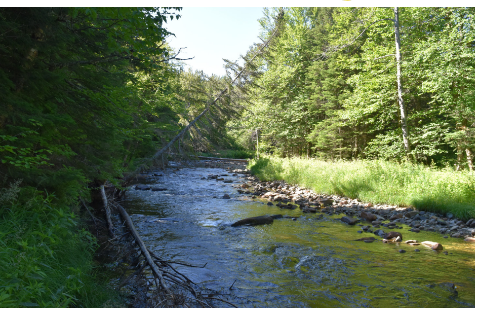
P1-8: View looking south at the site of the proposed HVDC line crossing of the South Branch Moose River near Goldbrook Road, Skinner Twp.