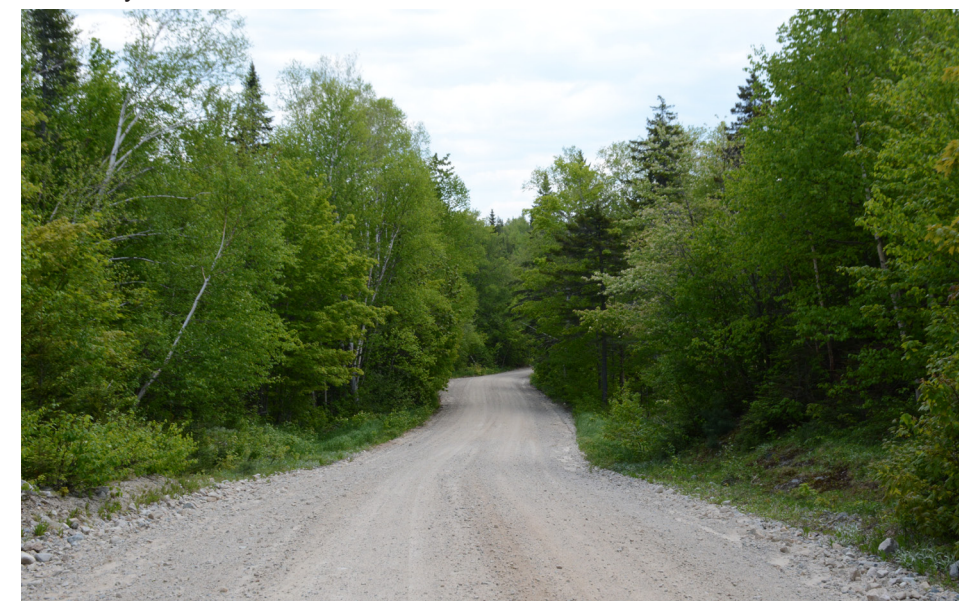
P1-20: View looking south toward the proposed HVDC Transmission line crossing on Spencer Road east of access road to No. 5 Mountain.