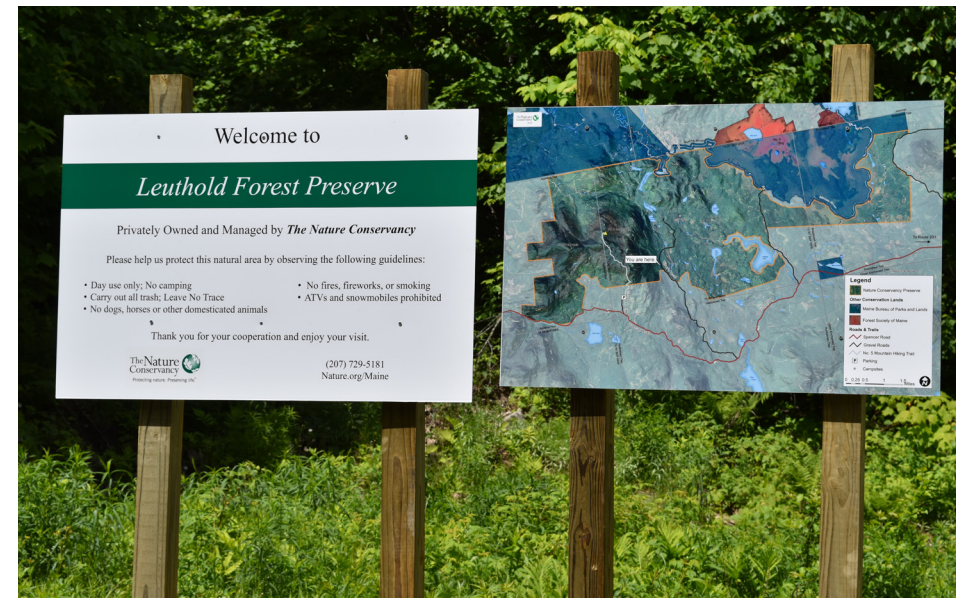
P1-17: Signs for The Nature Conservancy's Leuthold Forest Preserve on the road that leads to Tobey Ponds.