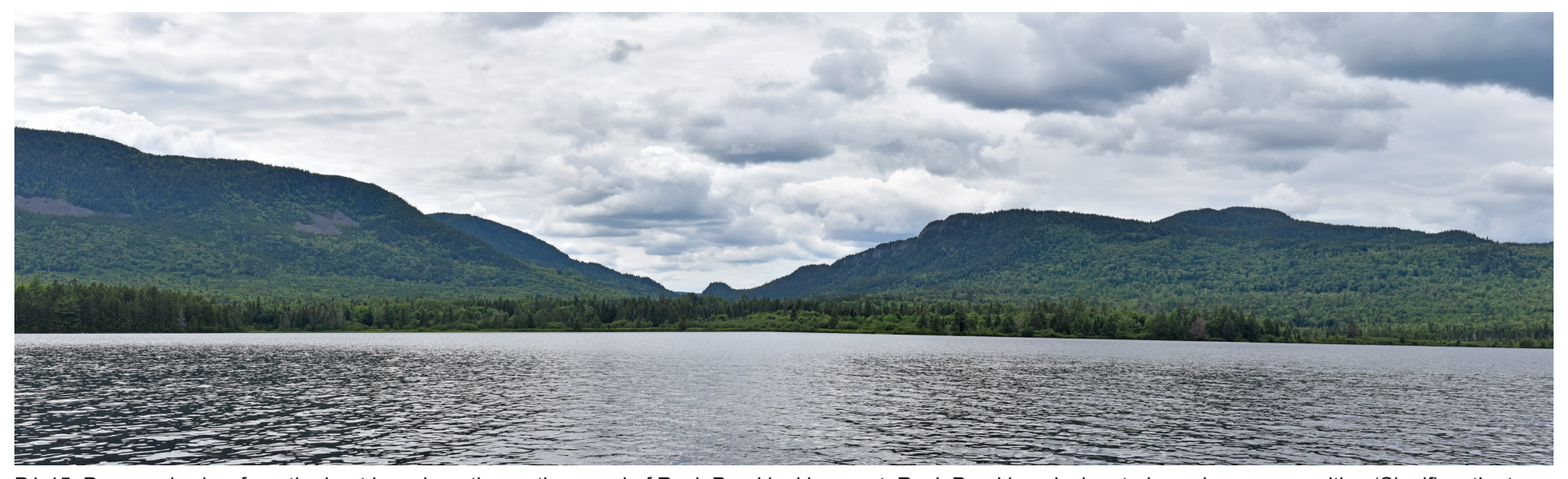
P1-15: Panoramic view from the boat launch on the northern end of Rock Pond looking west. Rock Pond is a designated scenic resource with a 'Significant' rating in the <u>Maine Wildlands Lake Assessment</u>. Portions of 7 structures and conductors and the corridor clearing will be visible above the tree line at a distance of 3,500'+/-. See Photosimulation in Appendix D for view from Rock Pond.