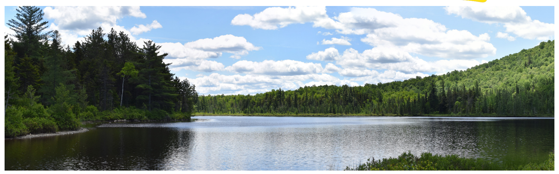
P1-19: Panoramic view from Tobey Pond #3 looking south, T5 R7 BKP WKR. The Tobey Ponds are classified as a Management Class IV Lake, Remote Pond. Tobey Pond #3 is also a designated scenic resource with a 'Significant' rating in the Maine Wildlands Lake Assessment. The Project will not be visible from any of the Tobey Ponds.