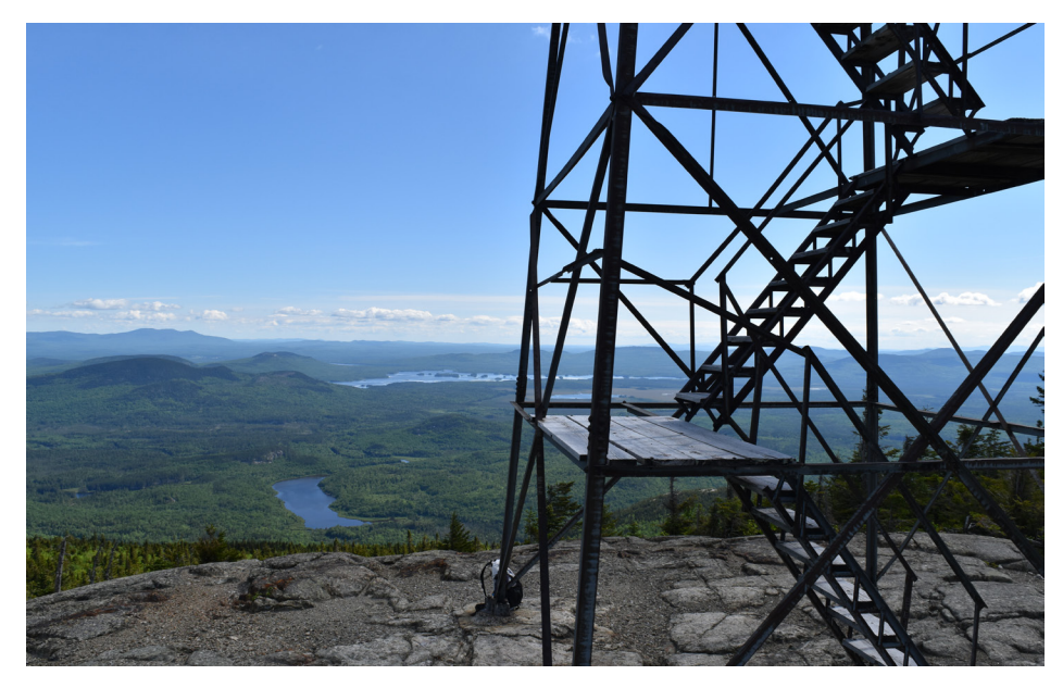
P1-23: View looking south at the base of the fire tower atop No. 5 Mountain.