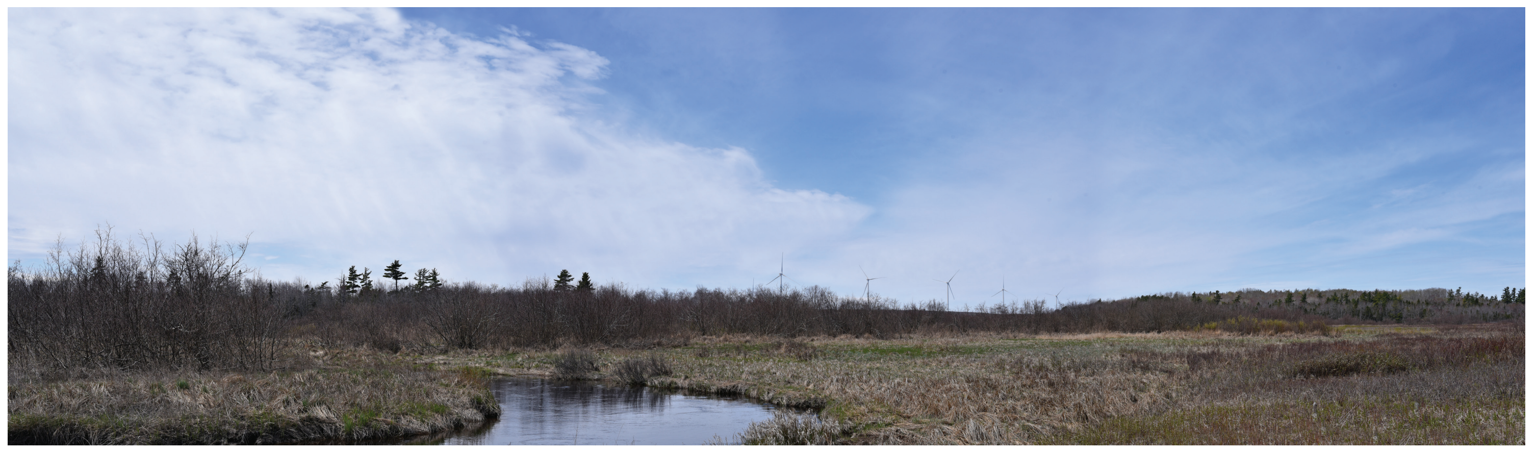
Panoramic view looking southwest to northwest from the Pleasant River toward a portion of the proposed Downeast Wind Project. Five turbines and the blades of one turbine will be visible looking in this direction from a distance of 2.0 to 3.8 miles.