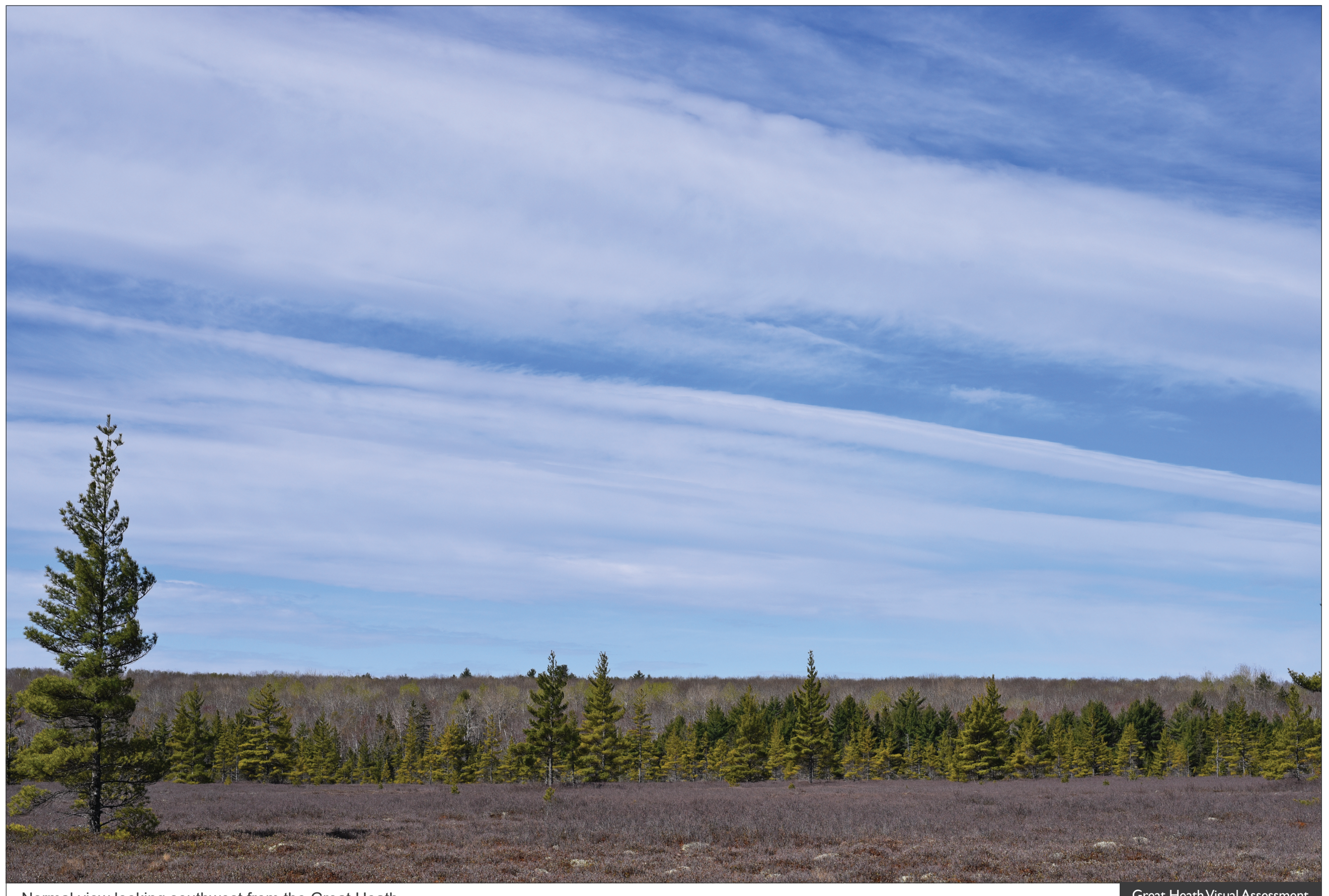
Normal view looking southwest from the Great Heath.

Great Heath Visual Assessment June 4, 2021 Page 4 of 10