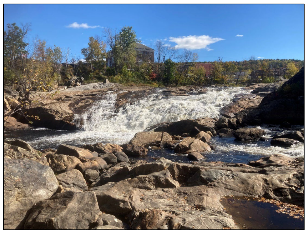
265 cfs flow, 10/20/21, upstream view.