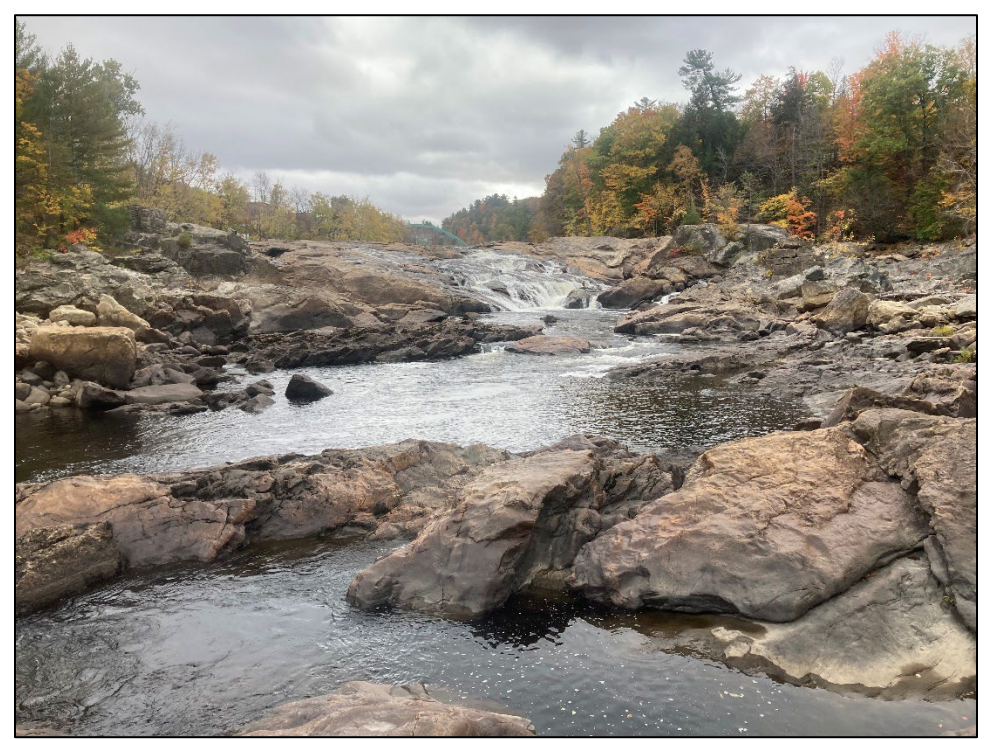
90 cfs flow, 10/18/21, upstream view.

(1) Cascades upstream of Portland Street bridge