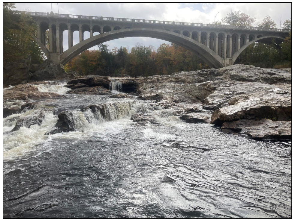
190 cfs flow, 10/19/21, upstream view.