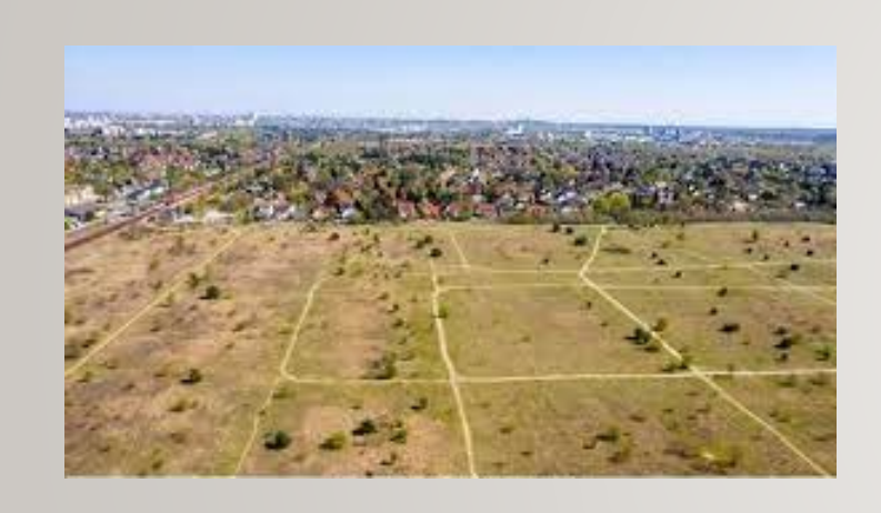
Land (with an original assessed value)