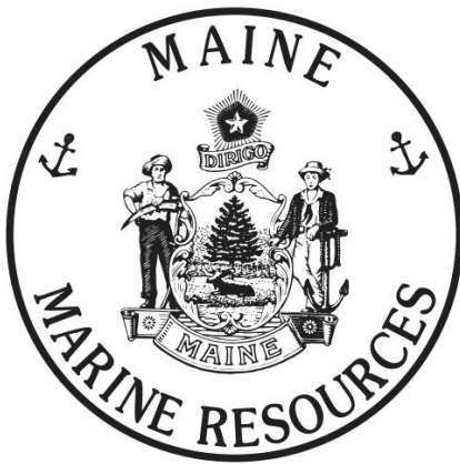
DMR Seal on Frt, DMR-4 inch Letters on Back (T-Shirt/Sweatshirt – Navy/Lt Grey