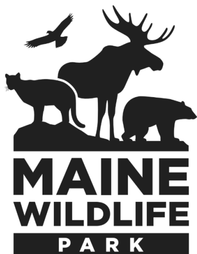
IF& W Logo – Screen Print – 1 color