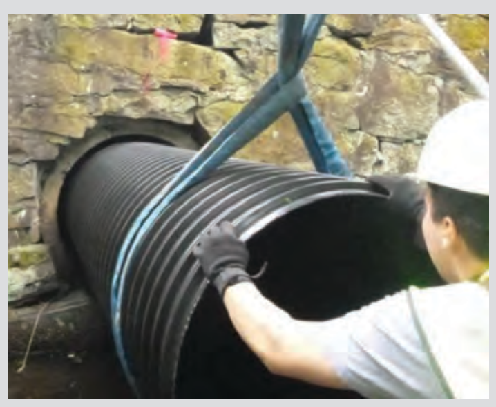
39 foot PE x PE 36" Kanapipe slip line Mendon, MA

Kanaflex Kanapipe is available in standard lengths of 20' and 24' lengths as well custom lengths up to 40' in Bell x Spigot, PE x PE, or combination configurations. Ideal for culvert rehab, slip lining, and significantly reducing installed joints on storm and sanitary sewer layouts. Longer lengths improve the integrity of pipelines, eliminates waste, and reduces the cost of installation.