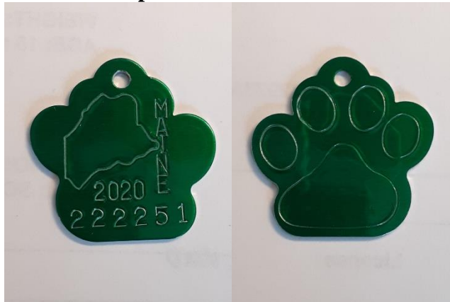
2020 Example Below-Not to scale or color

The State of Maine shape to be etched or stamped inside the dog's paw front underneath the tab, with 2023 etched below the shape of the State of Maine logo. "MAINE" to be etched vertically, top to bottom, on right of the Maine image on tag. Numbering to be etched on bottom of tag, below the 2023. On the back of tag, the etched image of a dog's paw. Tags must be filed, tumbled or sanded to ensure edges aren't sharp. Color on tags shall be durable, scratch-resistant and water-resistant, nontoxic and stand up to everyday wear and tear.