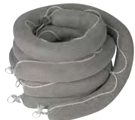
Universal Plus Chemical Booms