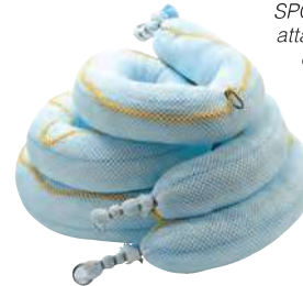
Economical ENV® Oil Booms