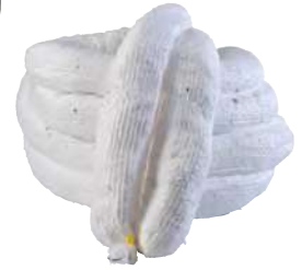
SPC5510 features booms attached side by side for double absorbency