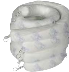
Premium SPC® Oil Booms