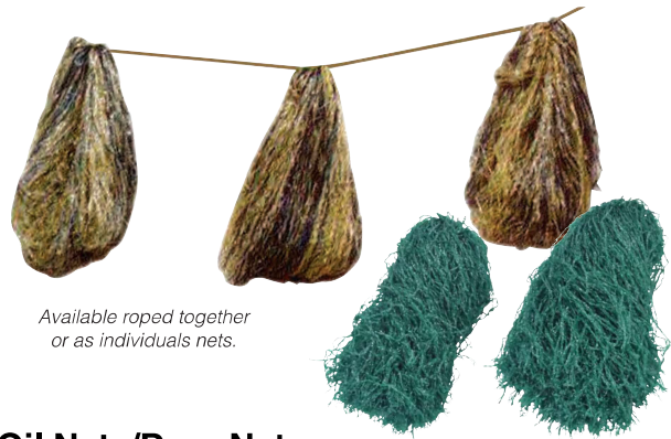
Available roped together or as individual nets.