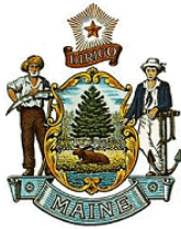
JANET T. MILLS GOVERNOR