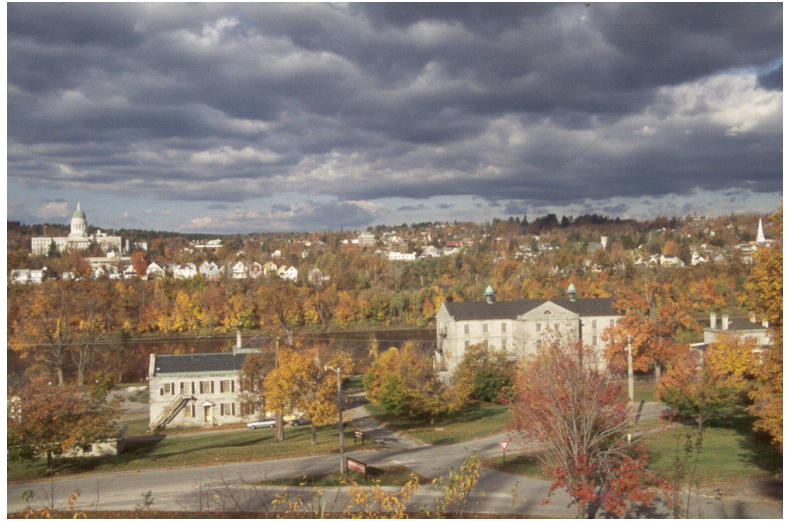
The Capitol and the Kennebec as seen from the Arsenal

With the completion of the Master Plan, its approval by the Capitol Planning Commission, and its acceptance by the Legislature, the work of the MPC will be complete. The task of implementing the plan will fall to the Bureau of General Services under the auspices of the Capitol Planning Commission. The list of master plan-based projects will be supplemented by maintenance and space planning projects proposed by State agencies.