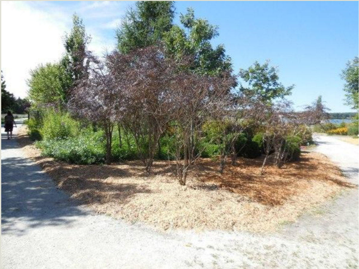
Photo 2: One of the garden beds at the YardScaping Gardens at Back Cove, after weeding and mulching are complete. Note that all of the path edges are also mulched.