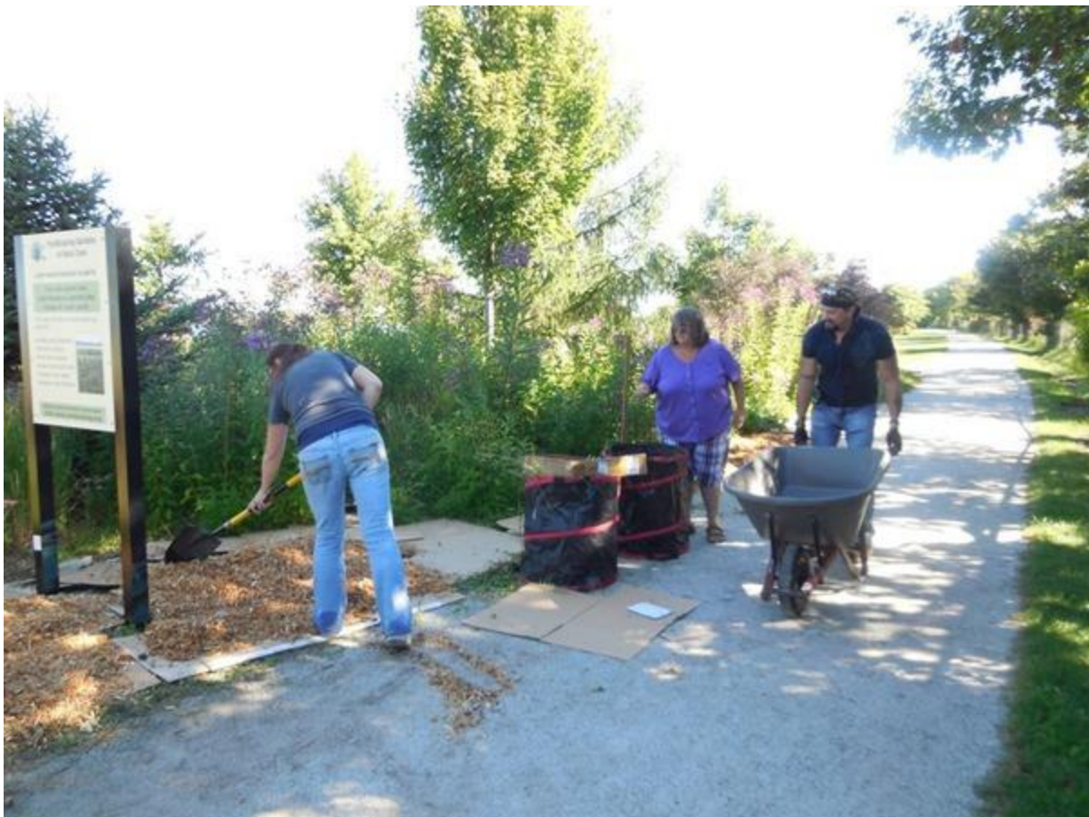
Photo 1: IDEXX volunteers at work, mulching a garden bed at the YardScaping Gardens at Back Cove. The three-step weeding/mulching process involves the complete weeding of the bed, the laying down of heavy cardboard to cover the entire area, and then the application of the final layer of mulch.