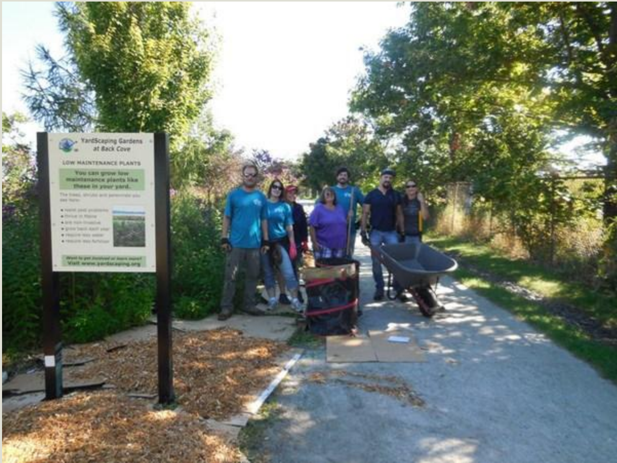
Photo 3: The IDEXX crew takes a quick break from their mulching work at the YardScaping Gardens at Back Cove.