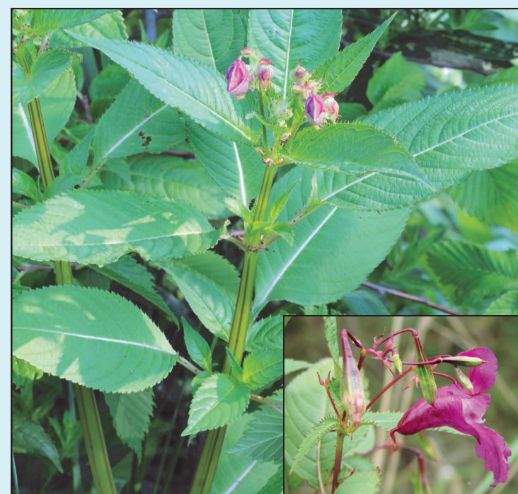
Ornamental Jewelweed ( Impatiens glandulifera )