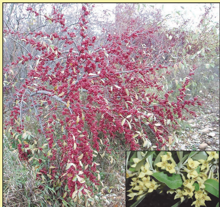
Autumn Olive ( Elaeagnus umbellata )