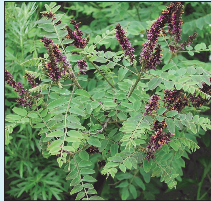
False Indigo Bush ( Amorpha fruticosa )