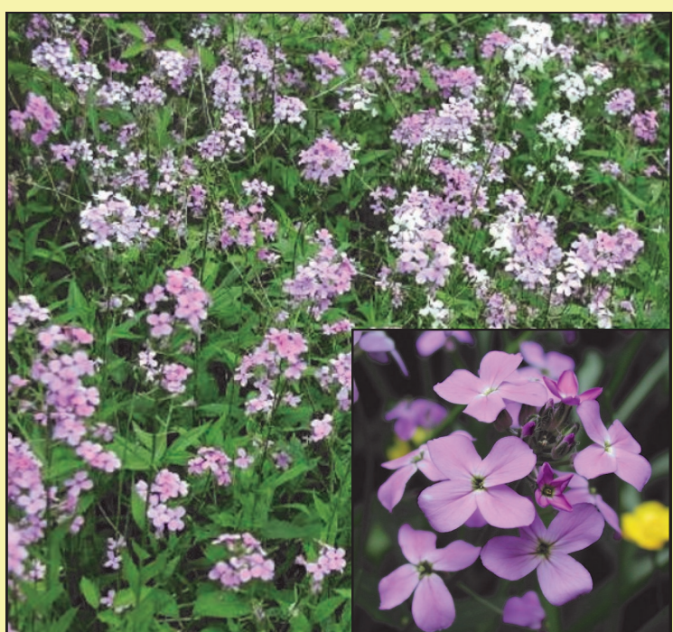
Dame's Rocket ( Hesperis matronalis )