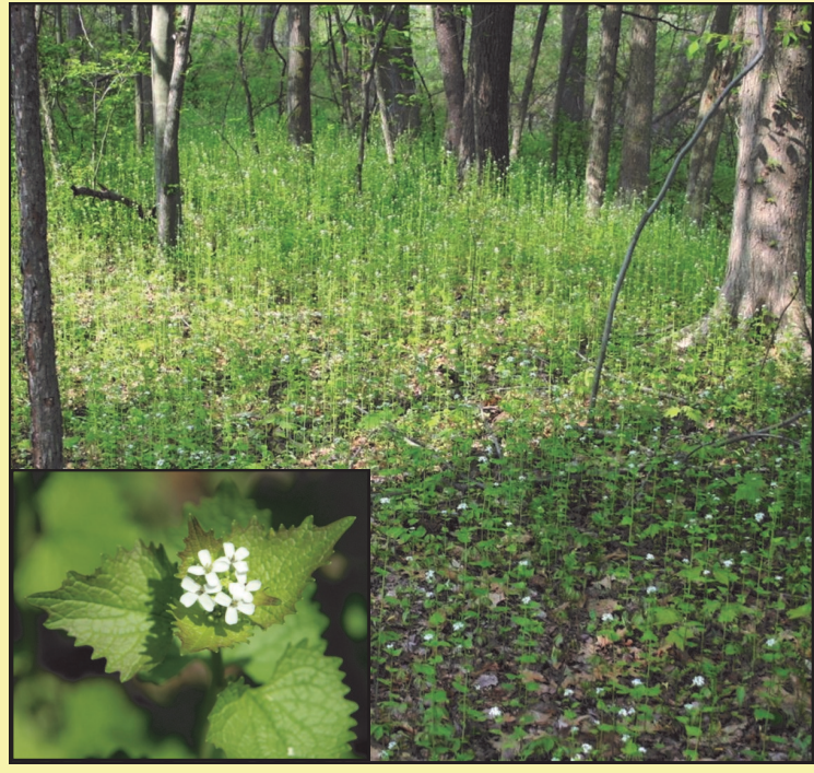
Garlic Mustard ( Alliaria petiolata )