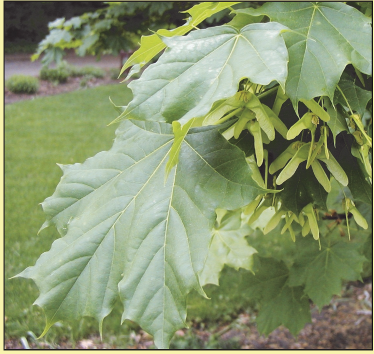
Norway Maple ( Acer platanoides )