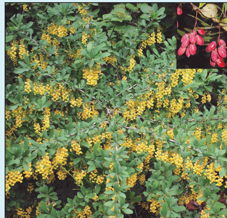
Common Barberry ( Berberis vulgaris )