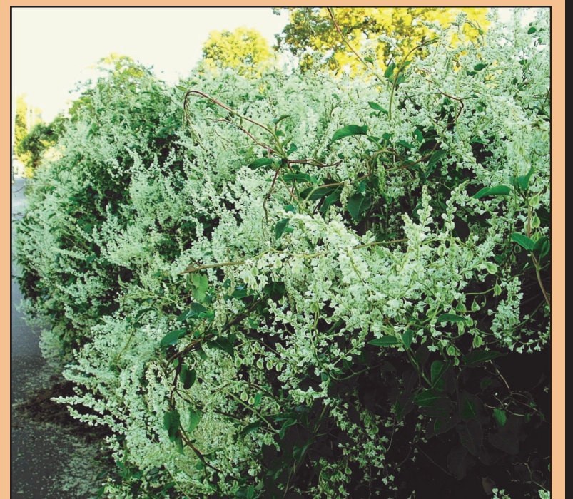
Chinese Bindweed ( Fallopia badschuanica )