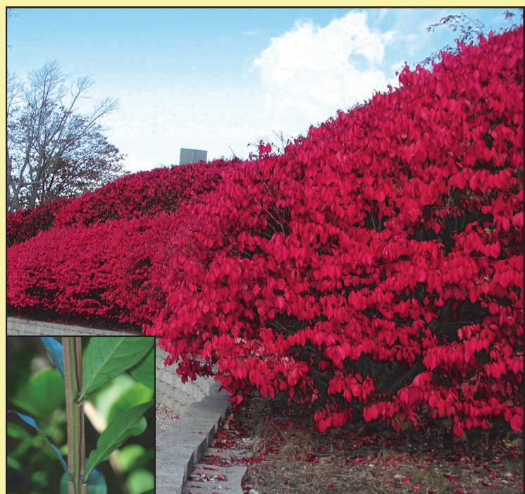
Winged Euonymus ( Euonymus alatus )