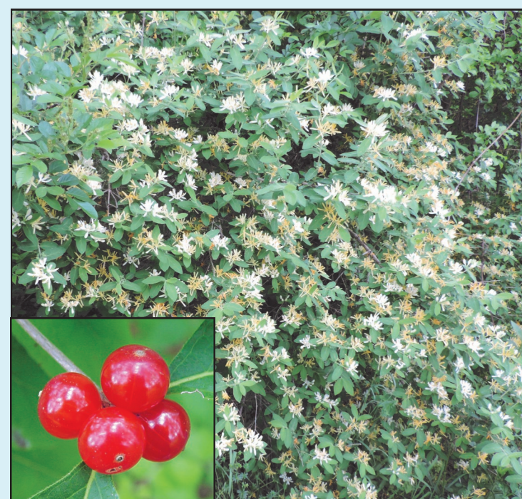
Amur or Bush Honeysuckle ( Lonicera maackii )