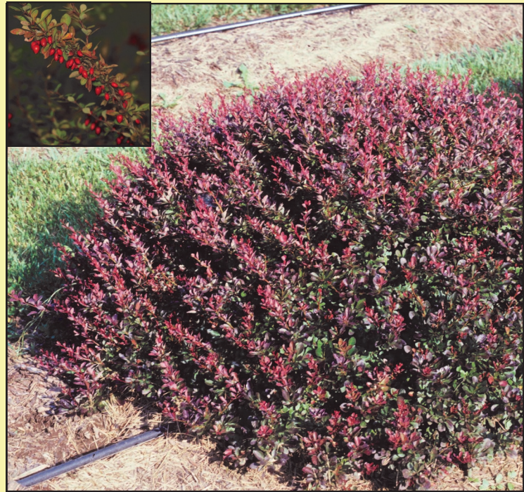
Japanese Barberry ( Berberis thunbergii )