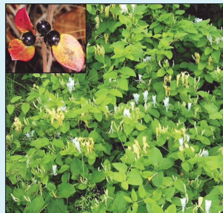
Japanese Honeysuckle ( Lonicera japonica )