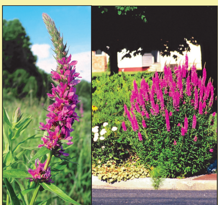
Purple Loosestrife ( Lythrum salicaria )