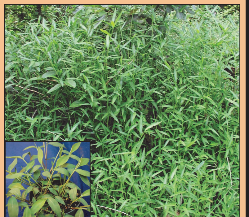
Japanese Stilt Grass ( Microstegium vimineum )