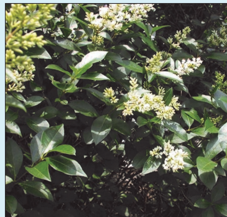
Common Privet ( Ligustrum vulgare )