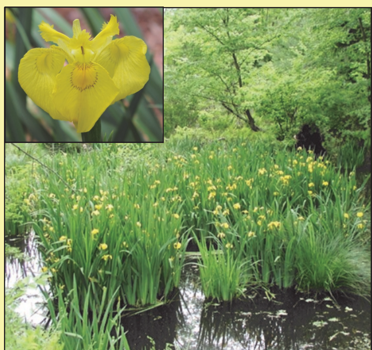
Yellow Iris ( Iris pseudacorus )