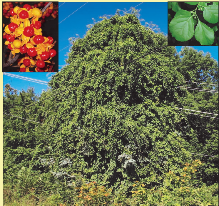
Asiatic Bittersweet ( Celastrus orbiculatus )