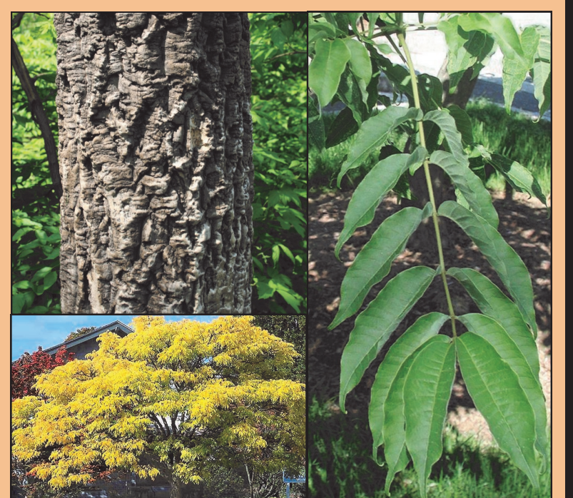
Amur Cork Tree ( Phellodendron amurense )