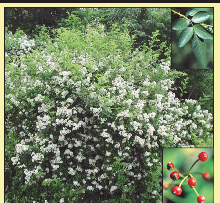
Multiflora Rose ( Rosa multiflora )