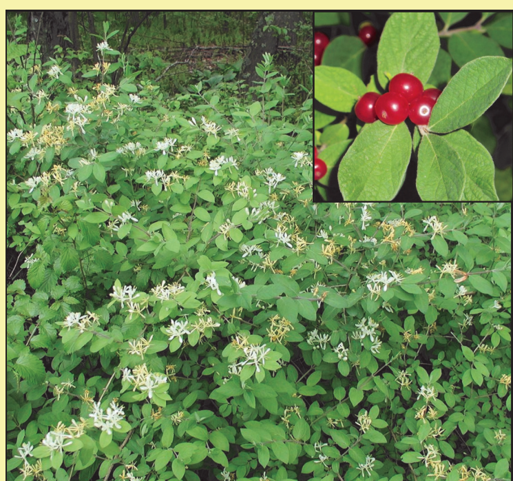
Morrow's Honeysuckle ( Lonicera morrowii )