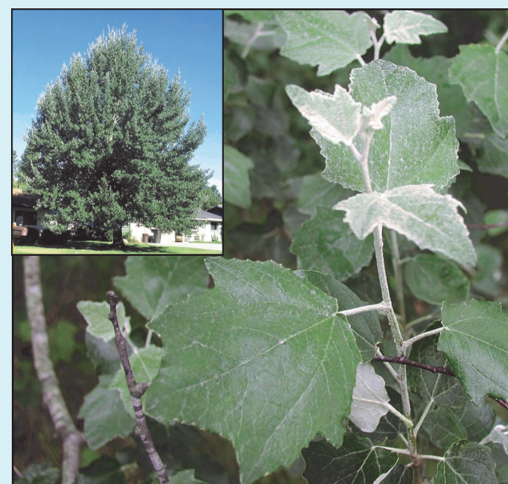
White Cottonwood ( Populus alba )