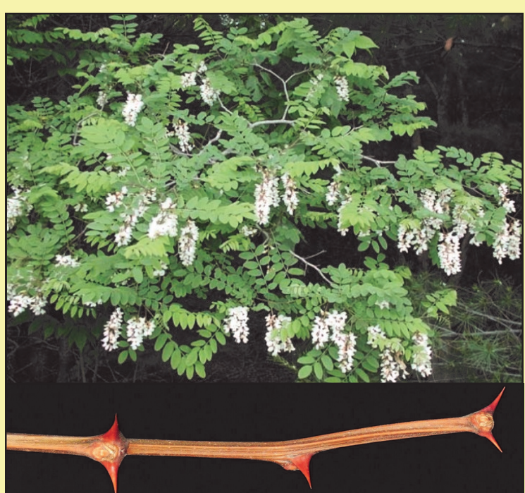
Black Locust ( Robinia pseudoacacia )