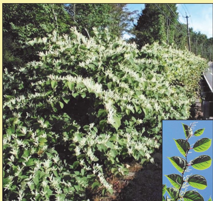
Japanese Knotweed ( Fallopia japonica )