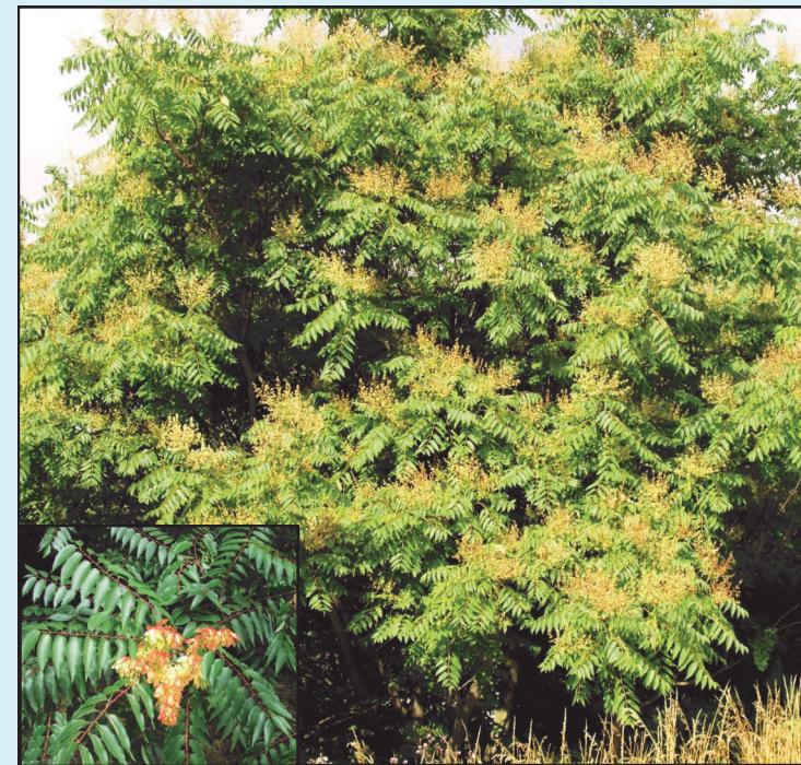
Tree of Heaven ( Ailanthus altissima )