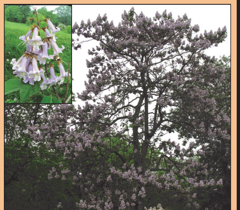
Pawlownia ( Paulownia tomentosa )