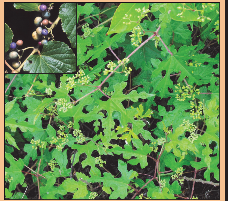
Porcelain Berry ( Ampelopsis glandulosa )