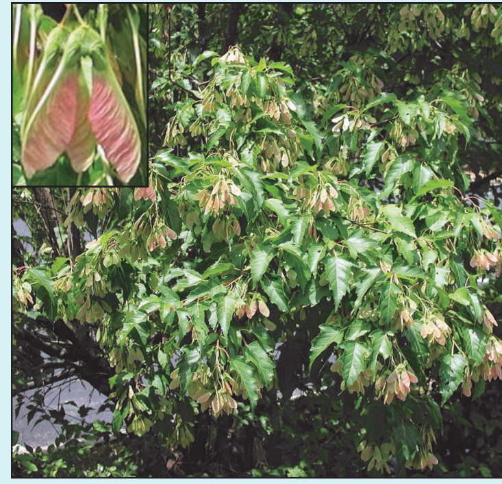
Amur Maple ( Acer ginnala )