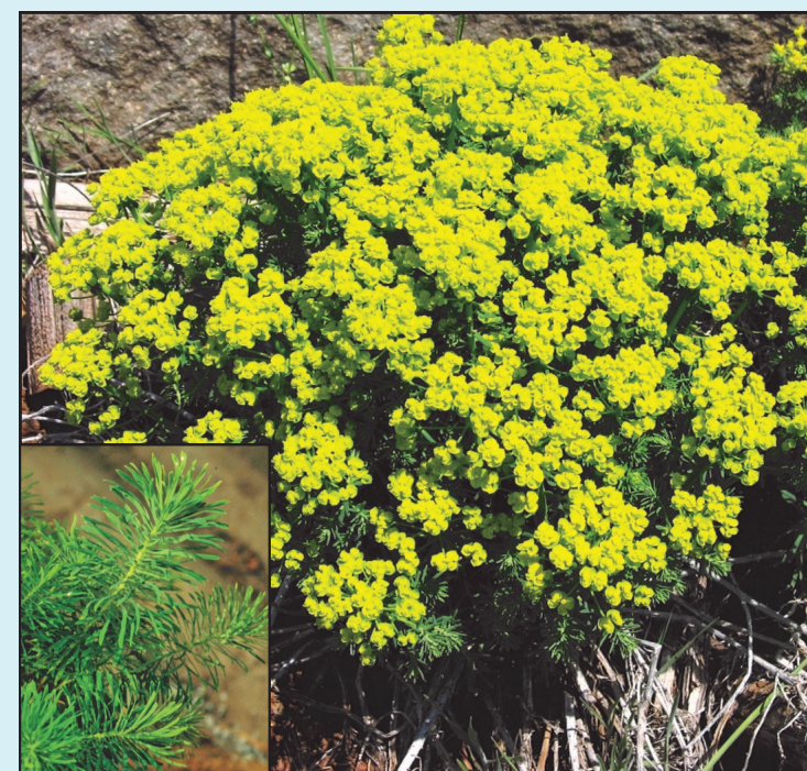
Cypress Spurge ( Euphorbia cyparissias )