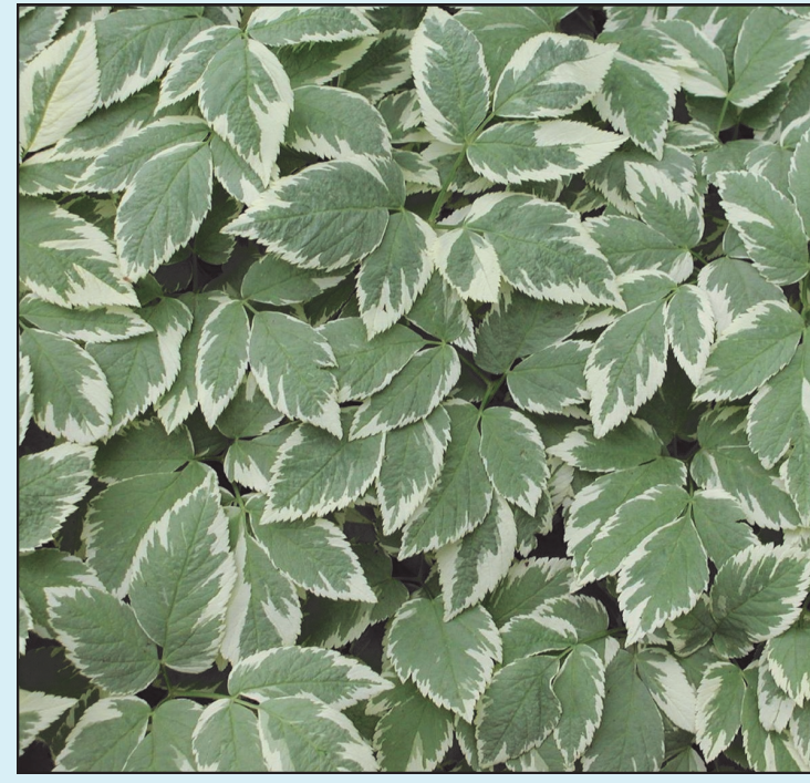
Bishop's Weed ( Aegopodium podagraria )