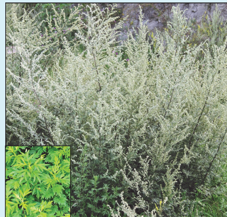
Common Mugwort ( Artemisia vulgaris )