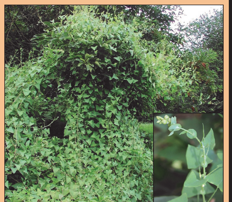
Mile a Minute Weed ( Persicaria perfoliata )