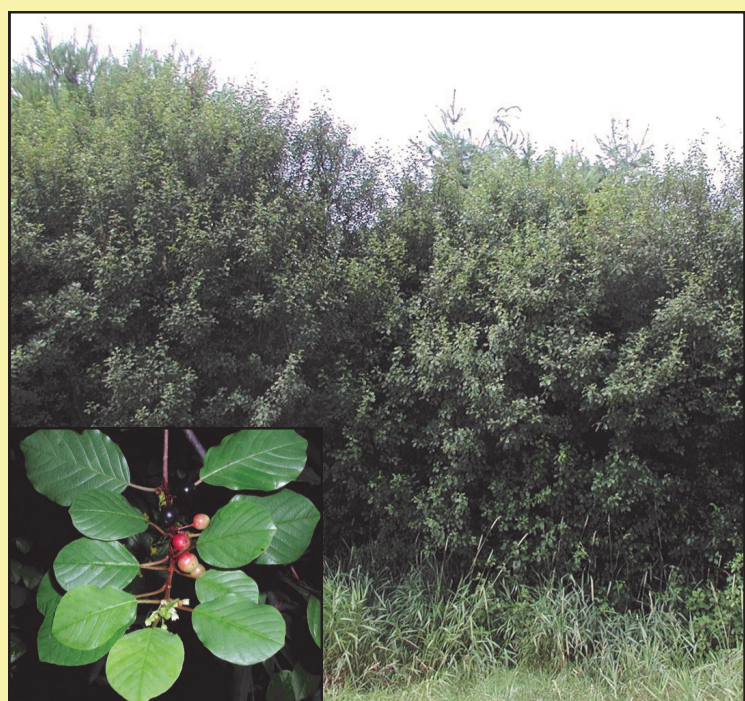
Glossy Buckthorn ( Frangula alnus )