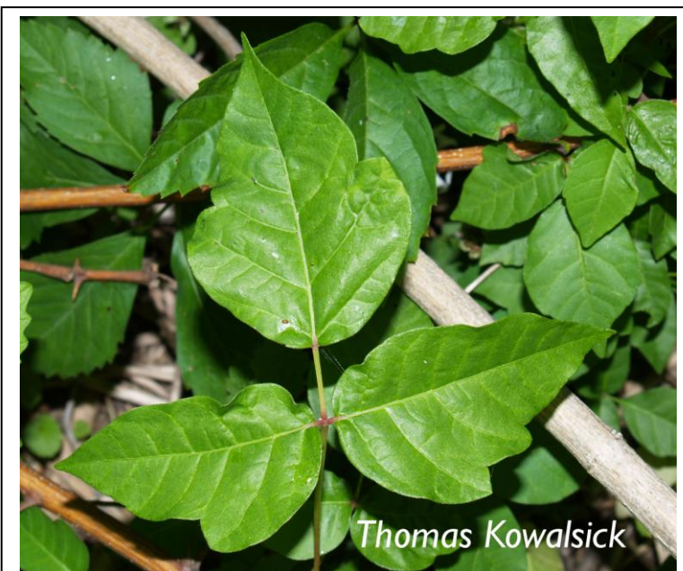
Figure 1 - A poison ivy leaf. Note the variations of the leaf margins of the individual leaflets. (Thomas Kowalsick, Cornell Cooperative Extension – Suffolk County)

Introduction: Poison ivy is the major cause of allergic dermatitis in the eastern United States. All parts of the plant contain resinous compounds, known as urushiols, which cause inflammation of the skin, blistering, and itching. You can not catch poison ivy by “just walking in the vicinity of a plant.” The toxic compounds can be transmitted in smoke (from burning the plant) and by direct contact with any of the plant parts. In addition it is possible to contact the toxic compounds through objects or animals, which have been exposed to the plant, including gardening tools, pets and clothing. Some feel that you can “catch” poison ivy only during the spring and summer when the leaves are present. This is not true, dermatitis response can occur year round including if you contact stems and roots during the winter months. Just because a poison ivy plant is dead does not make it incapable of causing allergic dermatitis. The urushiols can remain active on dead plants and even other objects for over a year.