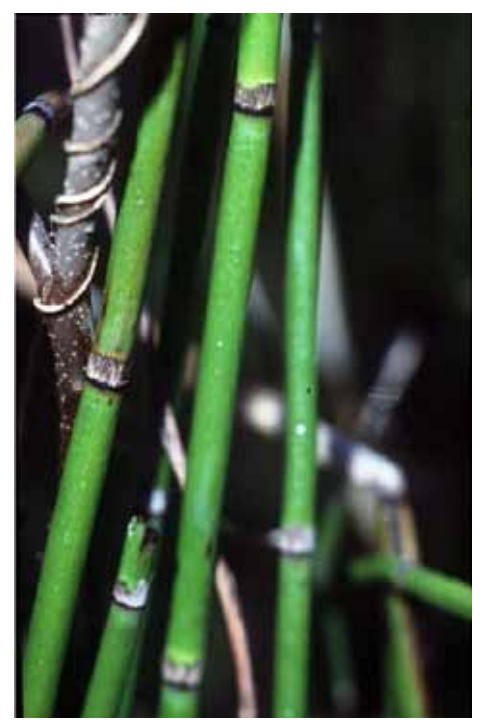
Robert H. Mohlenbrock @ USDA-NRCS PLANTS Database / USDA SCS. 1989.

Herbicides containing the active ingredient halosulfuron-methyl (Sedgehammer®, Sandea®, etc.) are effective in the control or suppression of