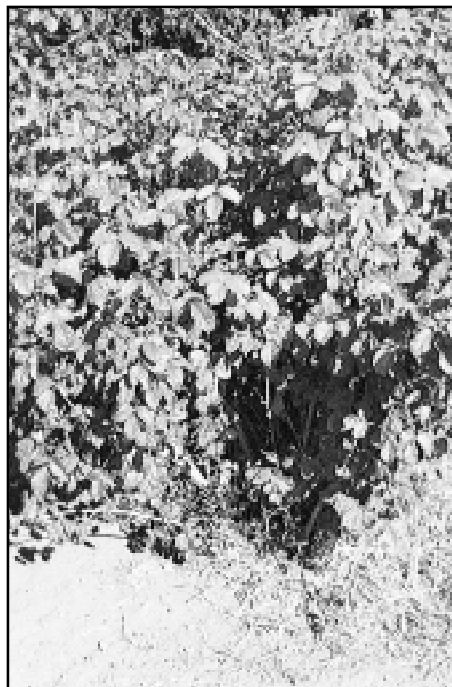
Oregon Dept. of Agriculture

Wash yourself within thirty minutes of the exposure with a mixture of cold or tepid water and rubbing alcohol; follow this with more water and, optionally, soap. 1,3 Use "copious amounts" of water. 3 Commercial skin cleansers that are designed to separate urushiol from skin may also be useful. 8 After a reaction, hot