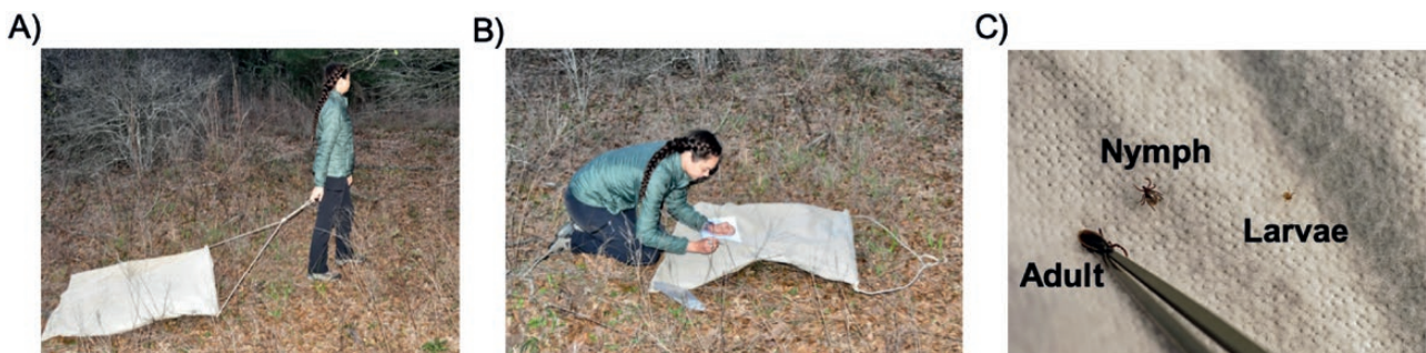
Fig. 1. Demonstration of tick dragging in the field. The series of panels show (A) walking to the pace of the ‘wedding march’ (approximately 50 m/min, a 30-min mile, or 1.8 miles/h) with the drag cloth trailing behind the collector, (B) pausing after 15 m to remove any collected ticks, and (C) a size comparison of Ixodes pacificus at each life stage to demonstrate the differences in size of the three tick life stages.