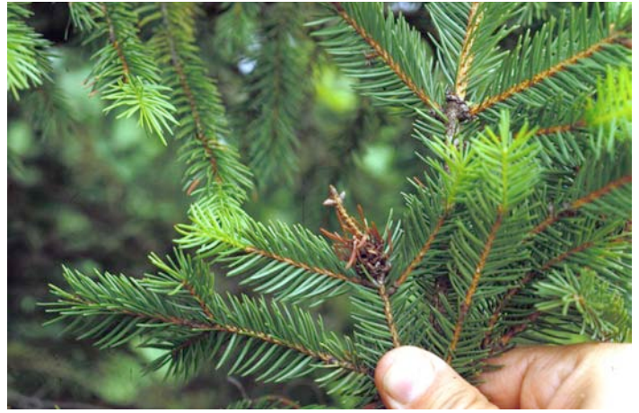
Eastern spruce gall

Apply insecticides to kill adelgid immatures in spring. Effective materials include summer rates of horticultural oil, insecticidal soap, carbaryl (Sevin 50WP) or imidacloprid (Merit 75 WSP).