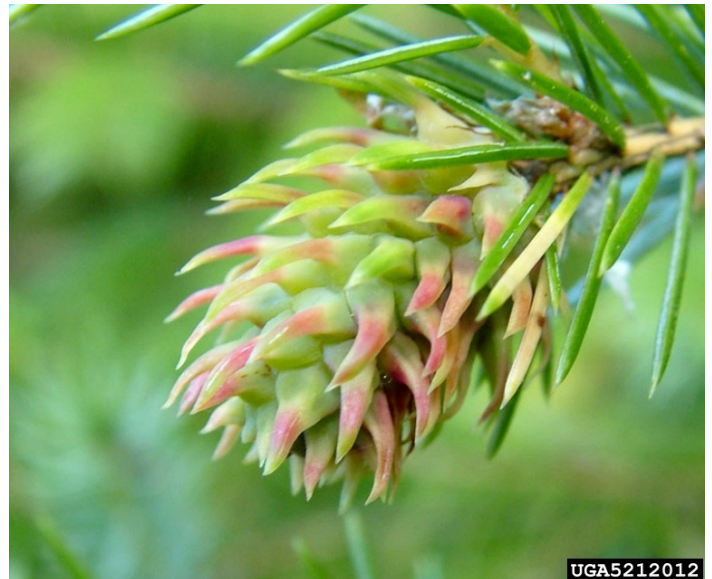
Cooley spruce gall adelgid