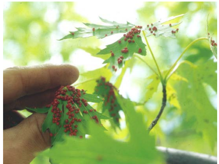
Maple bladder gall

The maple bladder gall mites overwinter in cracks and crevices of the bark. As the buds swell in the early spring, they migrate out on the bud scales. This is when mites are most susceptible to dormant applications of oil spray. When the buds open, the mites feed on the newly developing leaves. In response to this feeding, hollow galls are formed. The mites then live, feed, and mate inside. In fall, mites move back to the bark to hide over the winter.