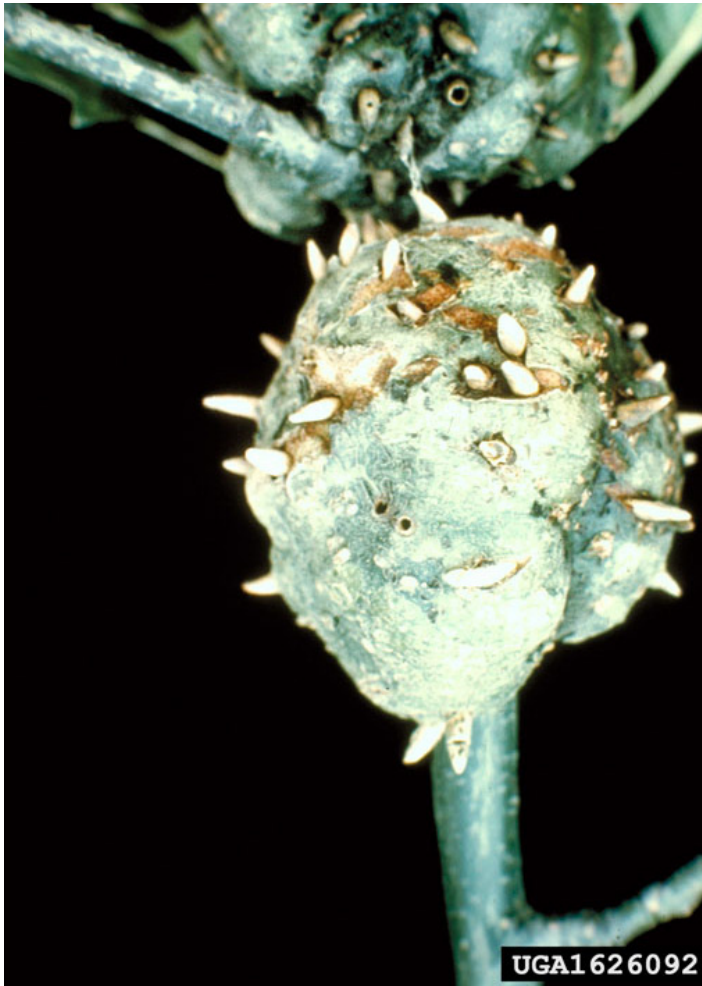
Horned oak gall