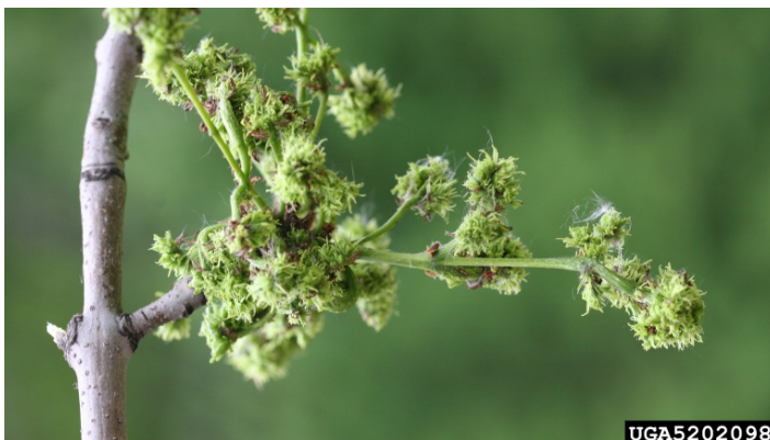
Ash flower gall mite

Control. Adult mites are most susceptible to dormant applications of oil when they become active in spring prior to bud break. Galls should be pruned from the plant prior to this period of mite activity in the spring.