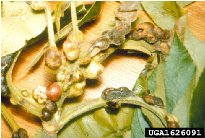
Hickory pouch gall

Control. Be sure to remove and destroy old galls before eggs hatch in the spring.