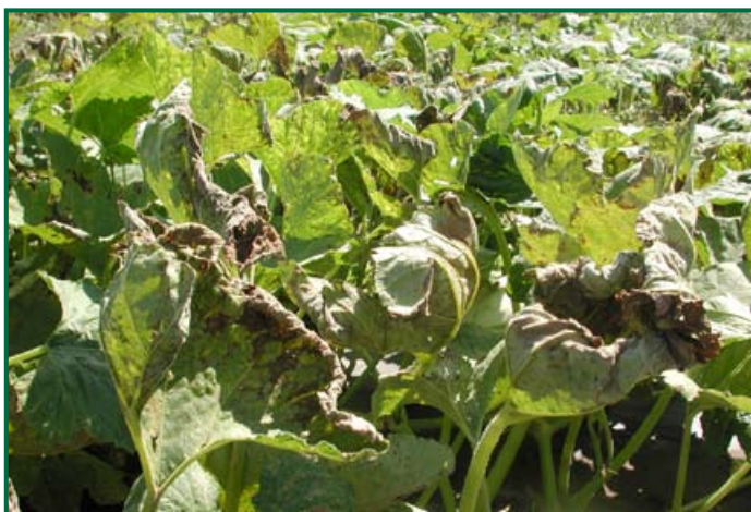
Figure 3. When moisture and temperature are conducive, downy mildew will quickly spread within a field and to other fields. Leaf lesions will become numerous, coalesce, and turn brown. Leaf edges may turn up, making the plants appear scorched.