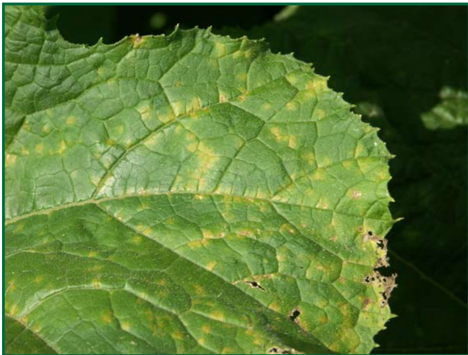
Figure 1. Angular yellow lesions on the upper leaf are often the first observed symptom of downy mildew. Here, lesions are clustered around a vein because this area accumulates moisture.

On pumpkin, downy mildew causes angular yellow lesions on leaves, which may coalesce and turn brown (Figure 1). On wet mornings or after a rain, the downy