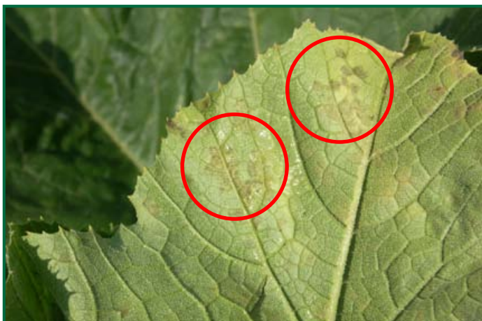
Figure 2. The circled areas are the undersides of lesions like those shown in Figure 1. The fuzzy areas are the spores of the fungus that cause downy mildew. This photograph was taken in the morning when the leaf was still moist with dew.

mildew lesions on the undersides of the leaves may be covered with spores that appear as a dark fuzz (Figure 2). The wind can spread the spores easily to other leaves, plants, and fields. The fungus can spread rapidly and affect large areas of a field when conditions are favorable — 100 percent humidity for at least six hours with temperatures between 59°F and 68°F (Figure 3).