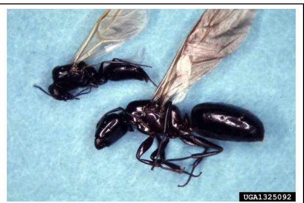
Fig. 5. Winged reproductive male ( top ) and female bottom ) carpenter ants.