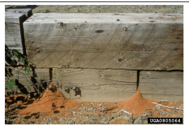
Fig. 1. Sawdust from carpenter ants near a retaining wall timber.

The ants enter wood through cracks or normal cleavages, such as between siding and sheathing or between flooring and subflooring. In trees they usually enter wood through trunk wounds or the stubs of broken branches and extend their galleries from the decayed portion into the sound wood. The insect attack adds to the harmful effects of wood-rotting fungi, both in reducing the physical strength of the tree and in lowering the quality of the wood.