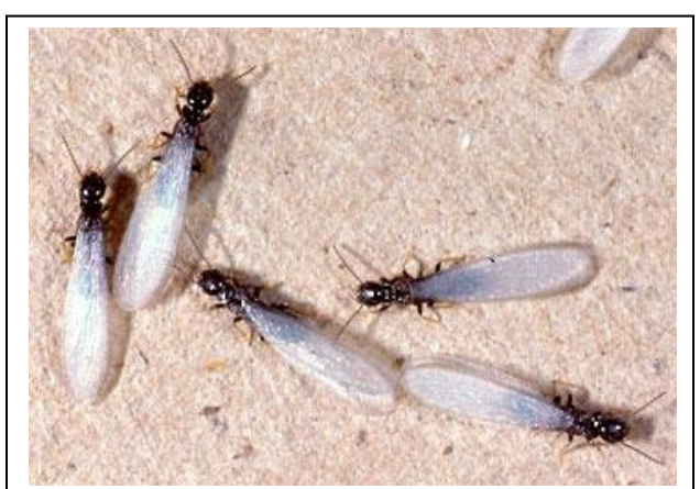
Fig. 6. Winged reproductive termites ( Note the straight antennae, length and shape of the wings, and the straight body sides )

Control inside the home: If you need to use an insecticide indoors, explore your options and choose the least toxic material. Apply in limited amounts and provide adequate ventilation during and after application. Be sure that all the pesticides you use are household formulations and that the pest and the site are clearly listed on the label. Uses inconsistent with the label are illegal and could be dangerous.