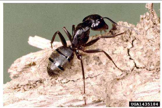
Fig. 4. Carpenter ant worker. (Note the attachment of the abdomen to the thorax and compare this with the termites in Figure 6)

Termites eat the wood in which they live. For this reason, unlike carpenter ants, termite workers are seldom seen outside their nest tunnels.