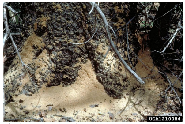
Fig. 2. Sawdust/frass from carpenter ants at the base of a tree.

SYMPTOMS: The presence of otherwise unexplained coarse sawdust beside a house timber ( Fig. 1. ), pole, or tree ( Fig. 2. ) usually indicates that carpenter ants are at work. They chew the wood into small fragments, which they discard outside the tunnel, thus forming a "nest" to use as a shelter in which to breed and from which to forage. Their food is varied: They gather sweet secretions from other insects (aphids, etc.) and plants; prey on other living insects; scavenge dead insects; and gather household foods, such as fats, sugar and other sweets. Their need to travel outside their wood tunnels in search of food (foraging trails) often reveals the location and extent of the colony.