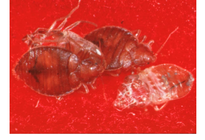
Shimmery cast skins (shown above with adult bed bugs), eggs, and bloodstains on linens point to a bed bug infestation. If you don't find live insects during your inspection, a pyrethrin-based spray can be used to flush them out of their crevices so you can confirm their identity.

Bites during the night...is the problem caused by the common bed bug, the bat bug, fleas, or mosquitoes? What you do depends upon which pest you're confronting.