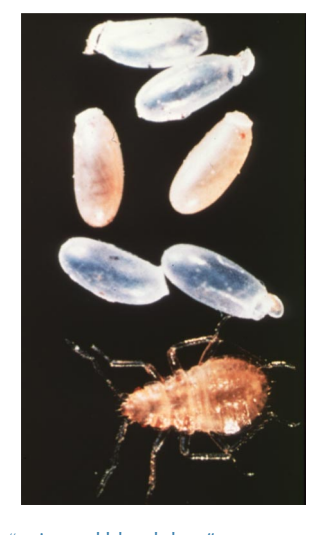
From "flat as a piece of paper" to "animated blood drop"—a common bed bug shown before feeding (top left) and afterwards (bottom left). At right, a newly hatched bed bug shown next to empty and maturing eggs.