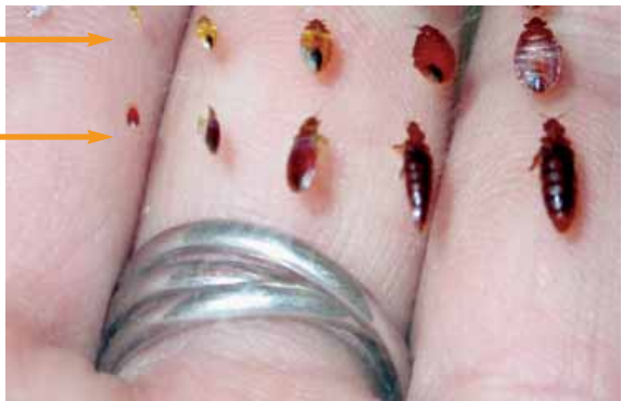
Various life stages shown on a human hand