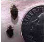
Adult bed bugs compared to a dime

What exactly are bed bugs? Bed bugs are blood-feeding parasites that bite people at night and hide during the day. They are tiny, less than 1/8 inch, wingless, chestnut brown in color, with flattened, generally oval-shaped bodies. They become swollen, elongated, and dark red after a blood meal. Bed bug bites may cause itchy welts on their victims. They often leave small dark spots on sheets and other surfaces. Bed bugs do not cause or spread any diseases but do cause mental anguish – no one wants to “let the bed bugs bite”!