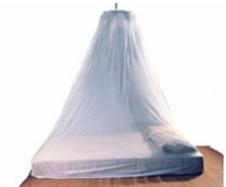
Once the bed frame has been inspected, and the mattress cleaned and sealed with a cover; a bed net can be used to keep additional bugs away while treatment commences.

<u>Note:</u> Chemical treatment may be part of an IPM plan. If you choose to treat the infestation with an insecticide, call a licensed, Professional Pest Control Operator for more information. Use the least toxic product available and follow all manufacturers' instructions.