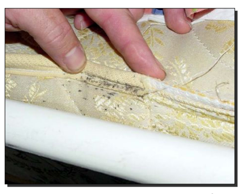
Blood spots on a mattress seam are often grouped. This is an indication of a current or past infestation of bed bugs.