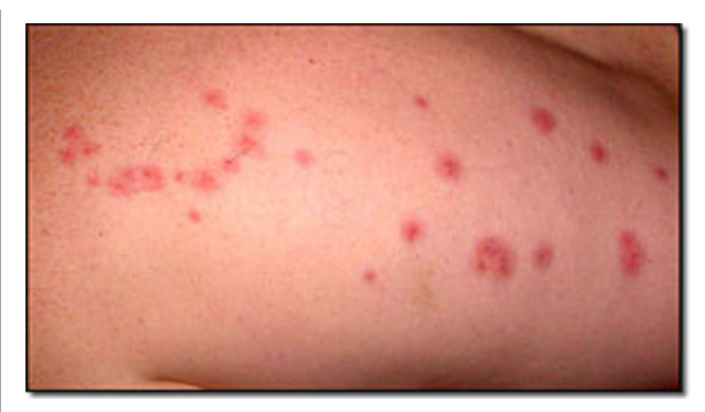
Reaction to bed bug bites. Bites are usually clustered on areas of the body not covered by night clothing.