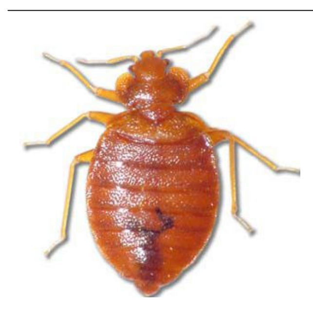
Adult Bed Bug

Bed bugs are insects, more specifically "true bugs". True bugs have piercing mouthparts that in most species are used for feeding on plants. However, some species of bugs will feed on animal tissues. Bed bugs have mouthparts, which are adapted to feed almost painlessly on the blood of people. Human-associated bed bugs found in the U.S, Cimex lectularius , have a flat, oval-shaped body with no wings, and are 4–7mm long. Their color is shiny reddish-brown but after a blood meal they become swollen and dark brown in color (see picture below). There are three stages in the bed bug's life cycle: egg, nymph and adult (see picture below). The eggs are white and about 1mm long. The nymphs look like adults but are smaller. Complete development from egg to adult takes from four weeks to several months, depending on temperature and the availability of food. Both male and female bed bugs feed on the blood of sleeping persons at night. In the absence of humans they can feed on mice, rats, chickens and other animals. Feeding takes about 10–15 minutes for adults, less for nymphs, and is repeated about every three days. Bed bug nymphs can survive for considerable periods (months) without feeding, depending on environmental conditions.