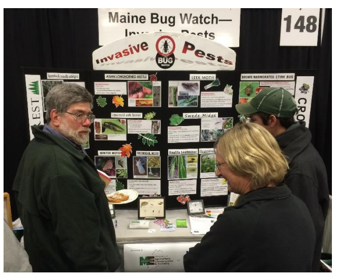
Maine Flower Show – Bug Watch booth