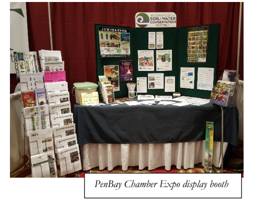
Participating in events like the PenBay Chamber Expo provided an opportunity for Knox-Lincoln to engage with local residents about invasive forest pests and distribute 50 forest pest packets.