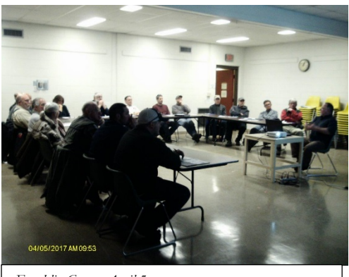
Franklin County April 5 program

Knox-Lincoln SWCD presented a program on Invasive Plants on June 7 and spent about ½ hour highlighting Invasive Forest Pests. IFP packets were distributed to the participants, two of whom received CEUs from BPC.