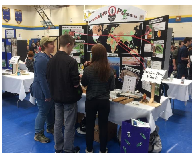
Maine Bug Watch Facebook cover promoting NISAW