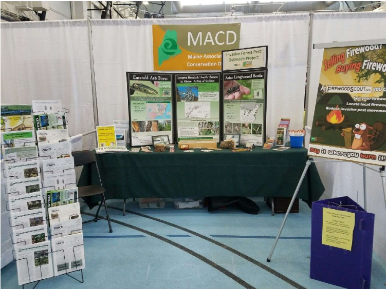
Invasive Forest Pest display at March Eastern Maine Sportsmen's Show, Orono