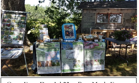
Open Farm Day, Jul 23 at Brae Maple Farm

Oxford and Washington Counties were able to engage with large numbers of people through three summer fairs and a festival, distributing a few hundred forest pests information packets.