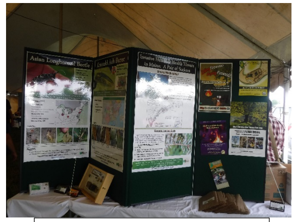
Maine Farm Days display, Aug 23-24, Clinton

Public events staffed (and unstaffed) during the second quarter were varied with many held during the height of summer fair time. The events have proven to give Districts' outreach the "most bang for our buck" as they are a great way to engage children, families, professionals, and the general population and provide information about invasive forest pests. Maine Farm Days in particular was successful working in tandem with the invasive plants display to draw people into the booth. There was a good representation of the public attending the Farm Days event including farmers, woodland owners, families, and the general public. Nearly