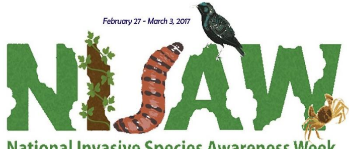
National Invasive Species Awareness Week