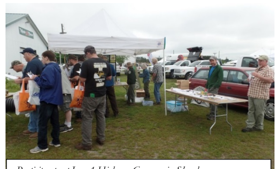
Participants at June 1 Highway Congress in Skowhegan

and provide information about invasive forest pests. The Highway Congress in particular was successful with incorporating a "Time Out for Training" educational activity, presentation, and quiz that was about 5-10 minutes long and given to several people at a time. Approximately 175 people from 124 towns participated in the training throughout the day, each of whom received an IFP packet.