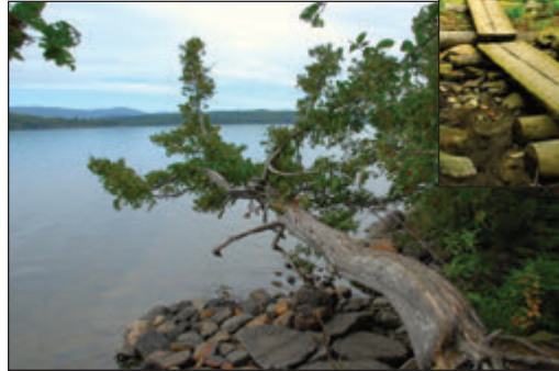
Gil Riley photo.