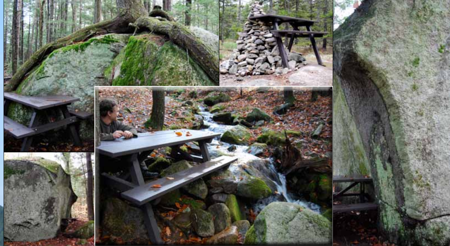
Twelve picnic table "sculptures" were created in the park by Artist Wade Kavanaugh through Maine's Per Cent for Art act.