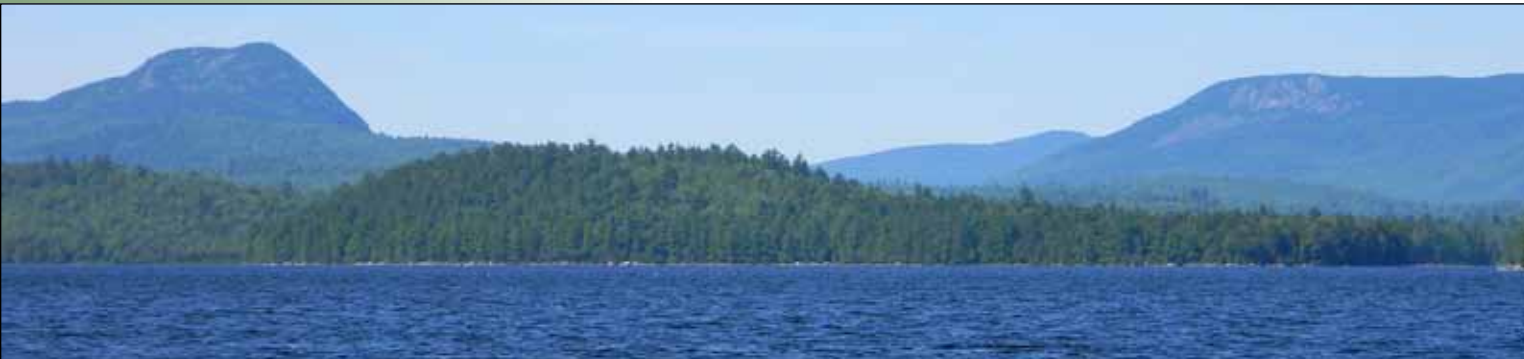
Peaks-Kenny State Park serves as a gateway to Maine's North Woods.