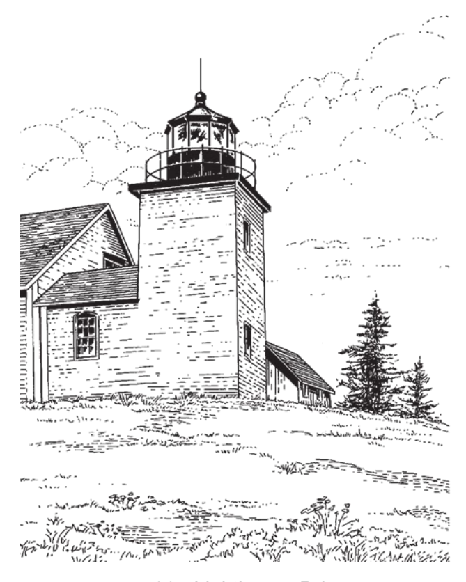
207 Lighthouse Rd. Stockton Springs, Maine 04981

Open from 9:00am to sunset, Memorial Day through Labor Day. An entry fee is charged.