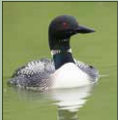
Loons may be seen and heard at the park.

Dog sledding, ice fishing, ice skating and ice-skate sailing are popular winter pastimes.