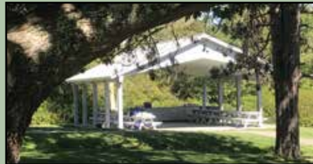
Picnic shelter may be reserved.