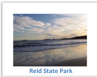
Reid State Park