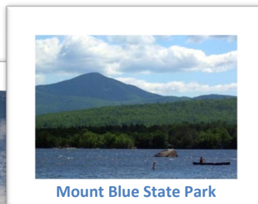
Mount Blue State Park