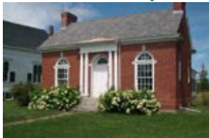
Gallison Memorial Library