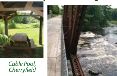
Cable Pool, Cherryfield

Location: Trail crosses ME 193 in Cherryfield.